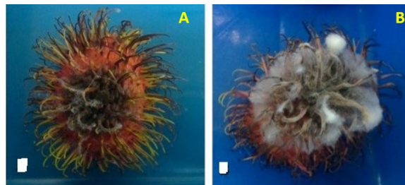
Figure 3. Rambutan fruit rot. (A) Fruit rot lesion. (B) Mycelia growth from the lesion.

Symptoms of fruit rot in mature and immature fruits are characterized by light to dark brown and sometimes black areas with water-soaked lesions on the surface of fruits. The lesions developed into the pericarp, causing blackening and drying of the infected parts (Figure 3A,B). The pericarp may crack, exposing the flesh [159,164].