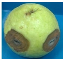
Figure 2. Anthracnose of guava.

Prior to taxonomic reevaluation of the genus Colletotrichum , Colletotrichum gloeosporioides sensu lato was considered the most common species associated with guava anthracnose in several guava-producing countries [204–207]. After identification based on the phylogeny of multiple markers, several species of Colletotrichum gloeosporioides and Colletotrichum acutatum complexes have been reported as the causal pathogens of guava anthracnose. Species of the Colletotrichum gloeosporioides complex have been reported as pathogens of guava anthracnose in Italy [66] and those of the Colletotrichum siamense complex in India and Mexico [67,68]. Within the Colletotrichum acutatum complex, so far, three species have been reported as the causal pathogens of guava anthracnose, Colletotrichum abscissum in Brazil [69], Colletotrichum simmondsii in Brazil [70], and Colletotrichum guajavae in India [71].