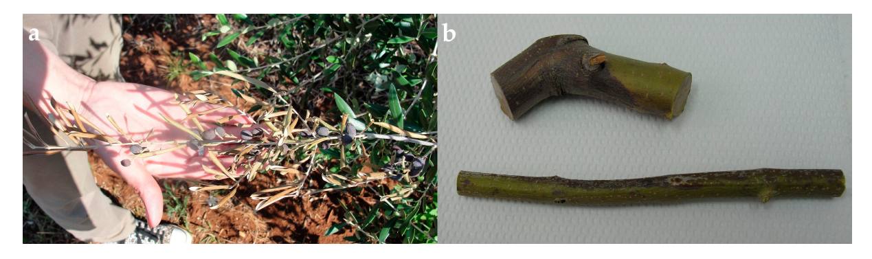
Figure 1. (a) Disease symptoms on olive tree in orchard. (b) Branch segment with bark discoloration taken for analysis.

The symptoms of the disease in the field can be described as the dieback of twigs and branches (Figure 1), brown internal necrosis on branches and under the bark, leaf necrosis, and fruit dieback. The symptoms were observed on trees from cultivars 'Porečka rosulja' and 'Buža'. Symptoms affect only part of the trees. Morphologically similar fungal colonies were retrieved from all 10 samples.