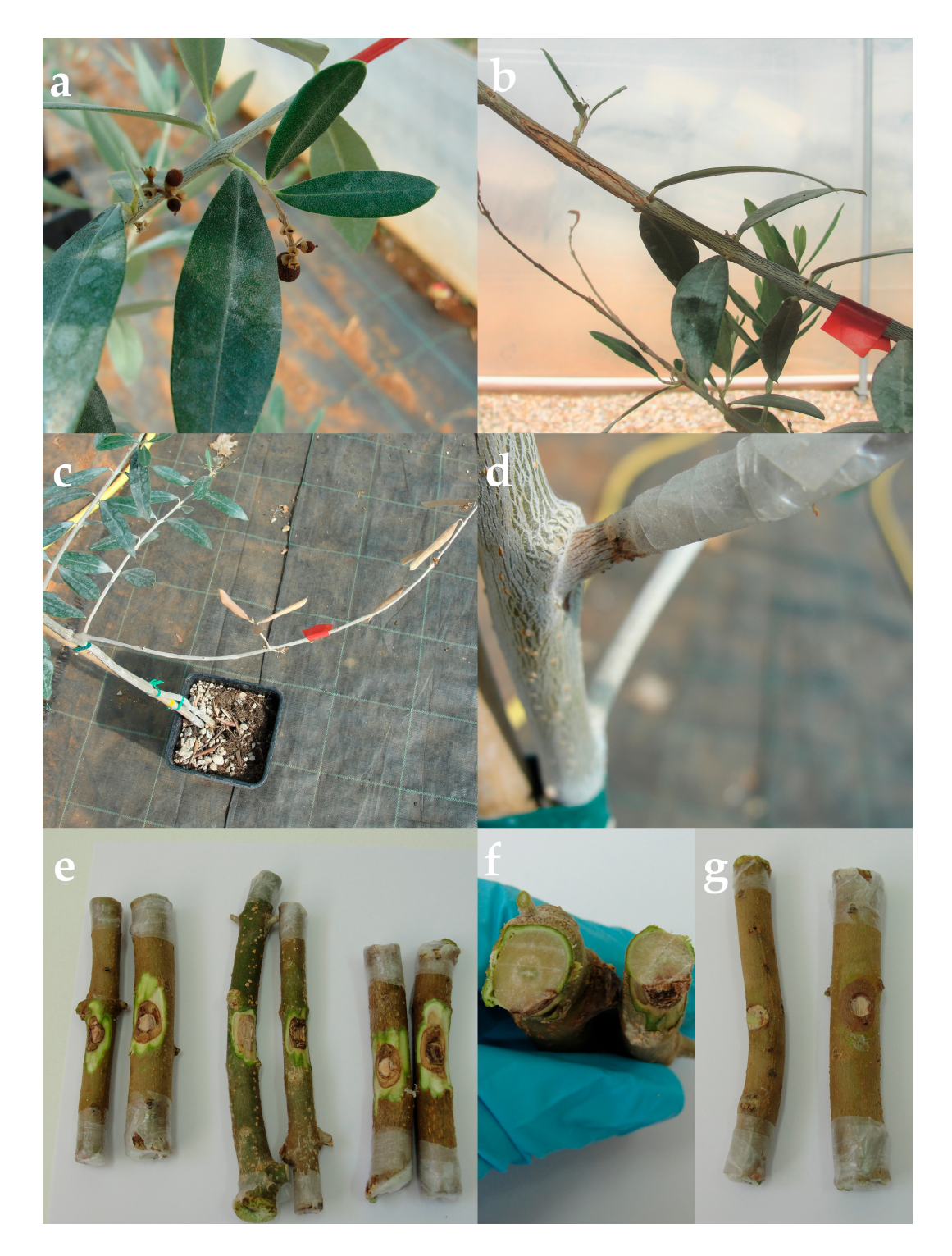
Figure 4. Disease symptoms on olive trees used in pathogenicity tests in the greenhouse after 6 months at 25 °C: ( a ) fruit collapse, ( b ) branch necrosis, ( c ) branch dieback, ( d ) bark discoloration. ( e , f ) Disease symptoms on olive branches used in pathogenicity tests in the laboratory: ( g ) Difference between the control branch inoculated with pure PDA plug (left) and the branch inoculated with C. pruinosa (right).