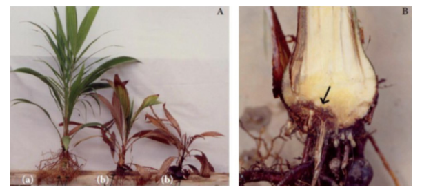
Figure 2 Symptoms of Ganoderma disease visually: (A) on stems and leaves above ground level; (B) internal symptoms in the presence of decay at the base of the split stem.

After the tested OP seedlings were twelve months old, the BSRs were dismantled to observe the symptoms of internal diseases with a system scoring as given in Table 2.