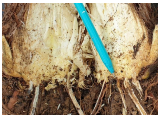
Figure 3 Necrotic root that occurs in oil palm seedlings by inoculation of Ganoderma . It can be seen that the necrotic tissue has started at the base of the BSR.

In the GanoEF treatment, the DS reached 5.23%, which was significantly ( P<0.05 ) lower when compared to positive control treatment (11.1%). The DS describes the level of damage in the form of necrotic symptoms that occur in the BSRs of OP seedlings (Figure 3). This study showed evidently that GanoEF could inhibit and developed antagonistic effects on Ganoderma growth in OP seedlings. Earlier, Turner 29 observed that examinations of oil-palm estates in Malaya revealed that the frequency of Ganoderma infection of OPs was highest on newer plantings on previously borne coconut palms.