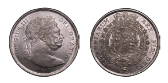
1741) Halfcrown 1817 Bull Head ESC 616, Bull 2090 EF/GEF the obverse with some hairlines (£75 - £150)