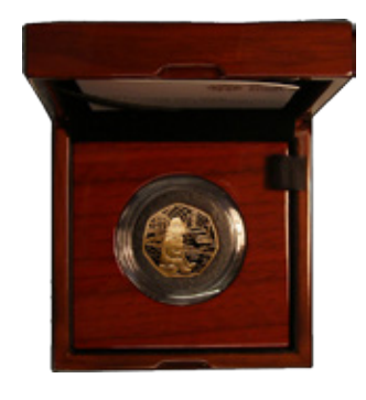
494) Fifty Pence 2019 Stephen Hawking S.H59 Gold Proof FDC

493) Fifty Pence 2018 Paddington Bear 60th Anniversary - At The Station, Gold Proof FDC in the Royal Mint box of issue with certificate and booklet (£600 - £800)