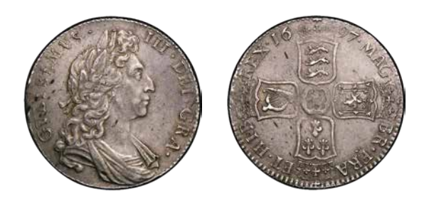
1697) Halfcrown 1698 DECIMO ESC 554, Bull 1034 Fine (£90 - £120)

1696) Halfcrown 1697 First Bust, Large Shields, Later Harp ESC 541, Bull 1021, GEF in an LCGS holder and graded LCGS 65, the finest known of 5 examples thus far recorded by the LCGS Population Report, high grade William III Halfcrowns are much harder to locate than the Shillings and Sixpences of the same period, and to date this LCGS graded 65 example is the finest recorded by them (£650 - £850)