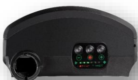
Control panel with adjustable air flow LED's