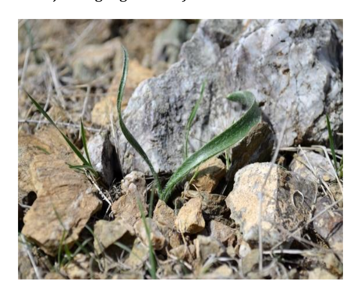
Fig.1. Allium Alaicum. [Near osh]

scale of the species we are studying is Andijan and Osh regions. To date, 50 allium alixes belonging to 2 populations have been identified [2]. As we can see, the division of the region is observed in this plant, which is one of the main signs of decline [3]. Features such environmental variability, resilience, and resilience may be reduced or completely lost for this species. More than 250 species of allium are found in Central Asia and Southwest Asia. In Central Asia, populations of especially tasty and medicinal wild allium have been growing for many vears. Detailed information understanding of the population can be found in Dobransky-1968. Onions and garlic are eaten in these parts of Central Asia. There are more than 80 endemic species in the region [4], and data on the use of such species by the local population may play a key role in the conservation of the endangered species. That is, Allium Alaicum can be consumed by the population, and people living in such an area value onions as "Allium motor camelin Levicher" (motor, moy-moddor, modor - means in Tajik language health).