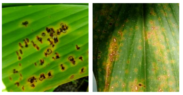
Fig. 3. Leaf spot symptoms in various type

areas by wind, water, or through the movement of soil (Agrios, 1988). On occasion, the fungus can reach the fruit and contaminate the seed. This occurs when the soil moisture is high and the temperature is relatively low (Agrios, 1988). In addition the vascular wilting, the fungus can infect other parts of the plant close to the soil to induce root, stem, and corm rots. When seedlings are infected by Fusarium, damping-off may lf harvested fruits are occur. contaminated with the funaus. postharvest diseases such as "pink or vellow molds" on vegetables and develop. ornamentals This is can especially important on root crops (tubers and bulbs), as well as on low-lying crops like cucurbits and tomatoes (Agrios, 1988).