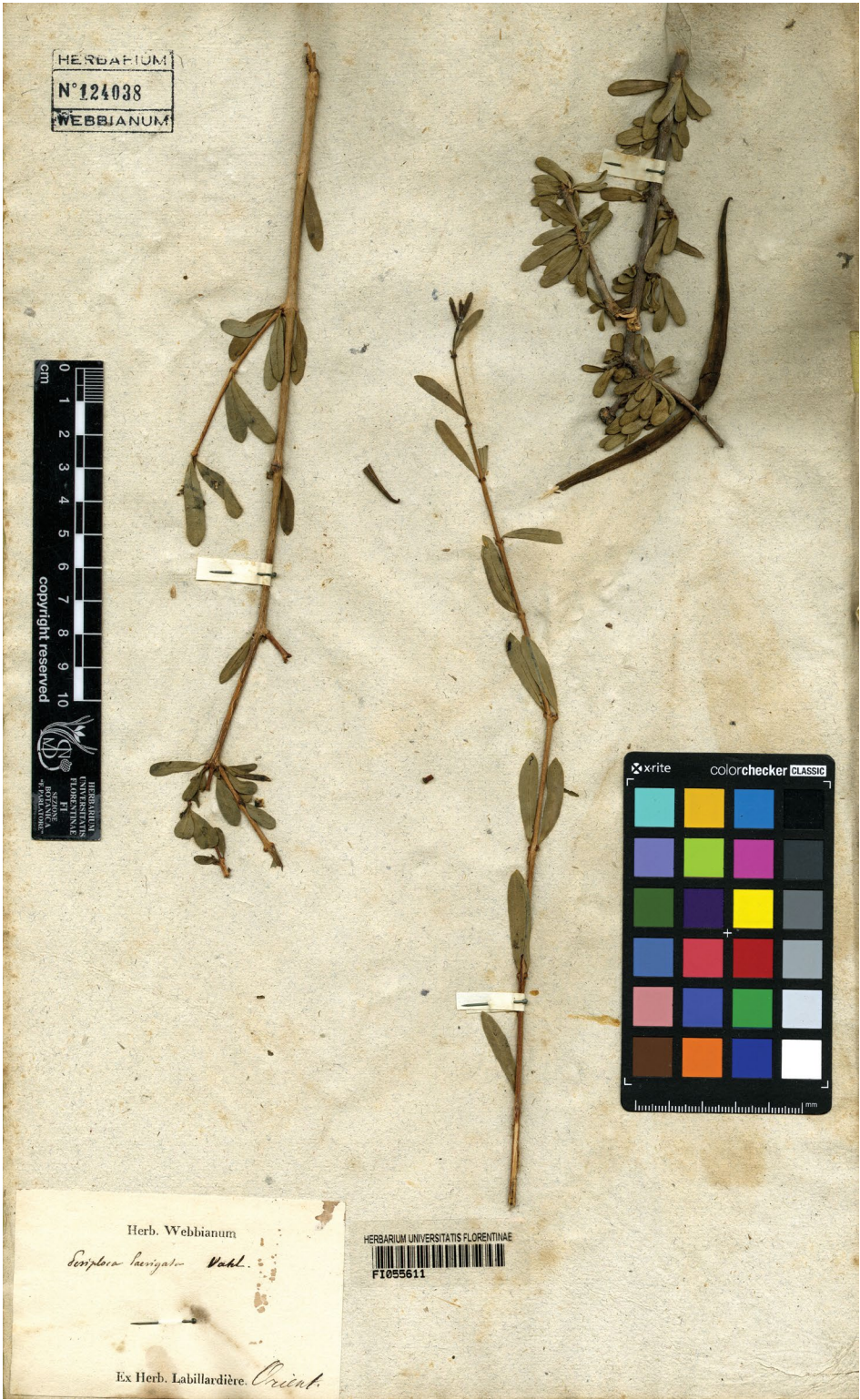
Figure 3. Lectotype of Periploca angustifolia Labill. (Labillardière s.n., FI055611). Photograph by and courtesy of Herbarium FI; reproduced with permission.