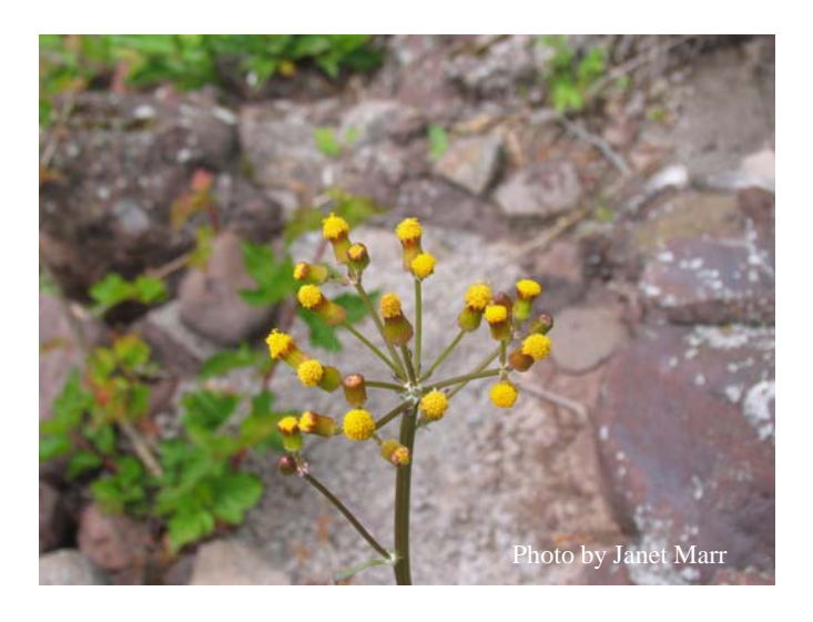
Close-up of rayless heads in Senecio indecorus

about equal length. The leafy stems, which have fewer stem leaves on the upper portion than the lower, bear leaves that are narrow, sharply-toothed and pinnatifid (comb-like), becoming reduced in size upwards. Yellow flower heads, numbering as few as 6 to as many as 40, are borne on long stalks in a flattopped, terminal inflorescence. A row of purplish tipped bracts (collectively the involucre) occurs at the base of each head (i.e. subtends). The heads often lack ray flowers in this species, as exhibited by many Michigan specimens. However, specimens from Wisconsin tend to have some weak rays developed (Barkley 1964) and plants recently found on Isle Royale exhibit this characteristic also. This species is most likely to be confused with the more common and widespread S. aureus (golden ragwort) or S. pauperculus (Northern ragwort). S. aureus can be distinguished by the presence of ray flowers that are at least 6.5 mm long or longer, versus rays that are absent in S. indecorus or when present are shorter, and at least some basal leaves that are strongly cordate (heart-shaped). S. indecorus is perhaps most likely to be confused with S. pauperculus, which can be distinguished principally by its basal leaves, which have blades that are lance-shaped and taper toward the base without being abruptly contracted.