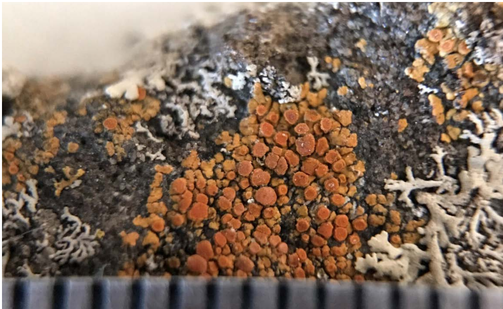
Figure 2. Caloplaca (= Squamulea ) subsoluta from exposed sandstone; scale intervals are 1 mm. ( Ladd 18506 ).