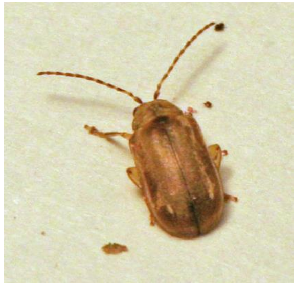
Figure 8 Viburnum leaf beetle adult

The roses are ready to bloom (or maybe already blooming) and then there it is, a hole (or many holes) in the leaf. Someone is chewing on your rose plants. The rose slug sawfly ( Endelomyia aethiops ) is a likely culprit, but there are other species willing to damage your roses as well. The larvae are greenish yellow with orange heads (fig. 9) and are about ½ inch long when fully grown. They resemble caterpillars but are not. They are covered in slime that helps protect them from predators. When larvae mature, they lose their slimy coverings. The rose slug sawfly feeds on the upper layers of the leaf, leaving behind