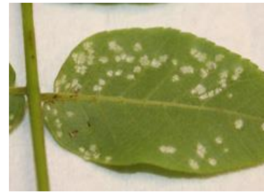
Figure 14 Lower leaf surface showing white fungal spots

Management: Downy leaf spot attacks hickories and walnuts but is not a significant threat to the trees. Witches' brooms can be pruned to improve the appearance of the tree. Chemical management is not recommended.