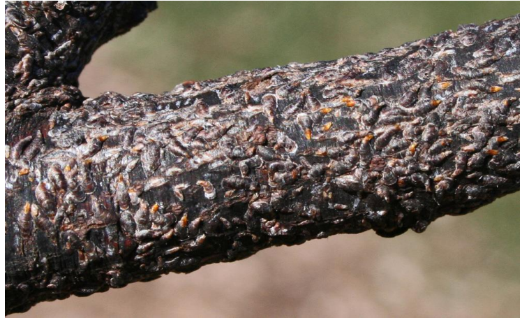
Figure 3 Large population of oystershell scale

As long as we are talking about scale, let's keep going. Chris Henning of the Chicago Botanic Garden tells me that crawlers of pine needle scale ( Chionaspis pinifoliae ) are out. Pine needle scale overwinters as eggs under a female adult. The female looks like a white, tear-drop shaped fleck on a pine needle (fig. 4). After the eggs hatch, the tiny crawlers move to a new site on the host plant to feed. They suck sap from the needles. As the crawlers develop, they secrete a white, waxy covering over their bodies. By late June or early July, they reach maturity, and second-generation eggs are laid. Second generation crawlers begin to appear in late July to early August. A heavy infestation will cause needles to turn yellowish brown. Pine needle scale does not produce honeydew.