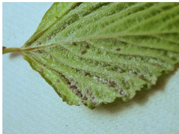
Figure 11 Woolly birch aphid tucked in on underside of leaf

The woolly birch aphid ( Hamamelistes spinosus ), however, has two hosts, birch ( Betula spp.) and witch-hazel ( Hamamelis spp.). The insect overwinters on the bark of a birch tree. When spring comes, the female will give birth to live young on the undersides of new leaves. The feeding of