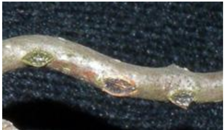
Figure 12 Fruiting bodies of Eastern filbert blight

Eastern filbert blight, caused by the fungus Anisogramma anomala , has been reported to The Morton Arboretum Plant Clinic a couple of times this month on Harry Lauder's walking stick ( Corylus avellana 'Contorta'). This disease has largely been studied in Oregon, where they have cool wet winters, so the lifecycle may be different in other parts of North America (Sinclair and Lyon). The pathogen requires 2-3 years to complete its life cycle, the length depending on the host's susceptibility. The symptoms include football-shaped pustule-like bumps (fig. 12) in single or multiple rows. The infected branches may have dead leaves attached. The plant will decline, but may not die for several years.