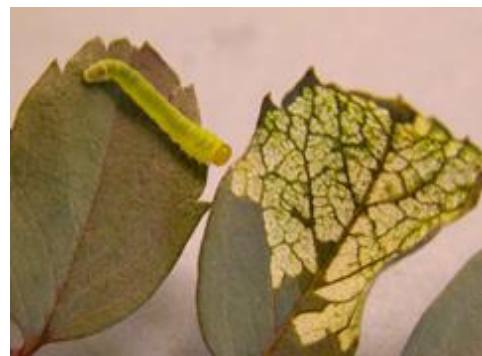
Figure 9 Rose slug sawfly larva and damage