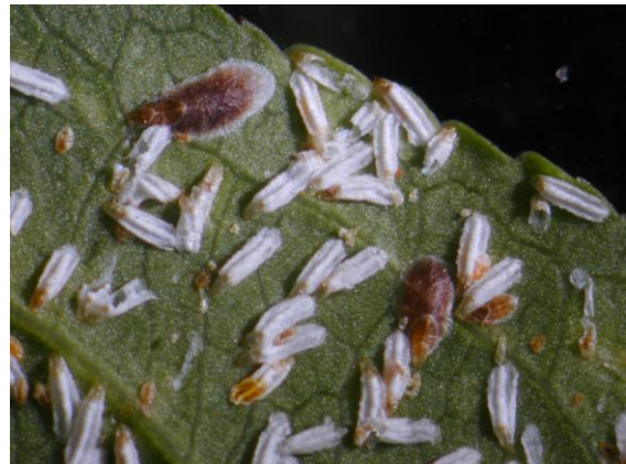
Figure 2 Euonymus scale adults, male (white) and female (brown)

Euonymus scale ( Unaspis euonymi ) is one of those insects that we can find all year round. Right now, we are seeing the overwintering adults. Even though we see the adults all season, the young crawlers are out and active for only a short time (and now is the time to look). Many insecticide treatments are targeted at the crawlers when they emerge, which is generally around the early part of June (GDD 500-700). The crawlers are a pale, yellow-orange. Male adult scales are white, and the females are brown and oystershell-shaped (fig. 2). Euonymus scale overwinters as mated females on plant stems. Euonymus scale does not produce honeydew.