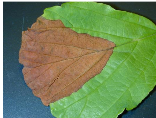
Figure 15 Blotched leaf

We are seeing symptoms of blight on witchhazel ( Hamamelis species), caused by the fungus Phyllosticta hamamelidis . In the past, we have reported this as a leaf spot or blotch because the primary symptom has been irregular leaf blotches with very narrow dark-brown margins (fig. 15). The lesions often, but not always, begin at the leaf base and extend upward and outward eventually covering the entire leaf. This year we are reporting it as a blight as we are seeing a more severe infection that is killing the tip of the twig and all the attached leaves (fig. 16). This disease can defoliate witchhazels when severe.