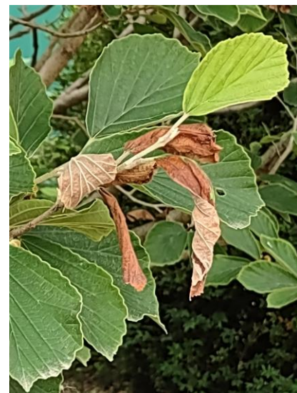
Figure 16 Blighted leaves

Management: Prune branches and give plants ample space to improve air circulation. This fungus overwinters in fallen leaves; therefore rake and destroy leaves to reduce the source of inoculum. Fungicides can be applied in spring when leaves emerge.