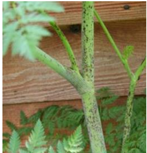
Figure 18 Spotted stem of poison hemlock

Management: Plants can be cut down or dug out. This should be done before the plants go to seed and is most easily done when plants are small. Cover your skin during this process. Do NOT burn the plants. In spring, small, actively growing plants may be treated with an herbicide containing glyphosate.