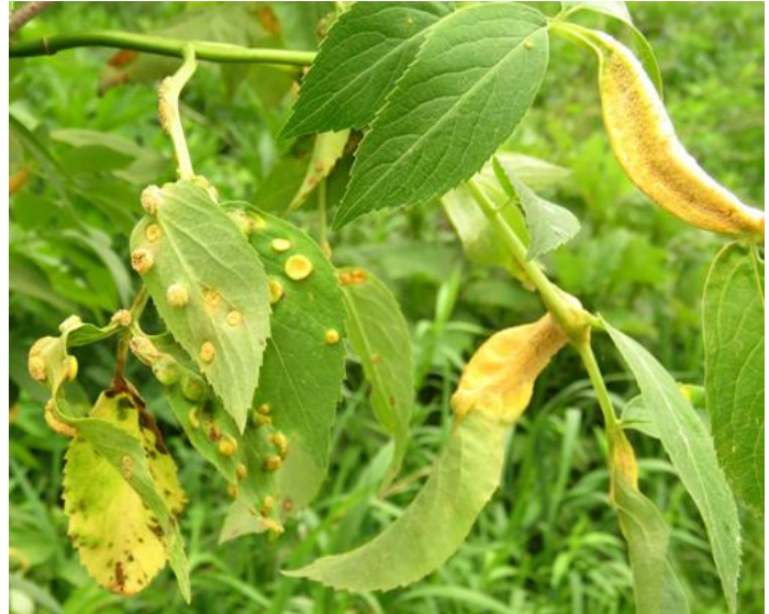
Figure 13 Elderberry rust

We often spend a lot of time talking about the three cedar-rust diseases, but there are other interesting rust diseases. One of them has shown up on elderberry on the Arboretum grounds. Dr. Stephanie Adams and Horticulture Display Manager, Abbie Rea, reported finding this, and then one of volunteers saw it on grounds and sent me a great photo. This is a very cool looking disease as it causes the stems to grow out of proportion (fig. 13 on the right side of the photo). We have seen this rust from time to time in natural areas, but not usually in landscapes. In researching this rust on elderberry, we have found that the alternate host is sedge. Both hosts tend to be in natural areas, so this might explain why the disease is showing up there. Since we are now growing more sedges in the landscape, we might start seeing it more. Time will tell.