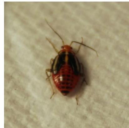
Figure 6 Four-lined plantbug nymph