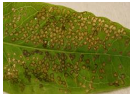
Figure 5 Four-lined plantbug damage

Good website: https://extension.umn.edu/yard-and-garden-insects/four-lined-plant-bugs