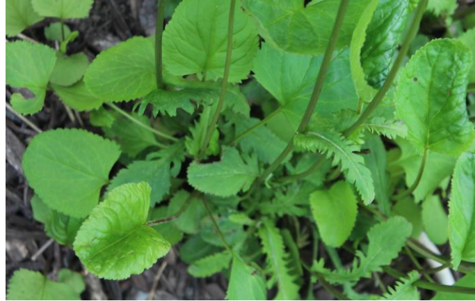
Figure 21 Golden ragwort

Golden ragwort (fig. 21) is a cousin to butterweed and has similar yellow flowers that also provide for pollinators. The basal leaves of this plant are oval to almost rounded, with rounded teeth. Leaves higher on the stem are much smaller, narrower and deeply dissected. The leaves of this plant also contain alkaloids.