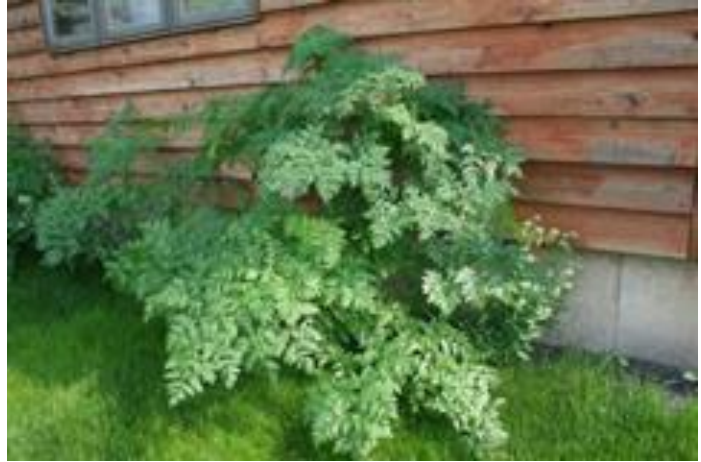
Figure 17 Poison hemlock, first year

We have had several reports of poison hemlock ( Conium maculatum ) being found in residential yards, as well as along highways. Poison hemlock (fig. 17) is a member of the carrot family (which contains both edible and toxic plants, so beware!!). Most members of this family have the same type of umbrella-shaped flower cluster known as an umbel. Because the flower cluster of Queen Anne's lace and the flower cluster of poison hemlock look similar, plants may be incorrectly identified. This can lead to contact with a dangerous plant.