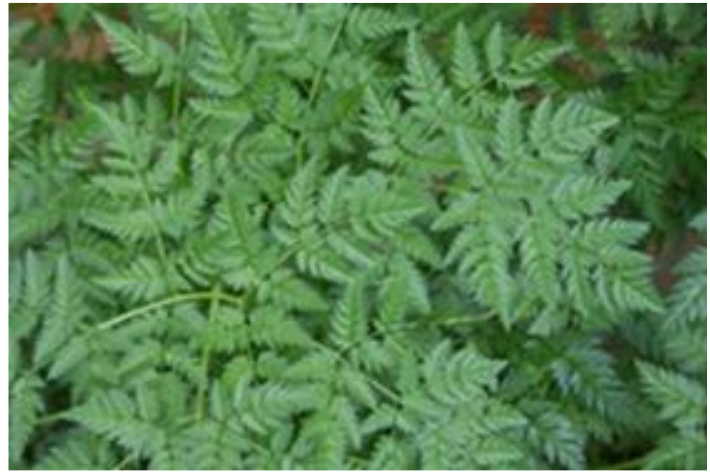
Figure 19 Foliage of poison hemlock