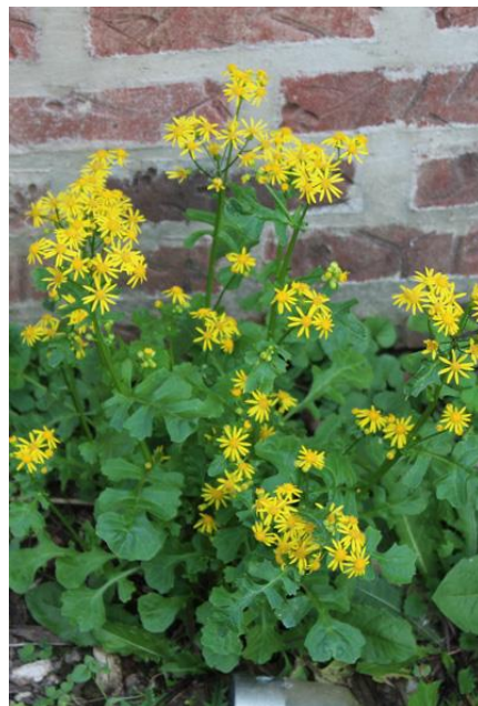
Figure 20 Butterweed

Butterweed is a native of Illinois, but is far more common in the southern half of the state than it is in the Chicago region. Yet, we have had numerous reports of it for the last 2 or 3 years. I even found one in my yard. This plant does well in partial to full sun and is reported to prefer a loamy soil, with moist to wet conditions. The one in my yard was growing up against the chimney in an area so dry and hard I have not even attempted to garden there. I was so impressed by this plant’s tenacity that I let it stay there. It keeps coming back, despite the poor soil. Butterweed is actually fairly attractive, with yellow daisy-like flowers, that provide nectar for pollinators. It flowers for 6 to 8 weeks. The leaves are interesting too, being deeply and irregularly cut (fig. 20). Those leaves contain alkaloids which prevent rabbits and deer from feeding on them.