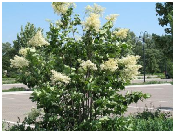
Figure 1 Japanese tree lilac