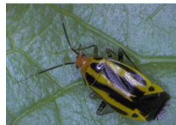
Figure 7 Four-lined plantbug adult