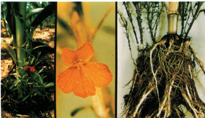
6. Witchweed ( Striga )