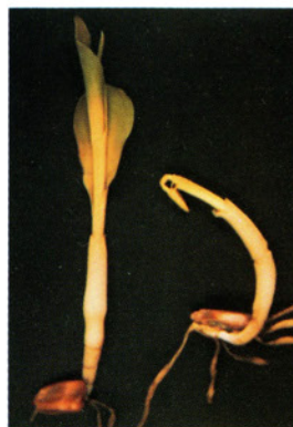
11. Triazine injury: cyanazine (Bladex)