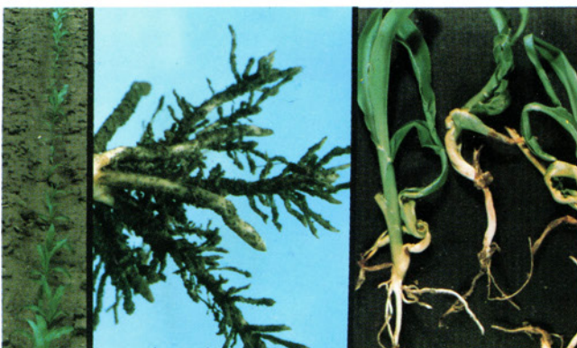
10. Dinitroaniline injury: L & C. trifluralin (Treflan); R oxyzalin (Surflan)