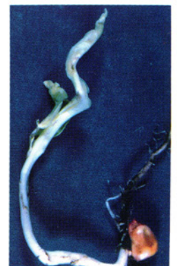
13. Benzoic acid (Banvel) & alachlor (Lasso) injury