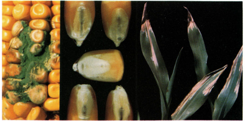
2. Penicillium kernel rot and seedling blight