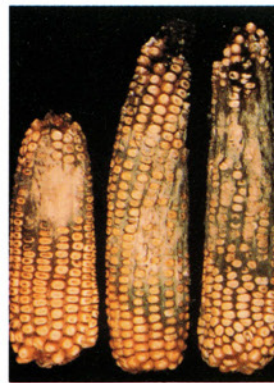
4. Rhizopus ear rot