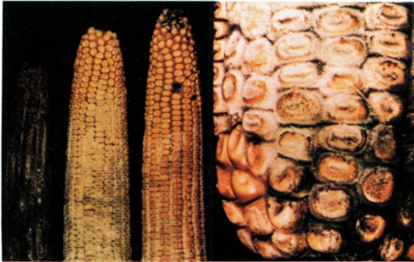
3. Gray ear rot