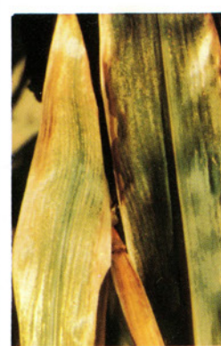
8. Fluoride injury