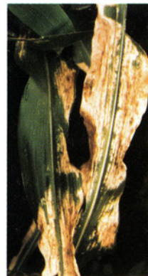
7. Chlorine injury