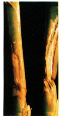
9. Bacterial stalk rot