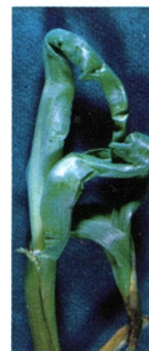
12. Benzoic acid injury