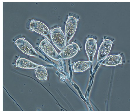
Microbes such as these stalked ciliates help remove bacteria and organic material from the water in secondary treatment.

How do we know we're doing a good job? Wastewater treatment facilities are regulated under the Environmental Protection Agency's National Pollutant Discharge Elimination System (NPDES) permit program. NPDES permits set rigorous standards that the water from the plant must meet. The National Association of Clean Water Agencies has given the Egan WRP the association's highest awards for compliance with these standards. We also see the benefits of our work resulting in increased recreation on the waterways, such as kayaking and canoeing, a rebounding aquatic habitat and increases in fish species. We're reducing energy use at our facilities with a goal of reducing greenhouse gas emissions, and we're recovering valuable resources and expanding the use of biosolids throughout the region.