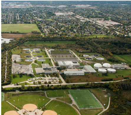
Egan Water Reclamation Plant

The John E. Egan Water Reclamation Plant (WRP) is one of seven wastewater treatment facilities owned and operated by the Metropolitan Water Reclamation District of Greater Chicago (MWRD). The MWRD is the wastewater treatment and stormwater management agency for the City of Chicago and 125 Cook County communities. We work every day to mitigate flooding and convert wastewater into valuable resources like clean water, phosphorus, biosolids and natural gas.