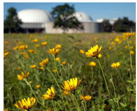
Native prairie on the grounds of Egan WRP.

About Egan WRP • 550 South Meacham Road Schaumburg, IL 60193 • 75 employees • 9 buildings on 275.4 acres • In operation since December 16, 1975 Receiving Stream • Upper Salt Creek Treatment Volume • 30 million gallons/day (avg.) • 50 million gallons/day (max.)