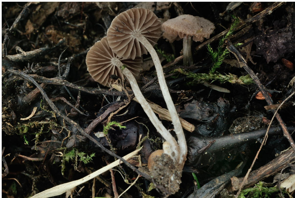
Fig. 1. Psathyrella lyckebodensis (GJO 90035).

The specimen is deposited in GJO (Universalmuseum Joanneum in Graz).