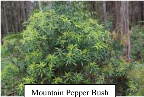
Mountain Pepper Bush

Lomatia silaifolia Crinkle bush, Ozothamnus diosmifolius Sago flower, O. obcordatus Grey everlasting, Cassinia straminea , Golden cassinia (mistaken for Grey Everlasting initially), Jacksonia scoparia Dogwood, Podolobium ilicifolium Native Holly, Tasmannia stipitata Mountain pepperbush (– not in flower but seen abundantly along roadside and some people can verify that the leaves are very peppery when chewed !) Billardiera scandens Apple berry vine, Callicoma serratifolia White Alder or Black wattle, Hibbertia scandens Climbing Guinea flower, Hibbertia sp. (very small flower) Hardenbergia violacea Sarsaparilla, Dianella revoluta Flax lily, Dampiera purpurea Mountain dampiera, Stylidium graminifolium Grass trigger plant, Solanum amblymerum Spiny kangaroo apple.