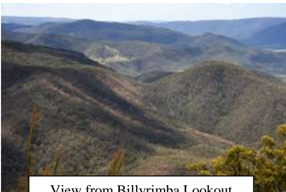
View from Billyrimba Lookout

We stopped to look at the showy White Alder (or Black wattle) trees Callicoma serratifolia in bloom, and stopped again at the turn-off to the lookout to see the Mountain Pepper bush Tasmannia stipitata which unfortunately had finished flowering since we saw it on our pre-outing trip. A couple of us sampled the leaf and can verify that it is very peppery! The clouds cleared for us at the