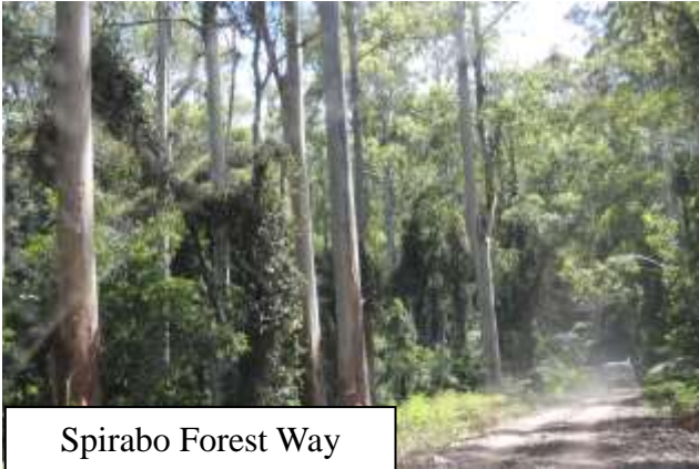
Spirabo Forest Way

I was surprised when 19 people turned up for the day, as I was expecting about 6 with the weather forecast and the very unstable weather lately. We set off at 9.00am and stopped at Tenterfield's Rotary Park for a comfort stop before going on to Ottobeuren Park at the Dam for morning tea, with a chance to spot