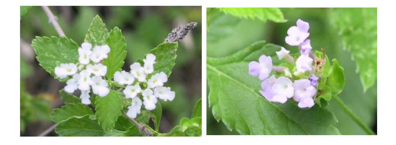
Desert Lantana, or Lantana macropoda, in white (left) and pink (above) color forms.