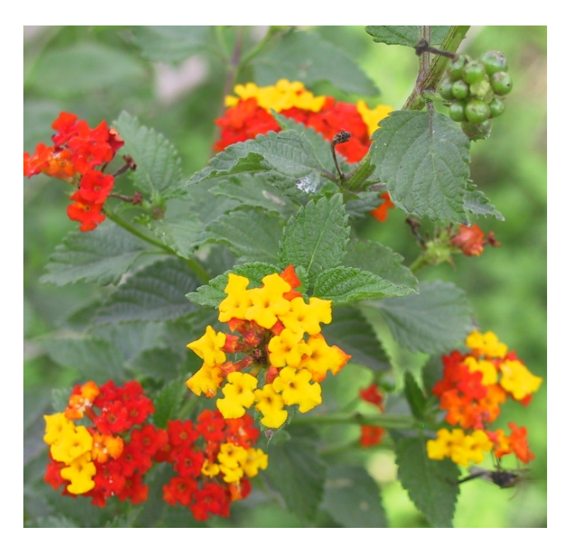
Texas Lantana, Lantana urticoides (previously known as Lantana horrida)