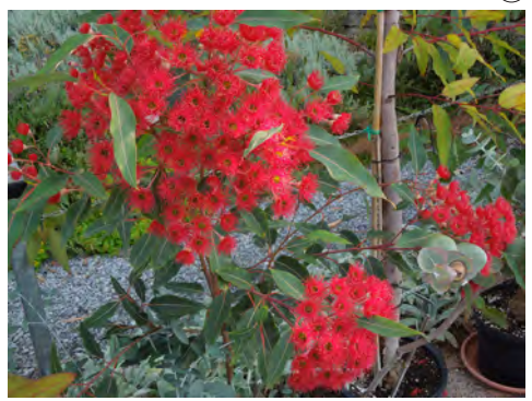
Grafting Corymbia ficifolia resulted in a lovely surprise.

pieces of a compact red flowering variety that a friend kindly sent me last year on C. ficifolia seedlings and now, 13 months later, the plants are flowering profusely! Those are the lovely surprises that make growing Aussie plants truly rewarding.