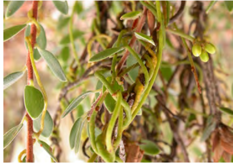
Cassytha pubescens parasitising Brachyloma daphnoides(Daphne Heath).

Interestingly, the seedling stage of Cassytha grows independently for the first 6–8 weeks after germination. It develops a short root that dies back once the vine has found a host and wrapped itself securely around it. The soil seed bank would allow the establishment of a new population in the event of fire destroying the adult plants.