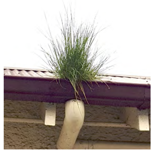
A grass valiantly poking out above the gutter.

Grasses self-seed easily, almost to the point of being problematic, and in the part of my garden with indigenous plants, this area is filling quite quickly. I had several Poa labillardierei in my backyard but found this too aggressive so have evicted them. But when I drove around a corner near Mont Albert Railway Station and found a grass valiantly poking out above the gutter, I reckoned that epitomised a creepy crawly. (A)