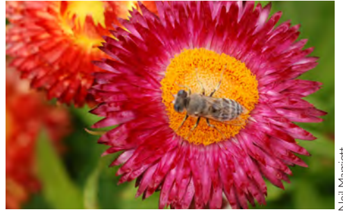
Native bee on Xerochrvsum bracteatum.