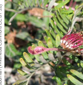
Grevillea caleyi (Caley's Grevillea)

Weddin Community Native Nursery at Grenfell, NSW, is a volunteer-run, not-for-profit organisation trying to rescue many of its local native plants – G. lanigera Grenfell form and Prostanthera ovalifolia Grenfell form (Brundah Mint Bush) amongst them – that are quickly disappearing because of predation and ground degradation of feral goats, pigs and rabbits.