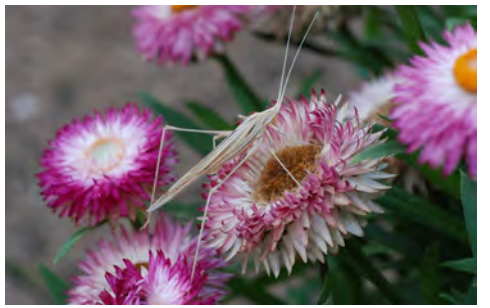
Beautiful grasshopper or katydid.

During the late heat of autumn, we were thrilled to find that our 'Great Aussie Daisies' were being visited by a varied array of native bees and wasps. From a distance, we couldn't smell the flowers, however on smelling them close up we discovered that they have a very pleasant, albeit mild sweet perfume. This is clearly what is attracting the native pollinators. Here are some of the visitors to our garden attracted by the daisies.