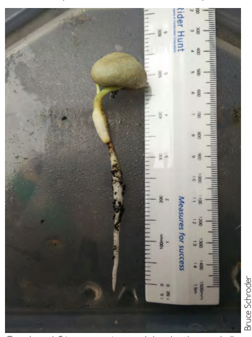
Germinated Crinum arenarium seed showing the new bulb forming below the large seed and the radicle below that.

Calostemma and crinum are both extremely easy to propagate from seed, if you can obtain it. Seed of both genus is recalcitrant, meaning you cannot stop it from germinating! It must therefore be sown extremely fresh. This of course means you need to be in the right place at the right time to collect it, especially given the rapid passage of time between commencement of seasonal growth and seed set. Their general occurrence in relatively remote locations doesn't help matters. Seed is certainly never