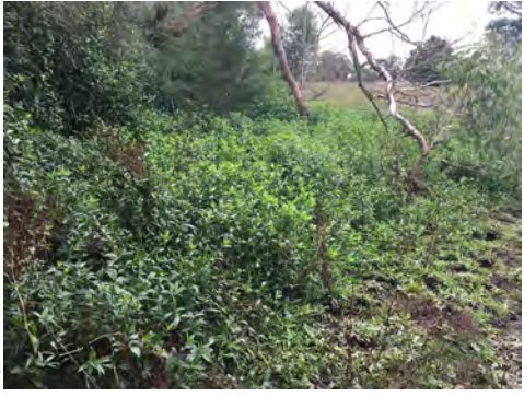
Alligator Weed found growing in a drain at a property on the Mornington Peninsula.

Agriculture Victoria biosecurity officers inspected the property, then proceeded to trace the Alligator Weed infestations on to two further properties, upstream and downstream of the reported infestation.