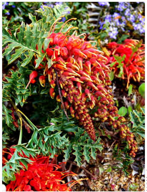
Grevillea bipinnatifida (Grape Grevillea)

Coming from the rugged south coast of WA, this banksia has proven to be one of the most hardy in nearly all soils, both acid and alkaline. The typical form has lovely burgundy red flower spikes, however the rare yellow-flowered form