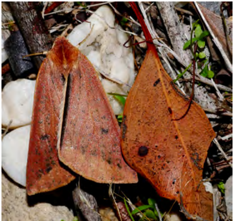
Cycloprorodes melanoxysta (left) next to a leaf (right).

600 moth species from the Brisbane Ranges just waiting for the next booklet. It will profile species found west of Melbourne in a similar fashion to the current publications. I send out a request to all APS Vic members who have visited the area and photographed Lepidoptera. Please send me the records and, if you are willing the images to verify species.