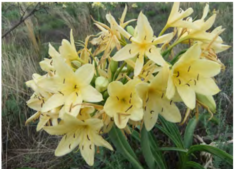
Crinum luteolum in flower.