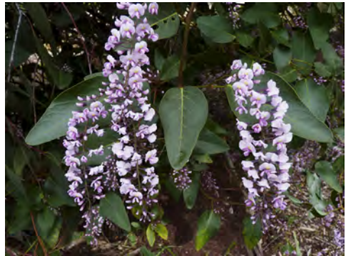
Growing Australian September 2019