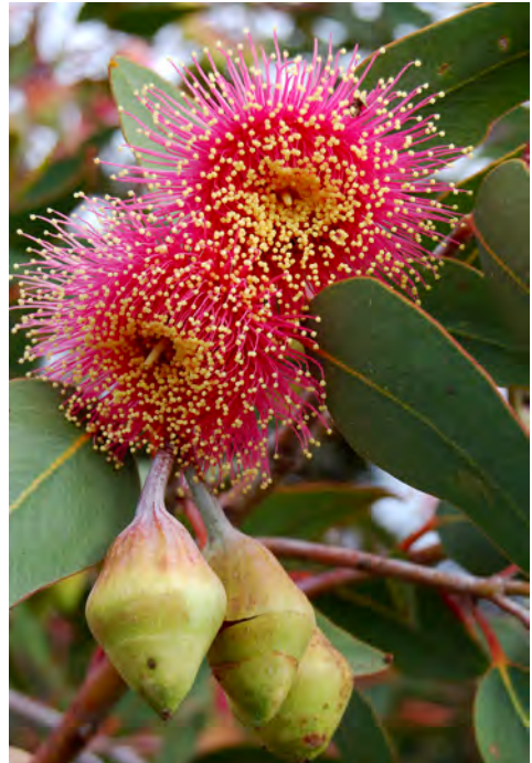
Eucalyptus caesia ssp. magna 'Silver Princess'

This superb eucalypt needs little introduction as it is so widely grown. However it is still one of the very best small gums for attracting birds