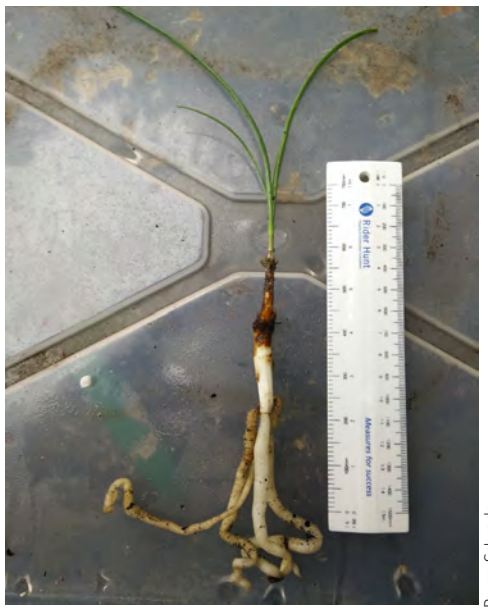
Two-year-old Crinum luteolum seedlings. Note the narrow tuberous juvenile bulb and fleshy roots that have hit the bottom of the pot they have been growing in.

ADDRESS: 50 Pearsalls Road, Invertoch Vic 3996 OPEN: Monday to Saturday: 9am – 5pm CONTACT: Phone: 03 5674 1014 | info@gonativelandscapes.com www.melaleucanursery.com