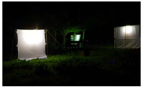
Light traps set up as part of the Otway Bioscan project.

up because it was usually wet and cold by early morning (typical cool-temperate rainforest or coastal heathland conditions). At two sites we had members of the public visit. The first was an opportunistic visit by a bus load of overseas visitors intent on seeing the glow worms located near our location. A few were more interested in our activities than their original subject but even our bright lights did not diminish the 'glow'.