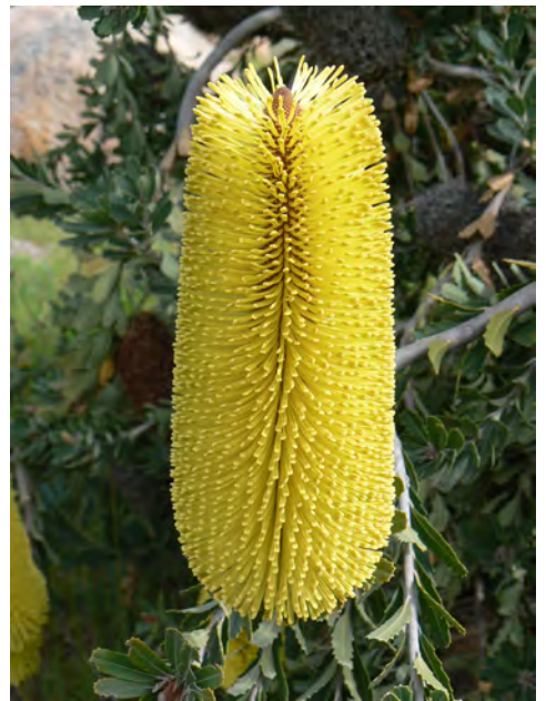
Banksia praemorsa (Cut-leaf Banksia)

If all of these are supplied, there will soon be a good variety of our wonderful native wildlife moving into your garden – and depending on how well you have done your wildlife landscaping,