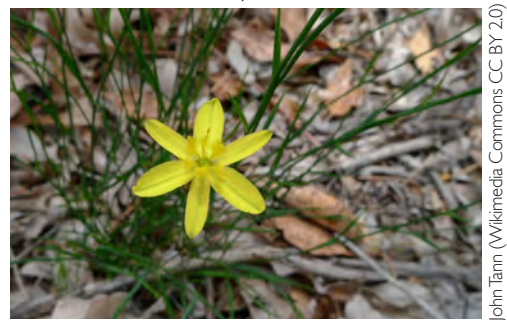
Tricoryne elatior (Yellow Autumn Lily)

There's a brief story of some regrowth after a fire in Wallum country on Bribie Island.