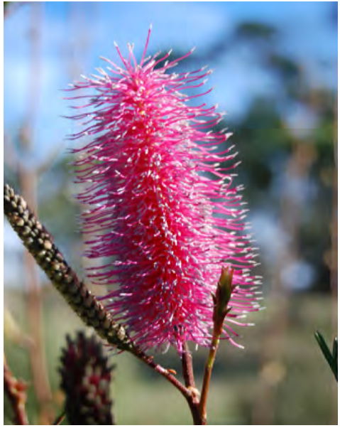
Grevillea magnifica ssp. remota - note deeper pink flowers.

The other subspecies of Grevillea magnifica occurs many kilometres south and east in the Southern Wheatbelt and the semi-arid mallee woodland south-west of Coolgardie, on the edge of the Great Western Woodlands. The type locality for this subspecies, Cave Hill, was in fact so isolated that Peter Olde and I had no hesitation in naming it subspecies remota , as at the time, this was the only known location for this subspecies. Since that time, many more populations have been discovered, all growing on isolated granite hills and outcrops, and most are hundreds of kilometres apart growing well south of subspecies magnifica .