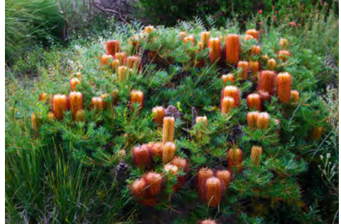
Banksia spinulosa 'Schnapper Point'