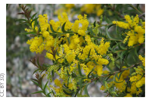
Acacia triptera (Spur-wing Wattle)