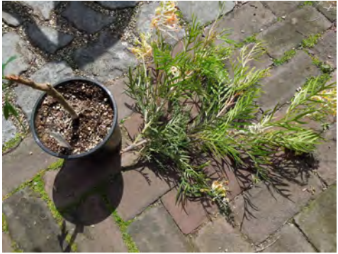
An unwanted occurrence – the spontaneous dropping off of growth on my grafted Grevillea 'Peaches and Cream'.

Some grevilleas are not successful when grafted on Grevillea robusta , as they are not compatible. They may not grow at all, or they can grow vigorously for a while but then drop off spontaneously, as I was very sorry to find out this spring with my I0-month-old grafted Grevillea 'Peaches and Cream'.