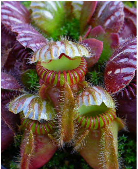
Close up of the pitchers.

The Albany Pitcher Plant only grows in a very small area of Western Australia, and is thought to be an ancient Gondwanan relict from a period when this region was almost tropical. It grows in nutrient-poor soils of coastal swamps and lowlands, where it survives by luring insects into its traps to be digested in a pool of enzymes at the base of each pitcher. Each pitcher bears a lid to prevent rain from diluting the pool of enzymes, with translucent windows to disorient trapped prey and prevent escape.