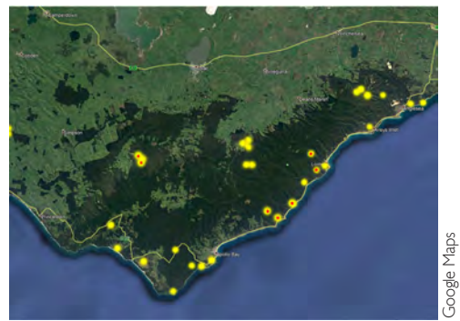
Otways event locations.

Volunteers took turns resting in tents, vehicles or a camper which also served as places to warm