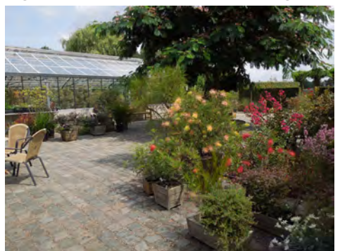
The beautiful, but offending grevilleas in our courtyard.