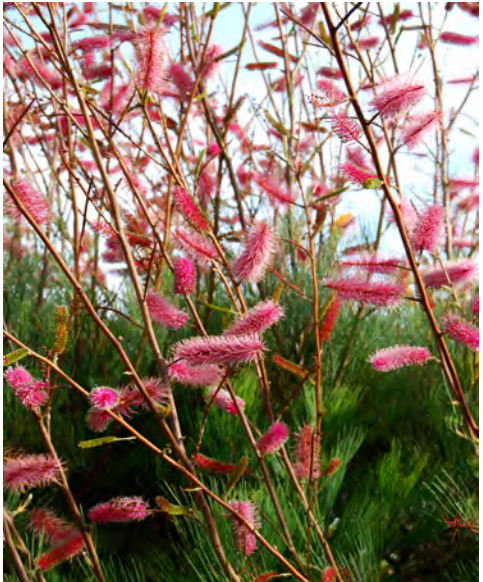
The leafless, long flowering canes are ideal for cut flowers when picked as the buds just begin to open.

Propagation of Grevillea magnifica is from seed, cuttings or by grafting, although the latter form of propagation has eluded most nurserymen. Plants set vast quantities of seed, which will germinate well when pre-treated with smoked water before sowing into a perfectly drained seed mix. This is best done in early to mid-spring, so resultant seedlings can grow on strongly over their first summer, and then be ready for planting out the following autumn. Otherwise, cuttings of selected good forms can be readily struck using Clonex Purple and placing in a mix of one part coir peat to four parts moist medium-grade perlite.