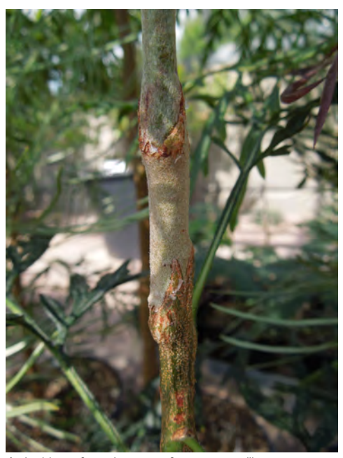
A double graft works a treat for some grevilleas.

Don't wear perfume in the garden - unless you want to be pollinated by bees.