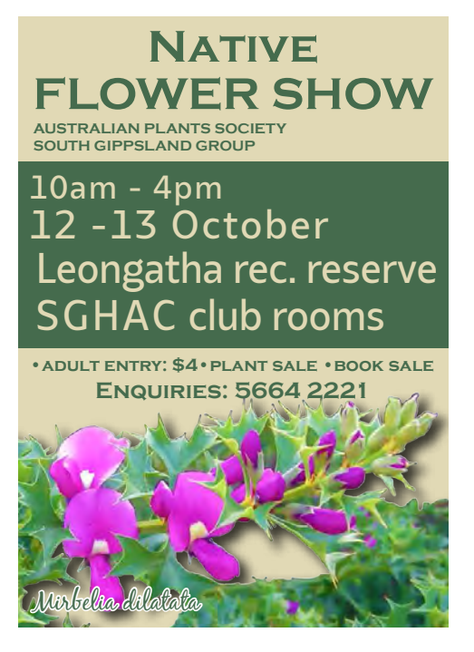
Growing Australian September 2019

We have more titles than fit on the booklist. Contact us on books@apsvic.org.au or phone (03) 9872 3583 for a book not on the list – so long as it relates to Australian plants or related areas such as native fauna or weeds. If you want to pay by PayPal, please email and we will provide instructions.