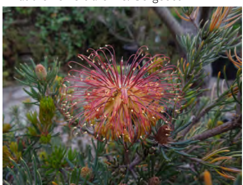
The gorgeous flowers of Banksia incana var. brachyphylla.

Another less attractive feature of my beloved Aussies is that they can cause a bad rash. Earlier in the year the skin of my forearms was covered in an itchy and burning rash, with big yellow blisters to finish things off which lasted for several weeks. The culprits probably are Grevillea robusta (Silky Oak), G . 'Peaches and Cream' and/or G . 'Robyn Gordon'. Friends urged me to get rid of these plants, but how could I? The latter cultivars are way too beautiful to get rid of, flowering all year round and making a lovely entrance to our courtyard. G. robusta is indispensable to graft other beauties on, so I'll just need to be more cautious and keep my fingers crossed this rash doesn't occur again.