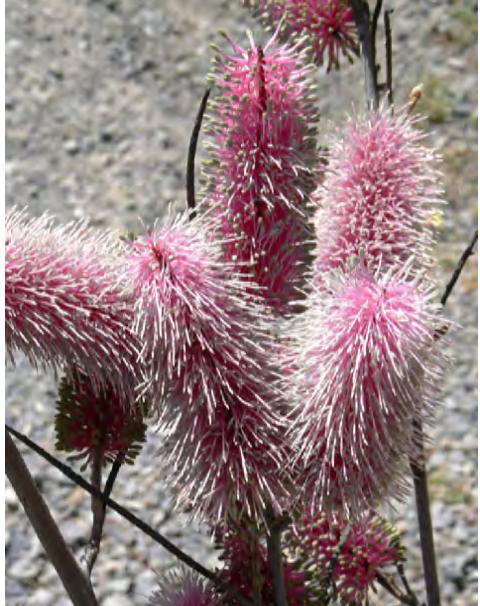
Grevillea magnifica ssp. magnifica – note the pale pink flowers.

At Mt Caroline, and on several nearby granite outcrops, the type species is found – Grevillea magnifica ssp. magnifica . When we first saw this truly amazing grevillea, Peter Olde and I agreed that the plant warranted recognition as a new species, and that the name 'magnifica' was most appropriate. Up until then, McGillivray had included it in Grevillea petrophiloides , a far smaller species, in flower, foliage and habit. G. petrophiloides also occurs extremely widely in the south-west of WA on a variety of soils, but never on granite.