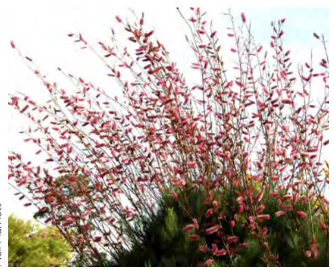
Massed flowering of Grevillea magnifica ssp. remota.

Flowers can appear in many months of the year, beginning in winter and flowering right through until the soils dry out in mid to late summer. Over this length of time a plant can produce thousands of its beautiful flowers. These attract continuous hoards of honeyeaters and lorikeets to feast on the abundant nectar and pollen.