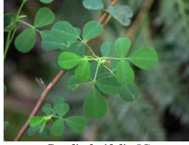
Goodia lotifolia JG