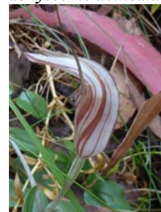
Diplodium coccinum RF