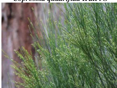
Choretrum candollei JG