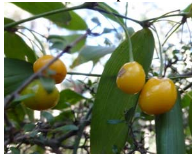
Eustrephus latifolius MB