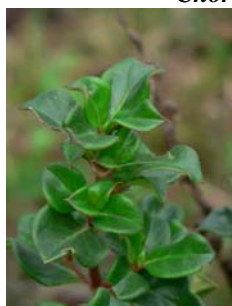
Coprosma hirtella JG