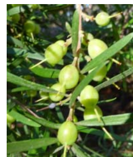
Persoonia linearis MB