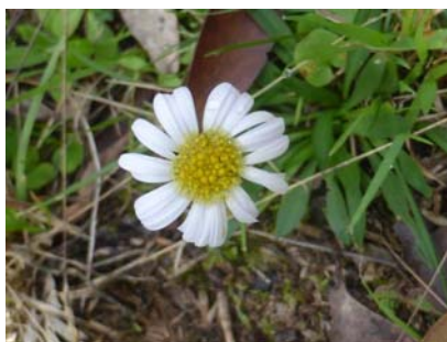
Brachyscome scapigera RF