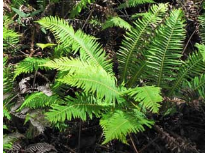
Blechnum sp. JG