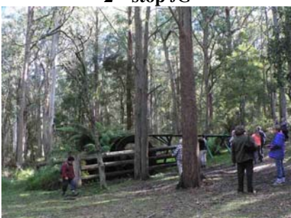
Lowden Park Waterwheel JG