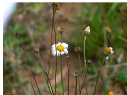
Brachyscome aculeata JG