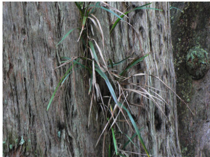
Dianella caerulea in tree bark JG