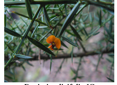
Daviesia ulicifolia