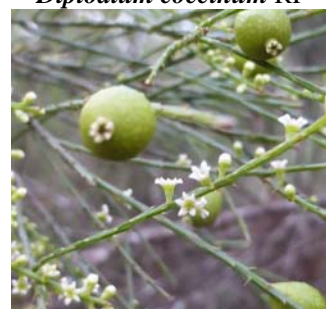
Choretrum candollei MB