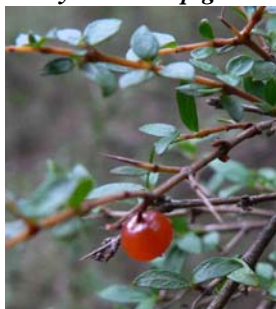
Coprosma quadrifida fruit JG