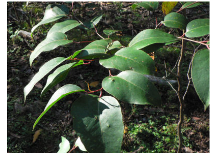
Eucalyptus obliqua juvenile leaves JG