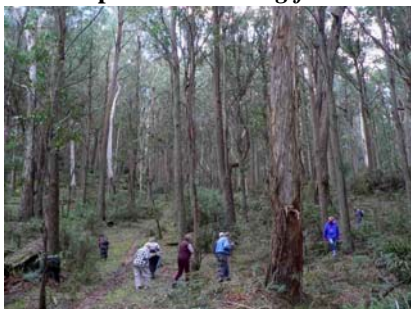
2 nd stop JG