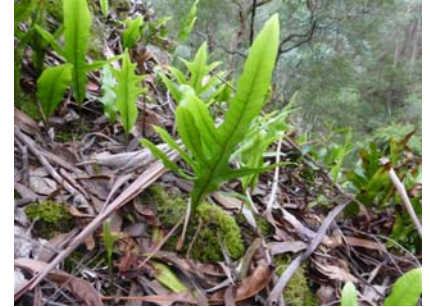
Microsorium sp. RF