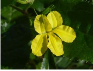
Goodenia ovata RF