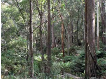
Fern Gully JG