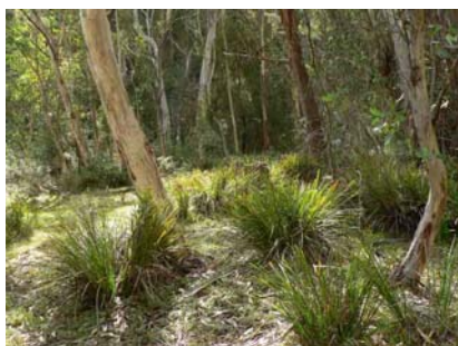
1 st stop Lomandra longifolia JG

We drove to Tallaganda forest via Hoskinstown and Rossi, stopping first on Rossi Road just before the intersection with Main Range Road. Here we walked under the powerlines and a little way into the wet forest, looking at the daisies flowering – Brachyscome aculeata , Craspedia variabilis and Helichrysum rutidolepis . Also flowering were Stylidium graminifolium and B. scapigera . We moved on to the moist gully/creek area on Palarang Rd where we had a quick morning tea then wandered around a little looking for autumn orchids. We were eventually rewarded with a couple of Diplodium coccinum . There were red berries on Coprosma quadrifida and we found a large Pittosporum bicolor . Moving on to Lowden Park we passed many Choretrum candollei still flowering but eventually saw it close up on the short walks that we did there. We found quite a few Large Mosquito Orchids flowering - Acianthus exsertus - and many other orchid leaves which we didn't put a name to (several species). Interesting plants were Desmodium gunnii , Hakea eriantha , Goodia lotifolia , Goodenia ovata (a few flowers), Olearia argophylla , Prostanthera lasianthos , Eustrephus latifolius with orange berries, Smilax australis with clusters of green berries, many lovely ferns and masses of juvenile Eucalyptus obliqua . The waterwheel was working well. It really is a nice picnic spot and forest drive to get there. For the images below: JG = Jean Geue, MB = Martin Butterfield, RF = Roger Farrow