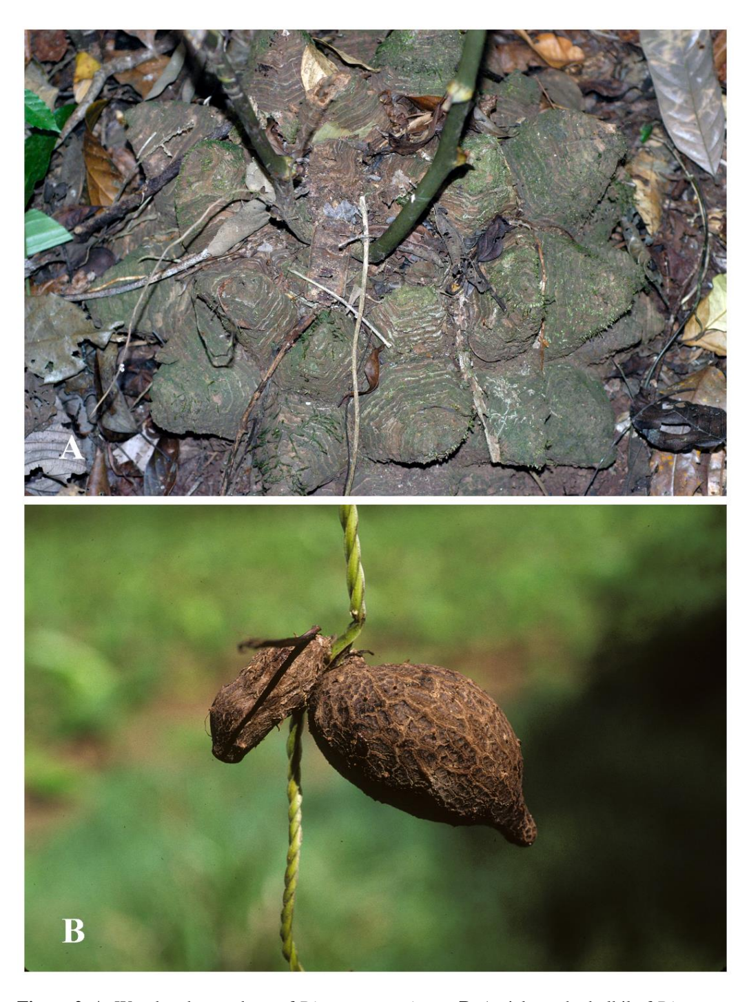
Figure 2 . A . Woody tuberous base of Dioscorea mexicana . B . Aerial starchy bulbil of Dioscorea alata . Photos by P. Acevedo.