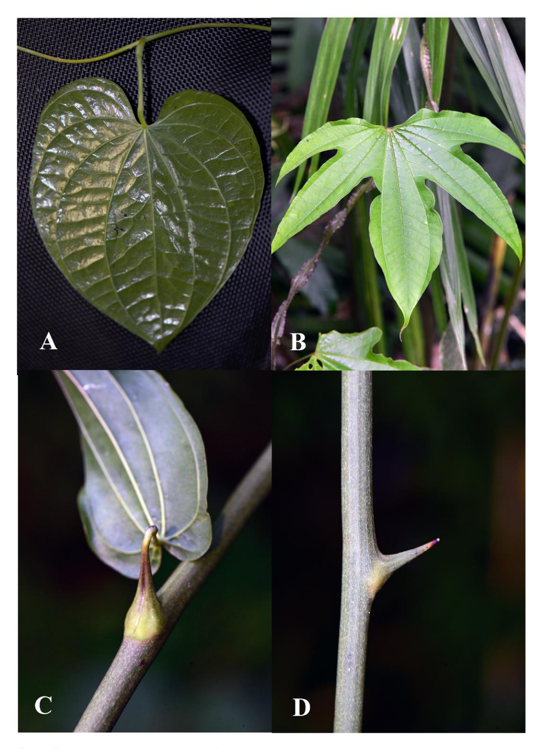
Figure 3 . Leaf features in Dioscorea . A . Cordate blade with 9 main, arcuate veins of Dioscorea sp . B . Palmately lobed blade with 9 main, arcuate veins of Dioscorea sp . C & D . Dioscorea sp . with persistent indurate (spine-like) petiole, before and after shedding of blade.