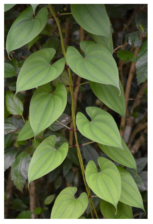
Dioscorea alata Chodat

A primarily tropical family extending to warm temperate regions with 3 genera and about 800 species of twining, rhizomatous vines or lianas, most of which belong to the genus Dioscorea . Dioscoreaceae is represented in the New World only by Dioscorea with a total of about 400 species, 371 of which are found in the Neotropics. For the most part, they are found in moist, wet or seasonal lowland forest.