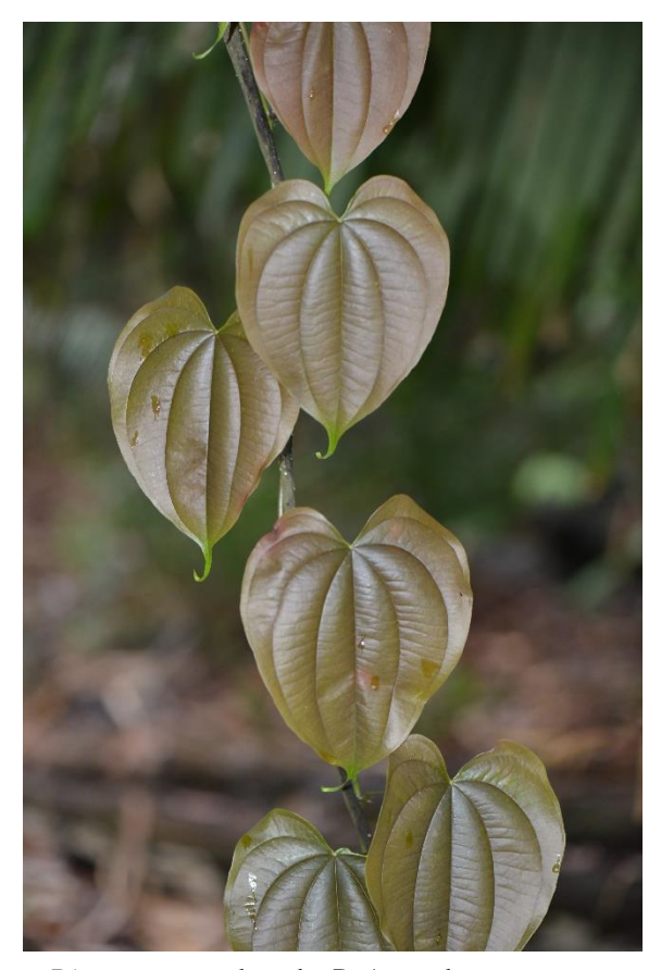
Dioscorea sp.

DIOSCOREA Linnaeus, Sp. Pl. 1032. 1753. Rajania L.