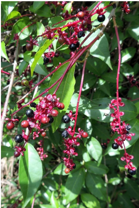
T. octandrum