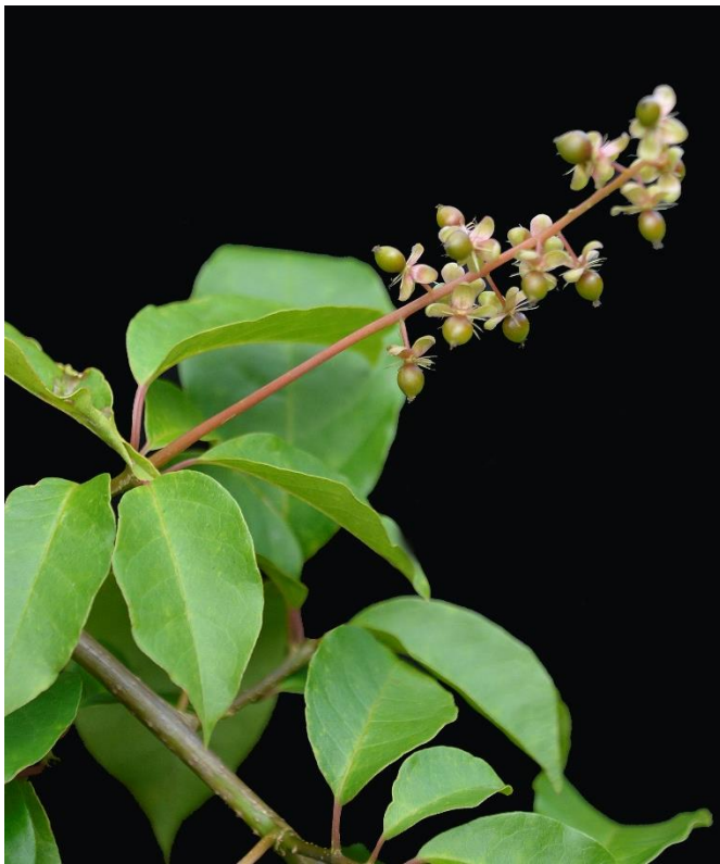
Trichostigma octandrum

For the most part, a neotropical family of herbs, shrubs, lianas or less often trees, consisting of 9 genera and 22 species. Lianas are restricted to the genera SeQUIERIA Loefl. and Trichostigma A. Rich. with a total of 6 species distributed from Mexico to southern Brazil; commonly found in dry to moist forests at low elevations.