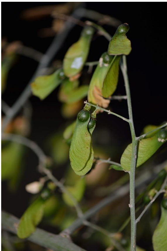
S. americana

SEGUIERIA Loefling, Iter Hispan. 191. 1758.