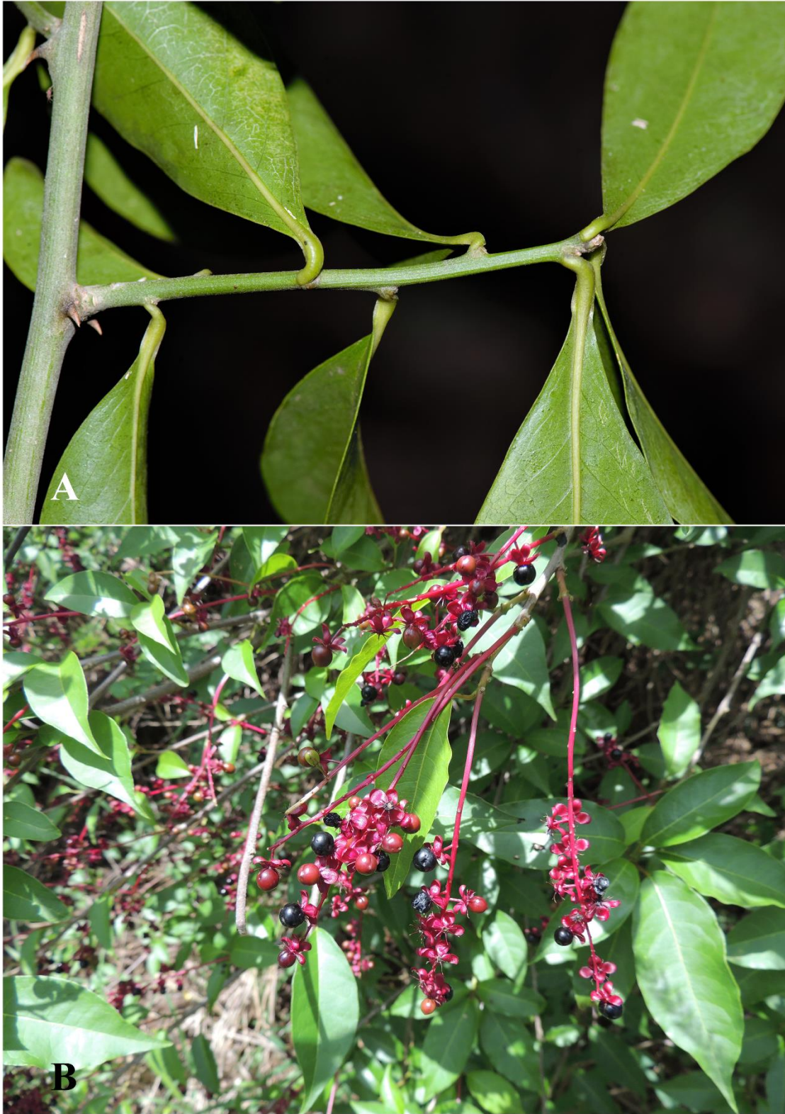
Figure 3. Vegetative features in Petiveriaceae. A. Segueria americana , showing a short lateral branch with two recurved thorns at the base. B. Trichostigma octandrum , hanging fruiting branch.