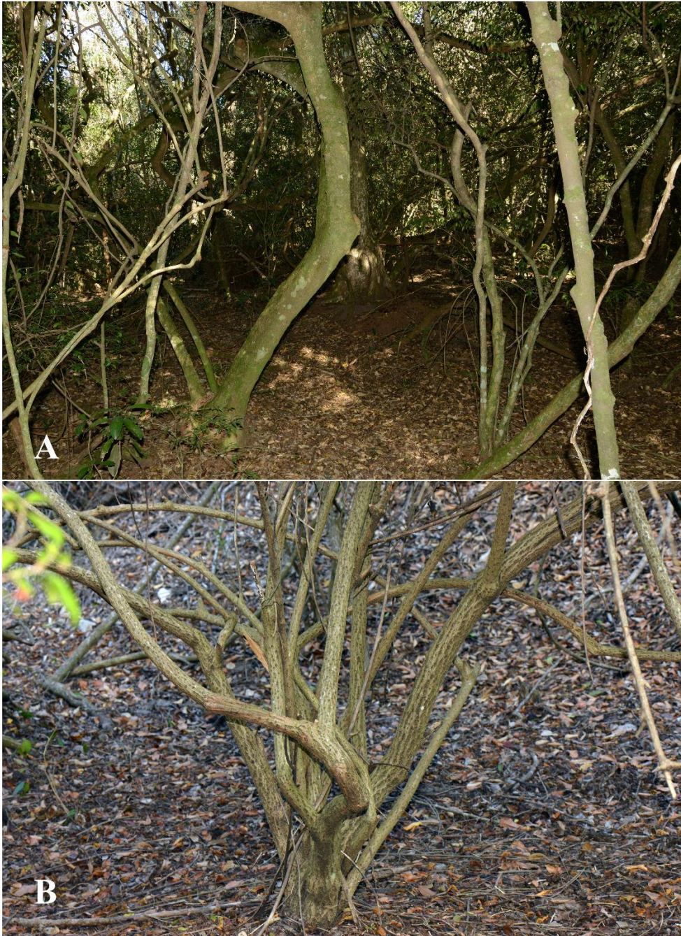
Figure 2. Vegetative features in Petiveriaceae. A. Segueria americana , a scrambling liana > 25 m long. B. Trichostigma octandrum , a scrambling liana, many-branched from base, bark semi-rough and lenticellate.