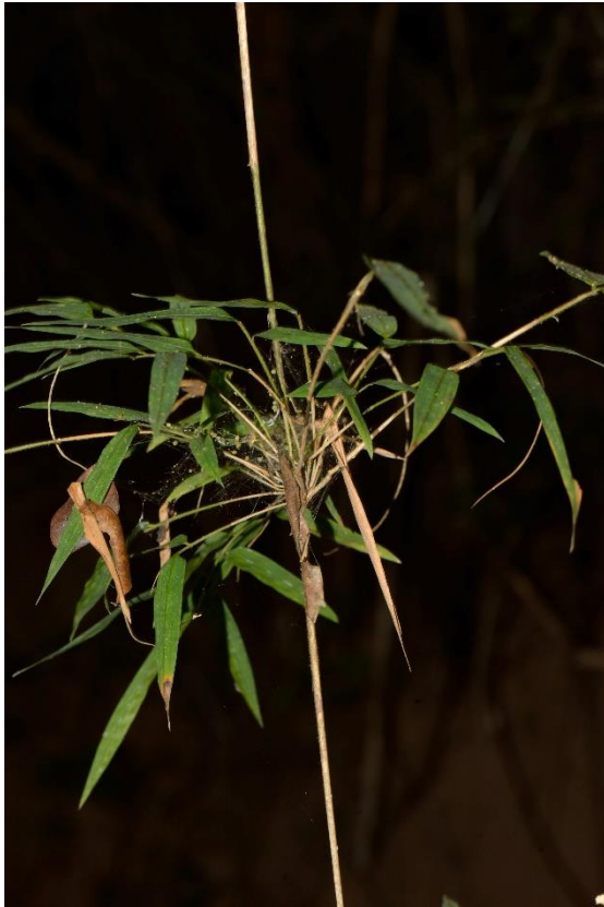
Chusquea sp.

A widely distributed family of primarily herbaceous or less often ligneous plants found in arctic, temperate, subtropical, and tropical regions, with about 750 genera and ca. 12,000 species worldwide. Unarguably, the most important family of plants economically, from which cereals, breads, sugar, forage and other products are produced. There are 18 genera treated herein that have species considered climbing or vining plants for a total of 120 species. Fourteen of these genera represent bamboos, 11 in the tribe Bambuseae (woody bamboos) and 3 in the tribe Olyreae (herbaceous bamboos).