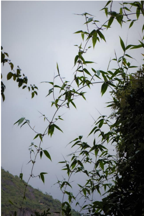
G. tagoara (Nees) Kunth

GUADUA Kunth, J. Phys. Chem. Hist. Nat. Arts 95: 150. 1822.