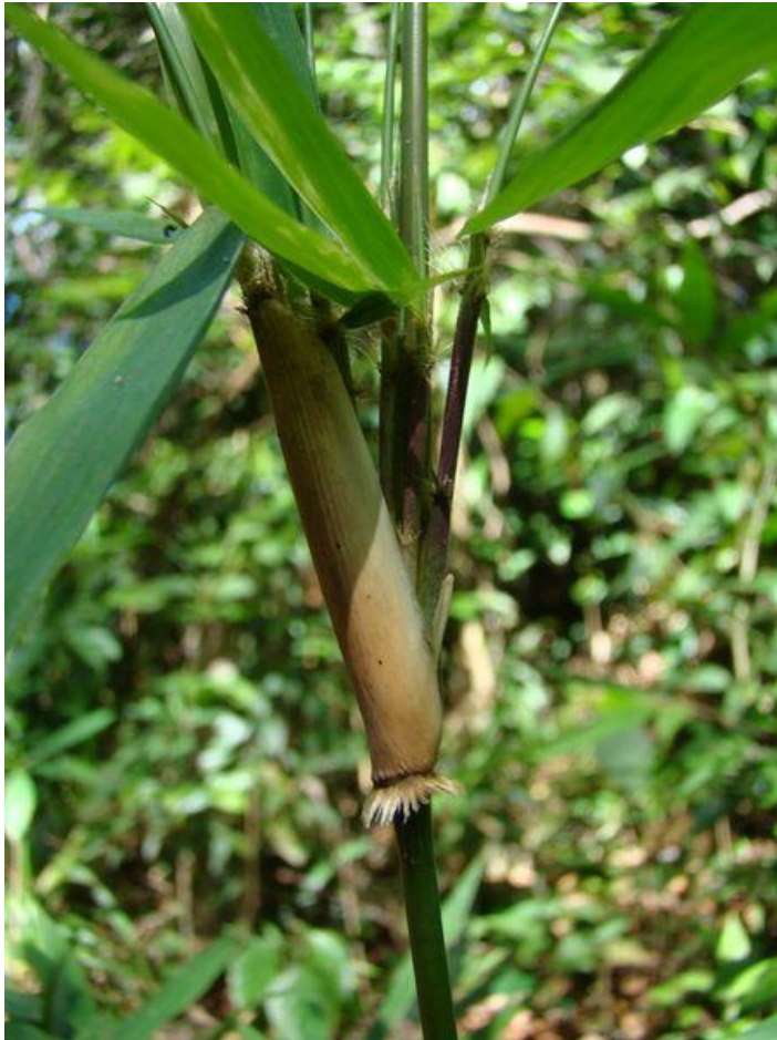
A. aureolanata Judz.

ATRACTANTHA McClure, Smithsonian Contr. Bot. 9: 42. 1973.