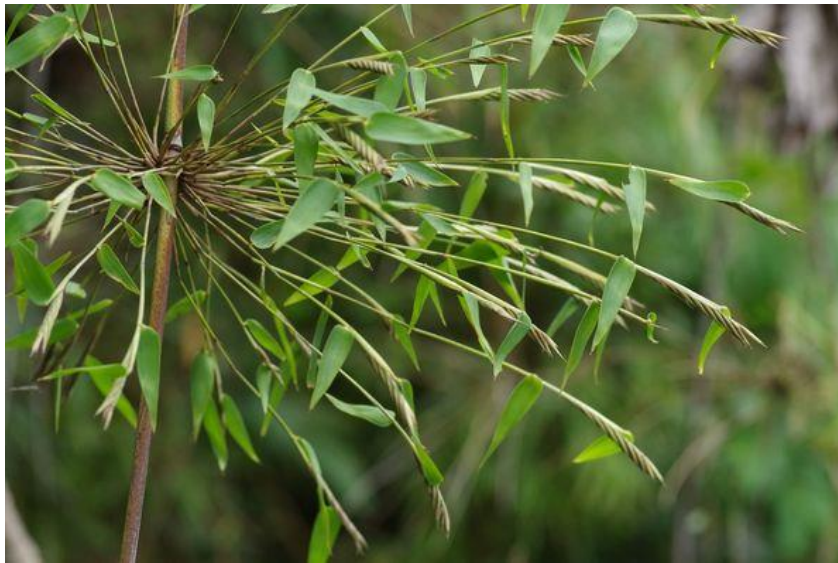
Merostachys sp.

MEROSTACHYS Sprengel, Syst. Veg. 1: 132, 249. 1824.