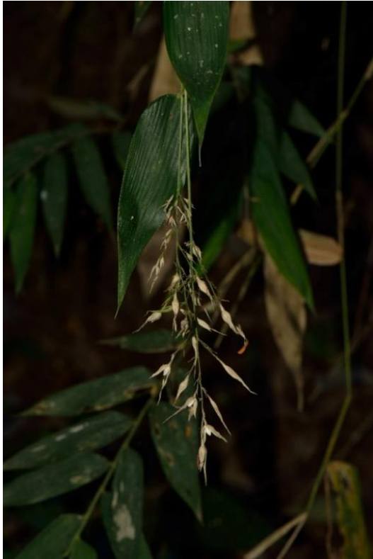
Olyra sp., photo by P. Acevedo.

OLYRA Linnaeus, Syst. Nat. ed. 10, 2: 1261. 1759.