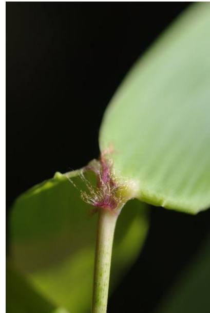
C. cf. kinoshitae

Rhizomatous perennials; rhizome short, pachymorph. Culms erect to scandent or high climbing, delicate and weak, hollow, promontory poorly developed or absent, midculm nodes bearing a single, divergent branch. Leaves dimorphic, those of the culm different from those of the branches; culm leaves with a prominent girdle, the blades pseudopetiolate, triangular, becoming reflexed; foliage leaves short-fimbriate, sometimes on auricles, the blades small, narrowly to broadly lanceolate. Synflorescences terminal, small and