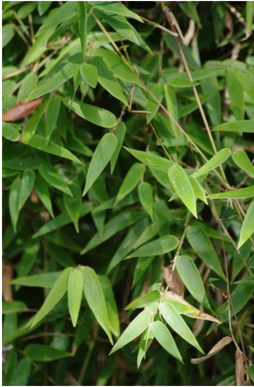
C. cf. kinoshitae