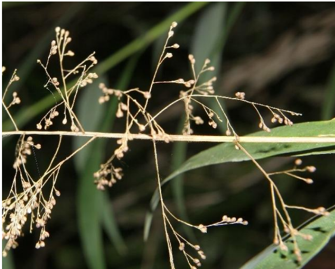
I. arundinacea (Sw.) Griseb.

ISACHNE R. Br., Prodr. Fl. Nov. Holland.: 196. 1810.