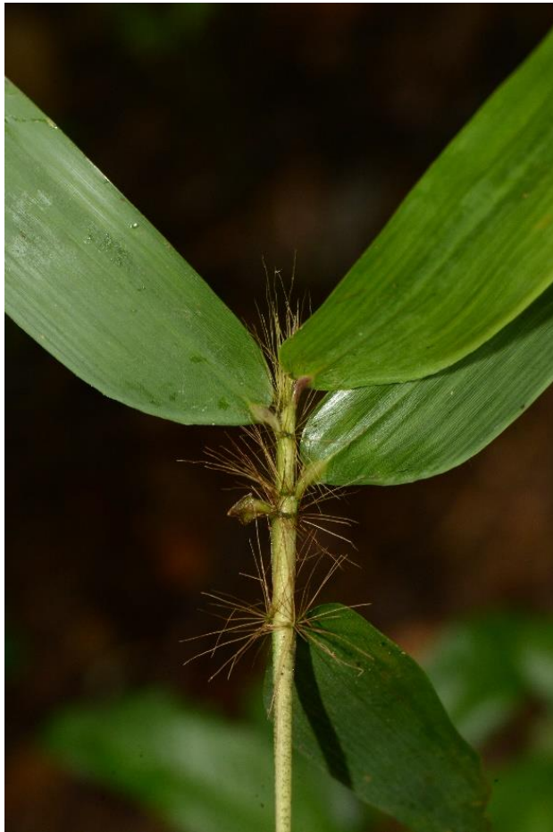
A. capitata (Hook.) Benth.

ATHROOSTACHYS Benth in G. Bentham & J.D. Hooker, Gen. Pl. 3: 1208. 1883.