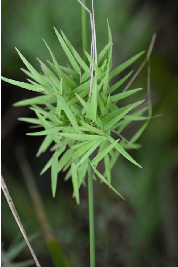
A. sarmentosum Pilg.

ARTHROSTYLIDIUM Ruprecht, Mém. Acad. Imp. Sci. Saint-Petersbourg, sér. 6, Sci. Math., Seconde Pt. Sci. Nat. 3(2): 117. 1839.