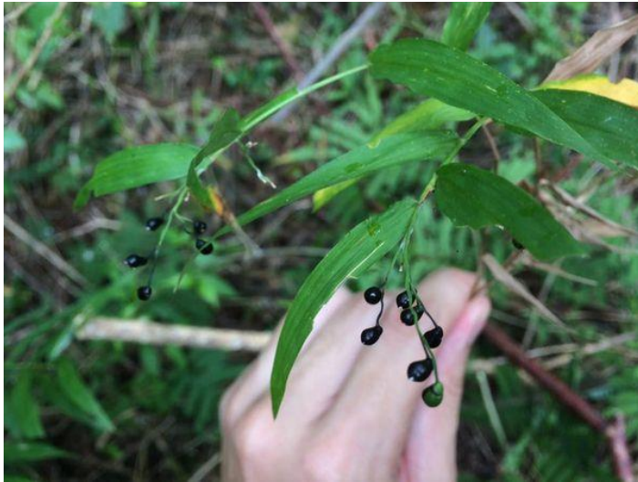
L. divaricata

LASIACIS (Grisebach) Hitchcock, Contr. U.S. Natl. Herb. 15: 16. 1910.