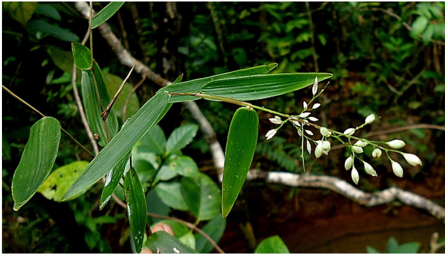
P. ramosissima (Tri.) Soderstr. & Zuloaga

PARODIOLYRA Soderstrom & Zuloaga, Smithsonian Contr. Bot. 69: 64. 1989.