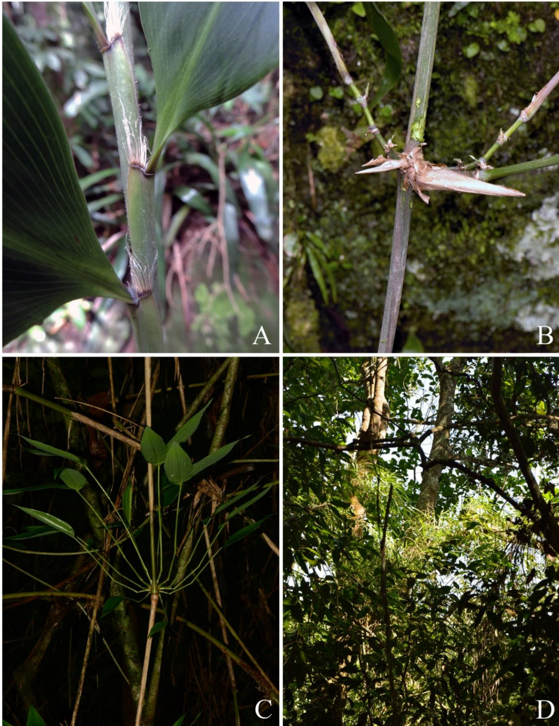
Figure 1. Climbing bamboo characteristics. A. Guadua tagoara stem with sheaths showing base of leaf blades and oral setae. B. Stem of Guadua tagoara showing thorns produced from modified branches. C. Chusquea sp. stem showing culm node with verticillate, arachnoid branching pattern. D. Chusquea sp. scrambling habit.