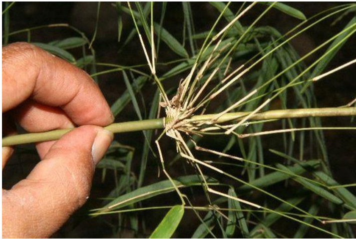
Rhipidocladum sp.

RHIPIDOCLADUM McClure, Smithsonian Contr. Bot. 9: 101. 1973.