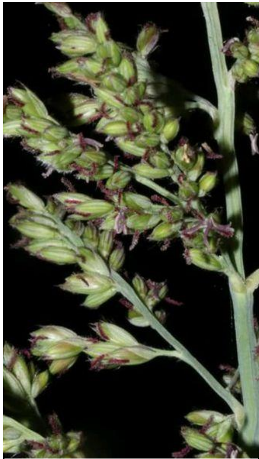
I. bambusiflorus

ICHNANTHUS P. Beauvois, Ess. Agrostogr. 56. 1812.