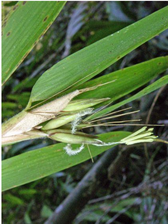
Elytrostachys sp.