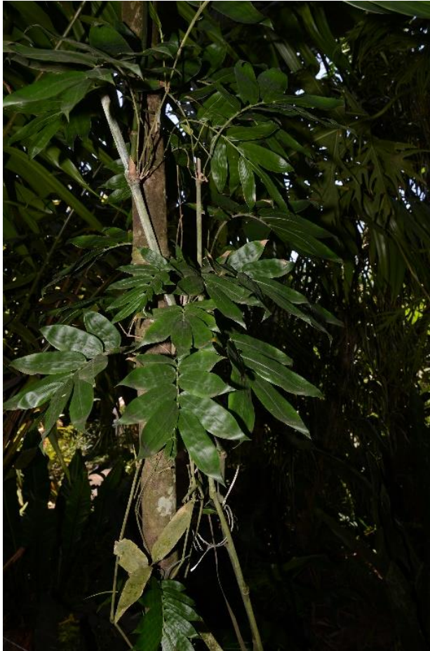
Chusquea scandens

CHUSQUEA Kunth, Syn. Pl. Aequin. 1: 254. 1822.