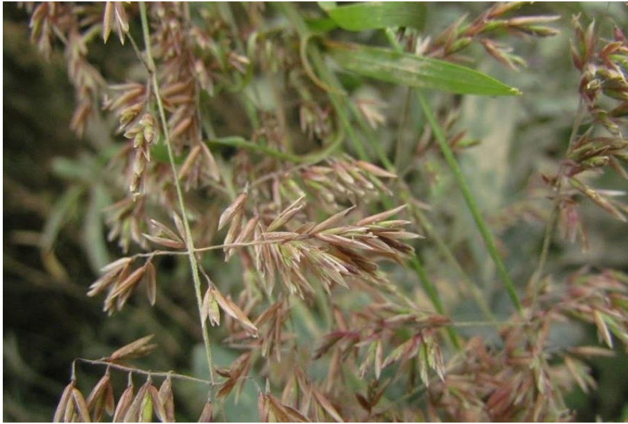
M. sarmentosa

MELICA L., Sp. Pl. 66. 1753, (nom. cons.).