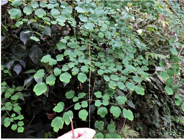
T. podocarpum

Erect herbs or sub-shrubs, with one species ( T. podocarpum Kunth ex DC.) sometimes growing as a clambering herb reaching 2-2.5 m in length. Stems cylindrical, fragile ca. 5 mm diam. Leaves alternate, bipinnate, ca. 60 cm long; leaflets chartaceous, ovate, trinerved, trilobed, cordate at base; rachides elongate, maculate, cylindrical, and slightly swollen at the junctions; petioles elongate and