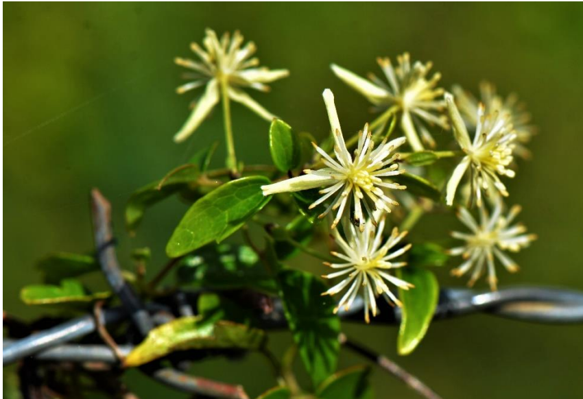
Clematis sp.

A cosmopolitan family with larger diversity in the wet temperate regions extending into the mountains of the tropics; 52 genera and about 2,500 species of erect, prostrate or acaulecent herbs and herbaceous to woody vines. The family is represented in the Neotropics by about 11 genera and 100 species, of which only 22 are reported as