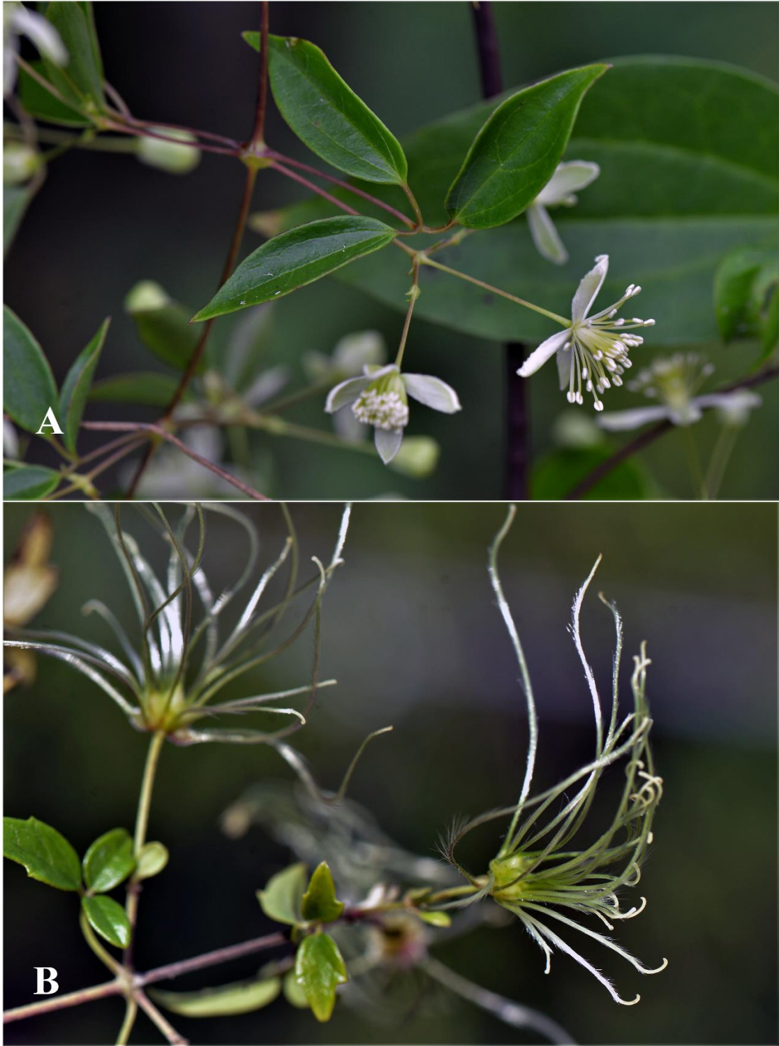
Figure 3. A. Flowering branch with trifoliate leaves of Clematis dioica . B. Fruiting branch with trifoliate leaves of Clematis sp.