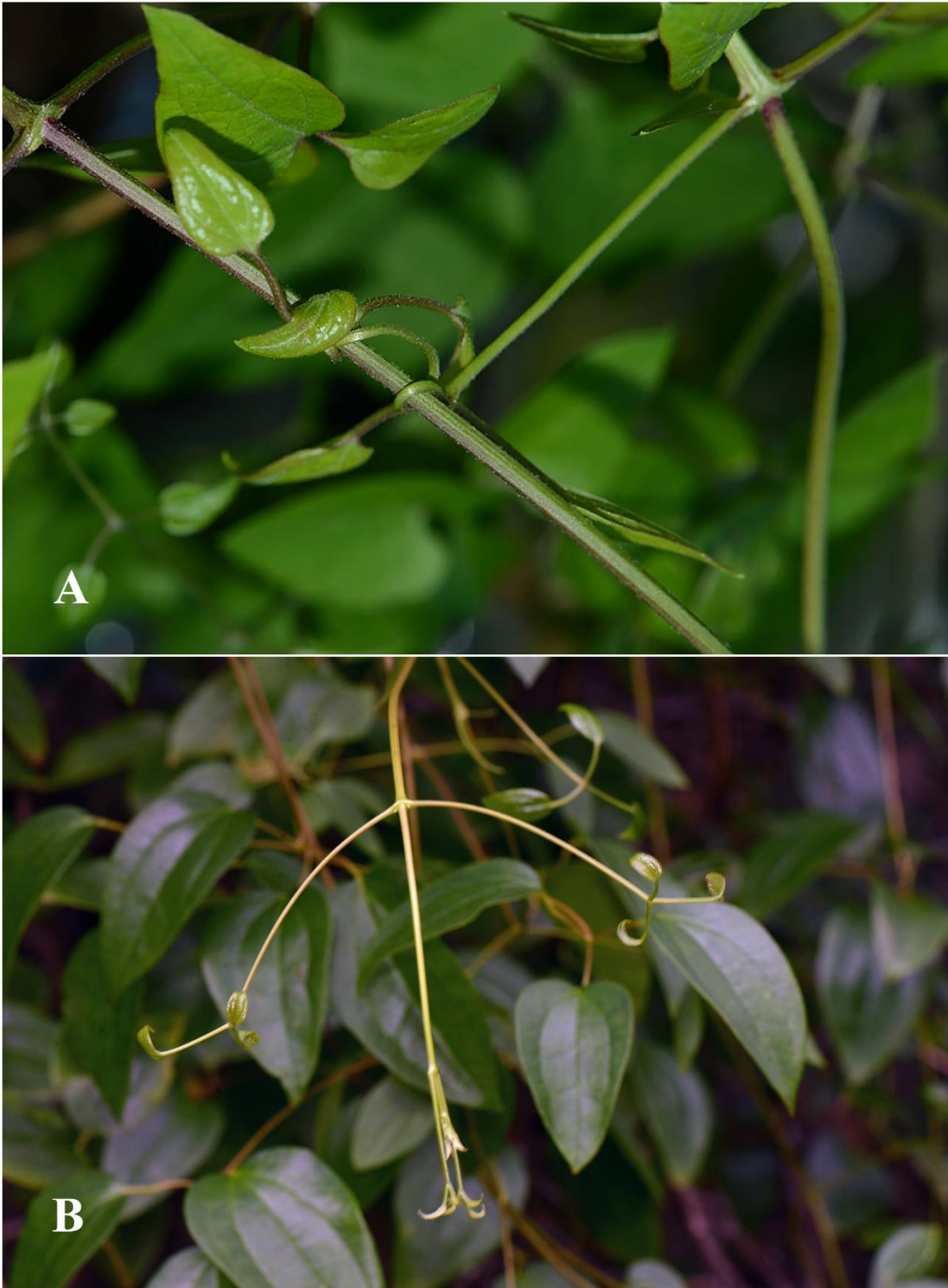
Figure 2. Clematis dioica . A. Prehensile leaf. B. Distal portion of shoot with long-petioled leaves prior to becoming prehensile.