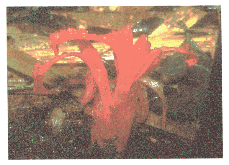
5. Etlingera sp. – this species was found near Camel Trophy and may represent a new species. Unfortunately, a snail had eaten all the stamens and more material is much needed.