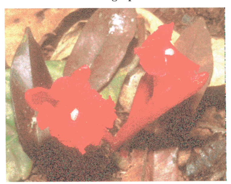
1. Etlingera brevilabrum – a common ginger in gaps. This form is all red with a white stigma.