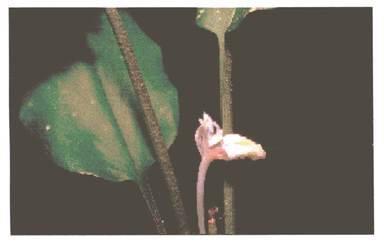
8. A species of Bosenbergia (Zingiberaceae).