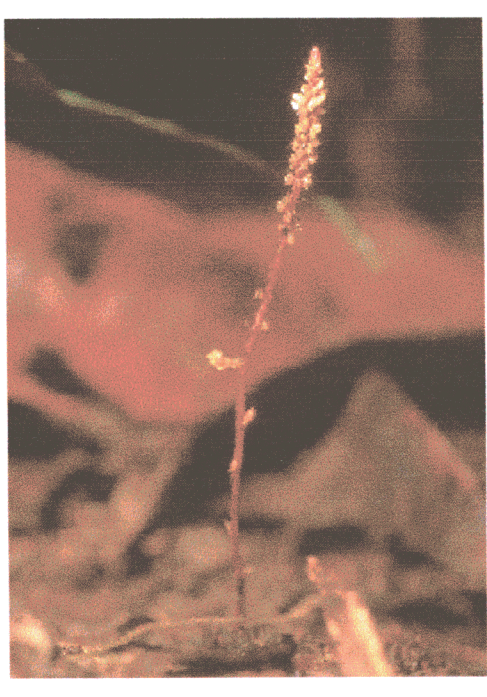
11 . Epirixanthes – a saprophyte (Polygalaceae).