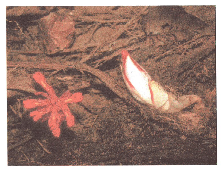
3. Etlingera rubromarginata – bracts are white with a conspicuous red margin.