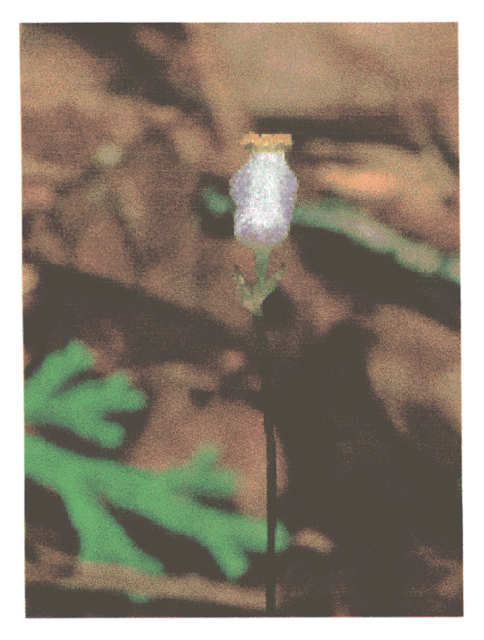
10 . Burmannia – a saprophyte (Burmanniaceae).