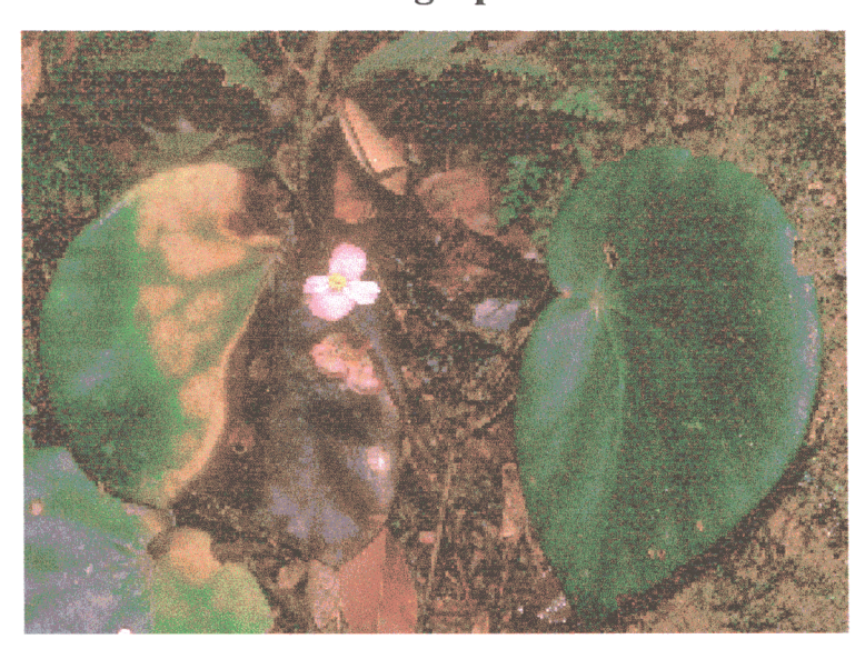
6. A species of Begonia (Begoniaceae).