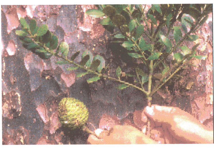
14. Agathis borneensis Warb. - at Camel Trophy.