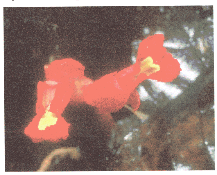
2. Etlingera sessilanthera – was found near the Maliau Falls.