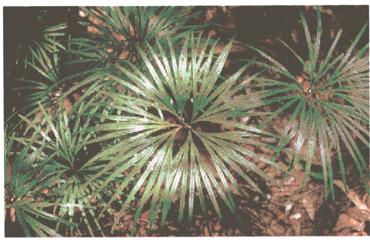
9. Schizaea digitata – a fern growing on ridges.