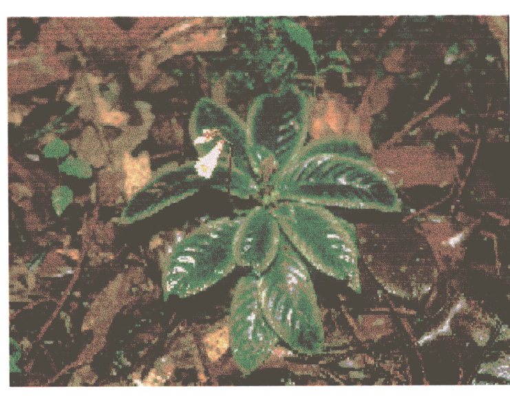
7. A species of Didymocarpus (Gesneriaceae).