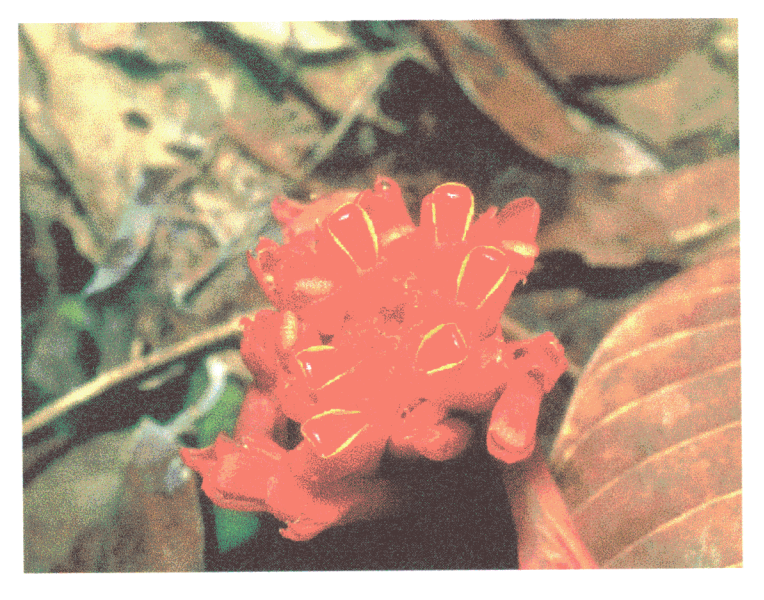
4. Etlingera sp. – this may be a new species and has also been documented from other places.