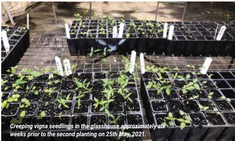
Creeping vigna seedlings in the glasshouse approximately six weeks prior to the second planting on 25th May, 2021.

The photos show some of the experimental lines growing at WRS. An industry field day including a field walk, project update and discussion will be held on Wednesday 14th July 2021. ■■