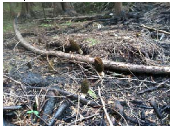
Big 'reds' thriving in the saturated charcoal