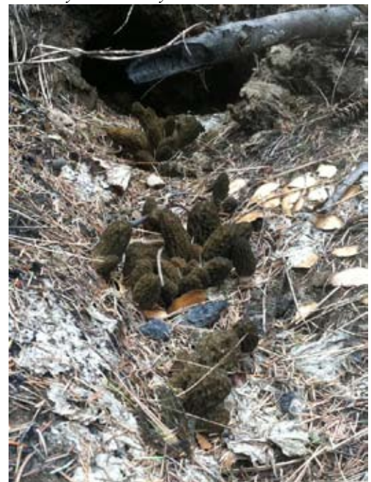
Morels in bunches, like bananas!