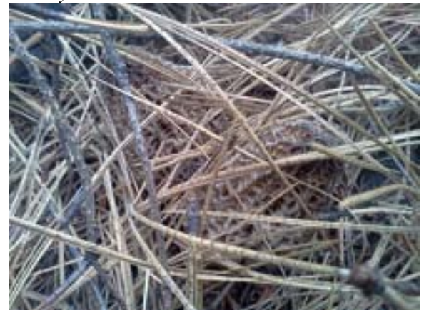
Greys hiding out in ponderosa pine needles

Ingredients such as heavy cream, mushroom duxelles, salty butter, briny crab meat, silky mashed potatoes and sizzling bacon are good places to start. With all these possibilities and combinations, it boils down to a matter of taste and there is no longer any sense of right or wrong. The Grey doesn't hog the spotlight. Rather, it shares its own unique richness with other flavor explosions in perfect harmony. The Grey is passionate about the simple classics like bacon and eggs for breakfast on the morning after, or a tangy goat cheese melting with toasted pine nuts and snipped chives. The Grey loves to be sizzled in olive oil, embraced in crispy Panko, fried hot to allow the creamy, cheesy fillings to melt and merge. The Grey also