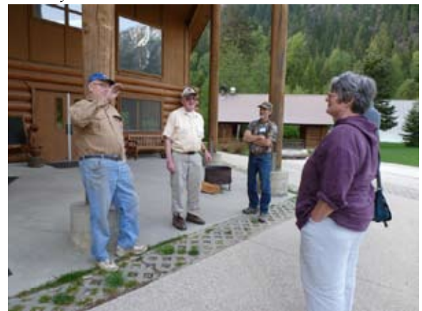
The revellers already telling tall mushroom tales