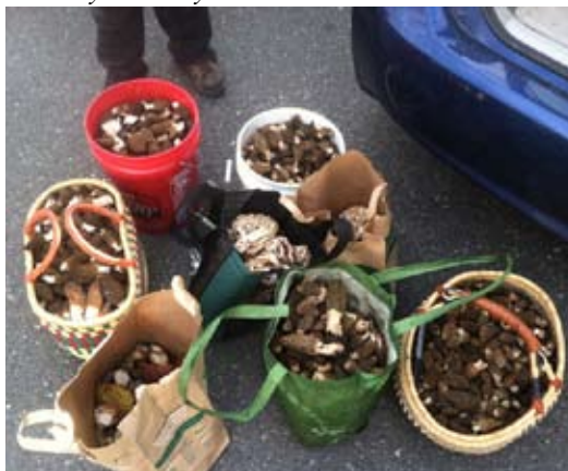
The big take from the Sears Creek excursion