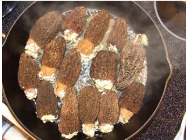
Yes, that's my pan! Some of my best stuffers, sauteing in garlic butter.