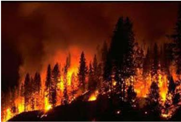
From out of this carnage, comes wonders of the mushroom kingdom