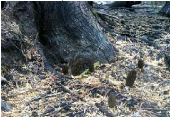
Luscious 'greens' near a charred ponderosa pine

It was the following weekend, that Dan, Jen, and I teamed up and took the furious 3 1/2 mile climb from the Sears Creek Road into the wilderness that belongs to the cougars and grizzly bears. It took the better part of two