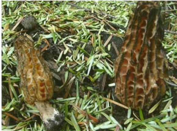
One of the newly named naturals

This is still a work in progress, so even the 'new' names that some of the species in the genus Morchella have been assigned, such as Morchella anthracophila , pictured here, may be changed yet again.