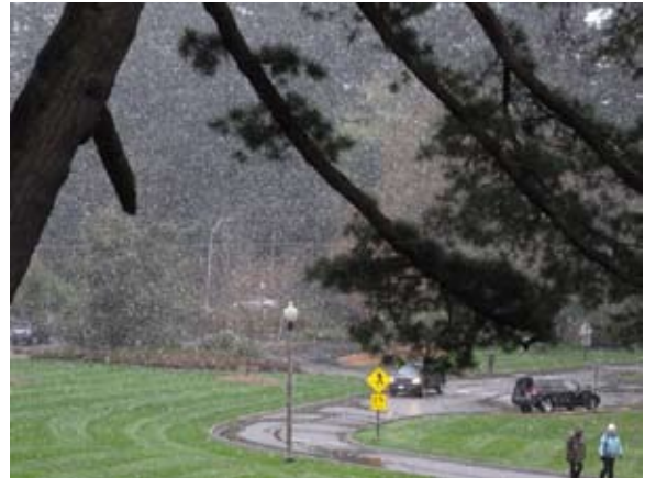
Yikes! It' began to snow at the April foray. Beautiful western Washington spring!