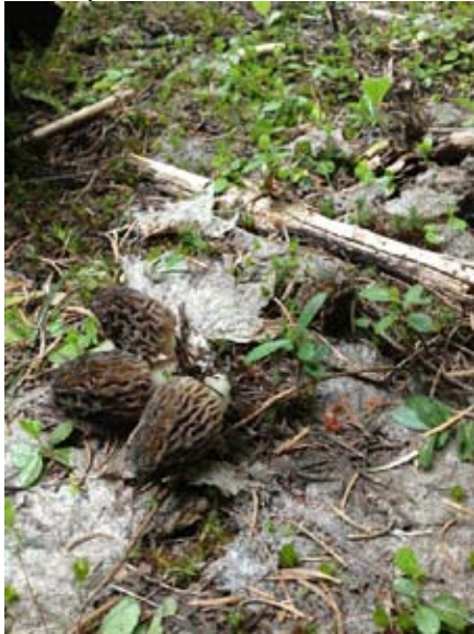
The madness begins...

we had an uneventful and fun time, finding plenty of morels too! Amy's son Casey, with dad Terry, turned out to be the champion mushroomer, finding not only the most morels of all, but also the most other varieties of spring mushrooms, including the prolific Calosypha fulgens , and the more-rare Pleurotus .