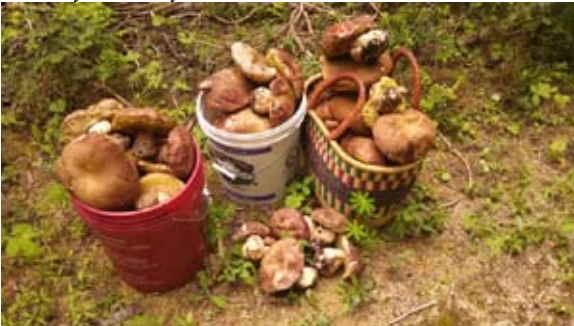
All of these splendid boletes in one square mile!