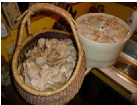
Oyster mushrooms to spare!

were harvested on May 22nd. Only one week later there was another phenomenal flush. The picture on the left shows the still full basket, and a fully packed dehydrator ready to run. I filled the drier three times out of that basket and got a few fresh meals. Beside what is shown in these photos, friends took away three shopping bags half full, and I had harvested another drier full a couple of months earlier. Later, I got another partial basket that supplied enough mushrooms for two potluck casseroles and several more meals.