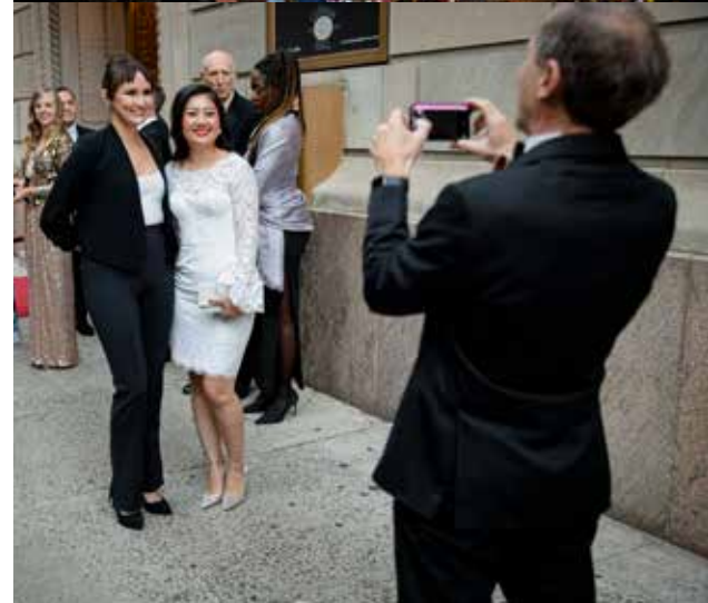
TOP: Murrow Awards. CHORUS PHOTOGRAPHY