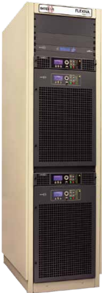
The Flexiva high-power FM transmitter is more powerful, capable and efficient than the station’s current transmitters.

“Our second priority is replacing our main Fresno area transmitter,” said Moore. “The model we have in Fresno is just as old as the one in Bakersfield, but it has proven to be a little more reliable than its south valley counterpart. It still needs replacement soon, the situation just isn’t quite as dire as in Bakersfield. The Fresno