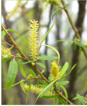
Black Willow Catkins

The biggest tree, a champion black willow, according to The American Forestry Association's Hall of Fame for Trees was in Traverse City, Michigan, with a circumference at breast height of 7.9 m (26 ft-1 in), a height of 25.9 m (85 ft), and a spread of 24.1 m (79 ft) (American Forests, 2008). The estimated life span for black willow averages 65 years with a range of 40 to 100 years (Stringer, 2006).