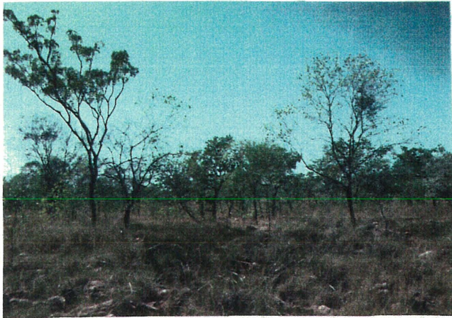
PLATE I. Land unit A1 - Low open woodland on Komolgie sandstone hillslopes.