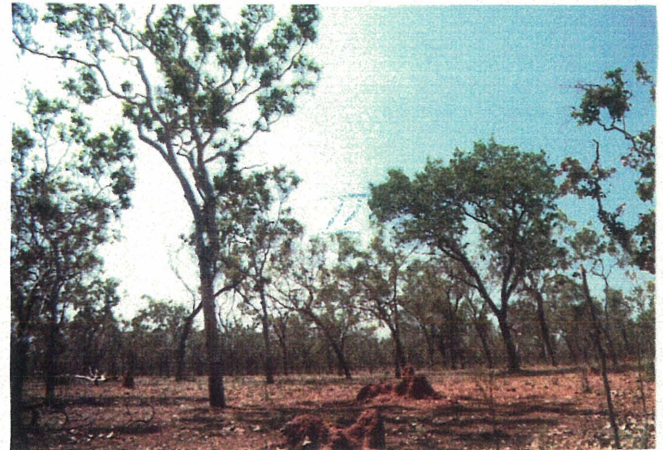
PLATE IV. Land unit D1 - Mid-high open woodland on sandy red earth.