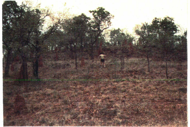
PLATE II. Land Unit B1 - Mid-high open woodland & Tall sparse shrubland on hillslopes & footslopes of Mullaman sediments.