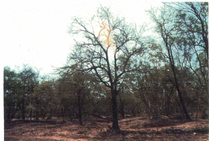
PLATE VI. Land unit F3 - Extremely tall open shrubland of Excoecaria parvifolia and Melaleuca stenostachya on gilgaid clay soil.