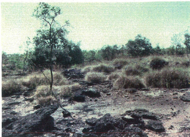
PLATE V. Land unit E5 - Mid-high open woodland on limestone outcrop.