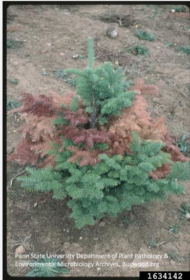
Red and brown needle discoloration caused by Phytophthora Root Rot.