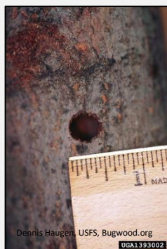
ALB exit hole

Infested counties have developed federally imposed eradication protocols. All infested trees are removed, and all uninfested trees are treated with an insecticide. Do not move firewood.