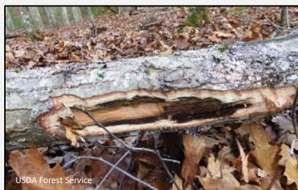
Bark bleeding and cankers due to Diplodia corticola .