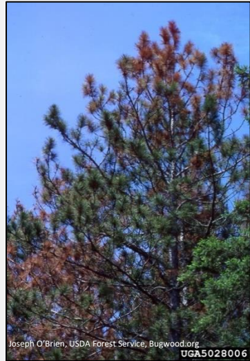
Diplodia kills needles at the tips of branches. Symptoms often start on the lower half of the tree and progress upwards.