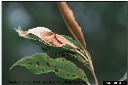
CSSM feeding damage on a cherry tree.