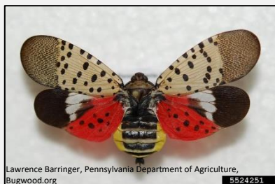
Adult SLF with wings open.