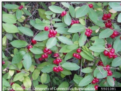
Bush Honeysuckle species produce fruit that mature between July and August. Berries range in color between red and orange.