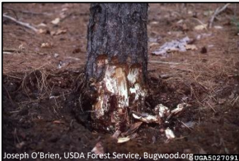
White fungus and resin at the base of the infected tree's trunk.