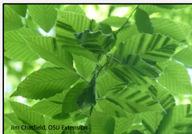
Jim Chatfield, OSU Extension