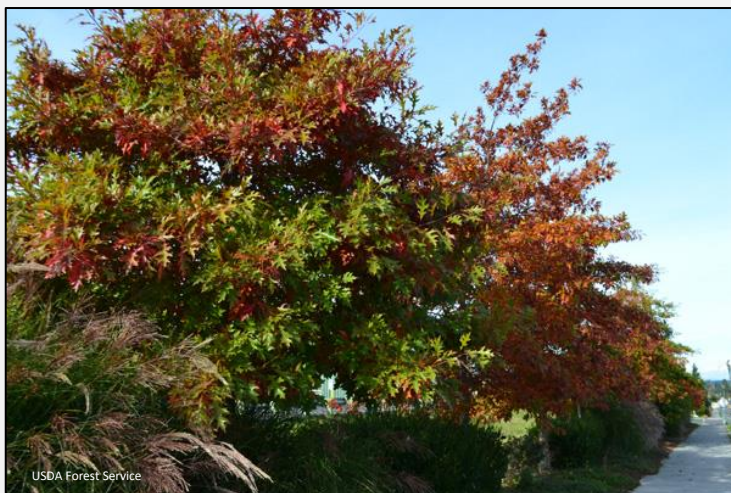
Crown dieback due to Diplodia corticola .