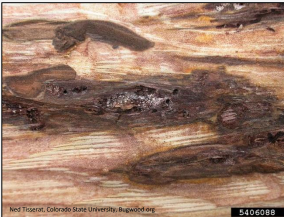
Cankers found under the bark of a Walnut tree caused by WTB spreading thousand cankers disease.