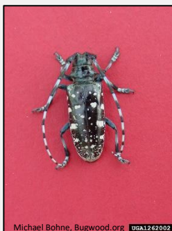
Adult female ALB