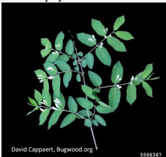
Bush honeysuckles species flower between May and June producing tubular, fragrant flowers. The flowers tend to be either yellowish white or pink.