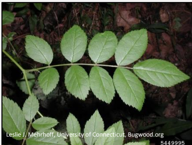
Leaves grow with 5, 7, 9, or 11 oval, saw-toothed leaflets.