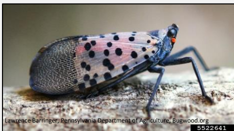
Adult SLF with wings closed.