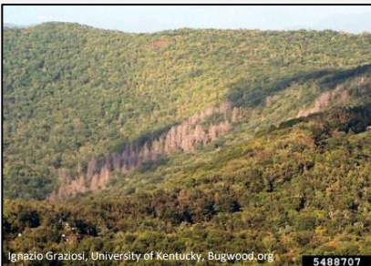
Eastern Hemlock dieback due to HWA.