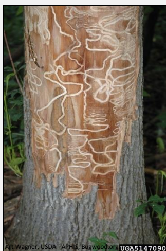
Feeding damage from the EAB larvae.