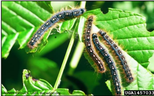
FTC larvae. Blue head with white/yellow keyhole markings on their back and blueish colored sides.