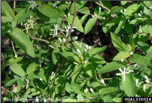
Bush honeysuckles species flower between May and June producing tubular, fragrant flowers. The flowers tend to be either yellowish white or pink.

(Lonicera maackii, Lonicera morrowii, Lonicera x bella, Lonicera standishii, Lonicera tatarica)