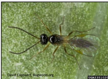
Parasitoid wasps and lady beetles are a few of the EHS's natural enemies.