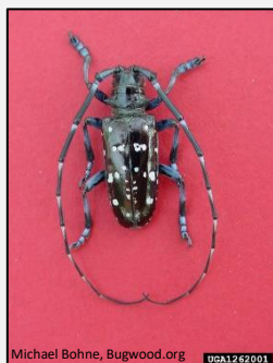
Adult male ALB