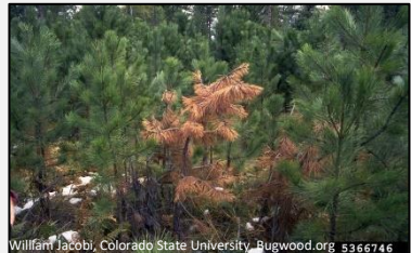
Browning of needles Armillaria root rot.