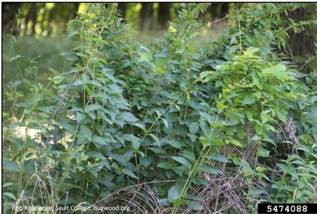
Both species have long, oval, opposite leaves about 3-4" long by 2-3" wide.