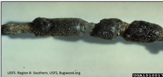
FTC egg masses. Laid/wrapped around twigs.