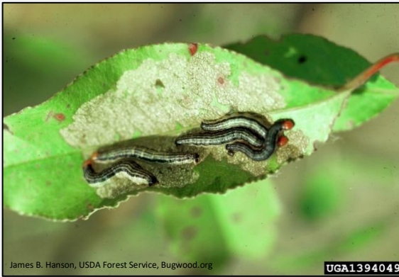
CSSM larvae feeding on cherry tree leaves.