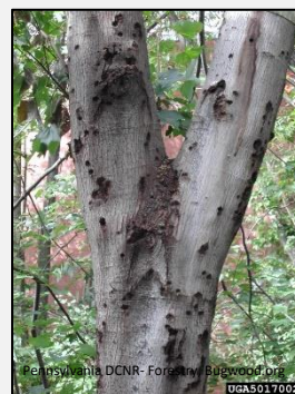
ALB infested tree