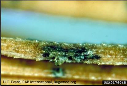
Fungi on White Pine needles.

(Leucosticte laticola & Lophophacidium dooksii)