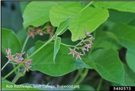
Pale Swallow-Wort flowers are star like and pink to maroon in color.