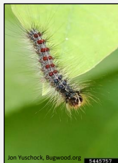
Gypsy Moth larvae. Yellow head with black markings, blue and red spots on the back.