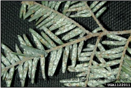
Eastern Hemlock branch infested with EHS.