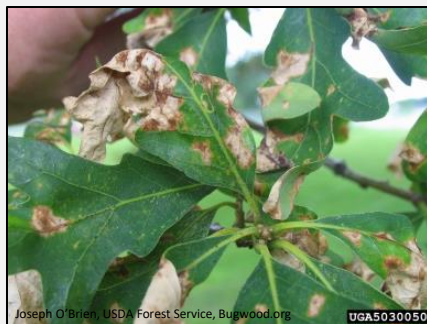
Brown dead spots on leaves caused by Anthracnose.