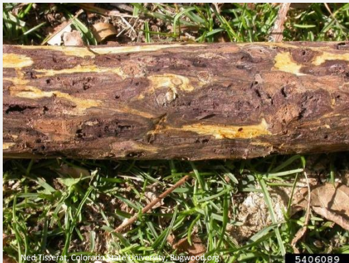
Branch cankers that have developed under the bark around WTB galleries.