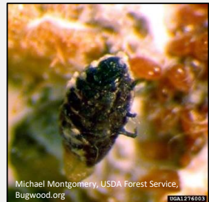
HWA adult with eggs in white woolly ovisac.