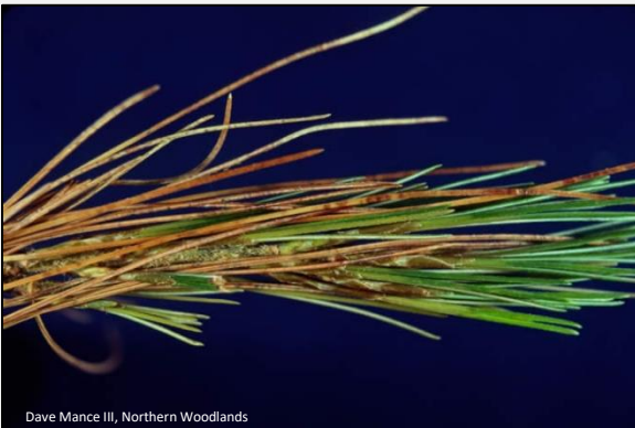
Yellowing of older needles resulting in a thinner canopy.