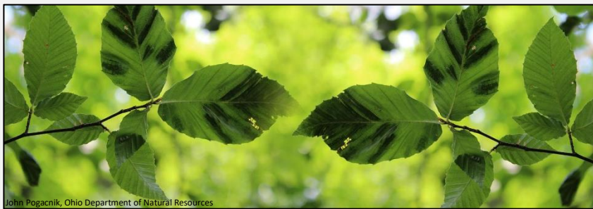
Dark green interveinal banding pattern on Beech foliage cause by BLD.