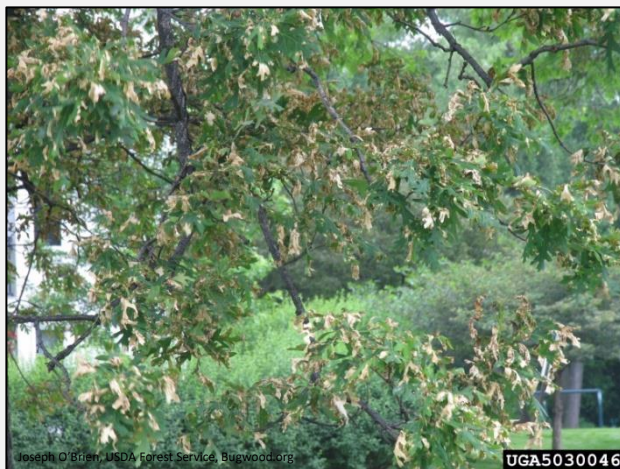
Crown dieback cause by Anthracnose.