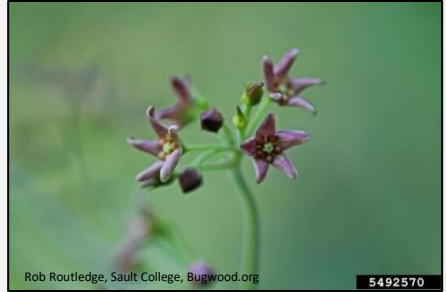
Black Swallow-Wort flowers are star-like and a deep purple to black color.