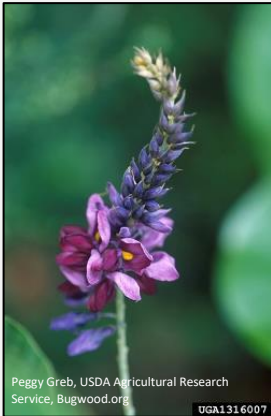
Peggy Greb, USDA Agricultural Research Service, Bugwood.org UGA1316007

Flowers are reddish to purple and are bloom in July-October.