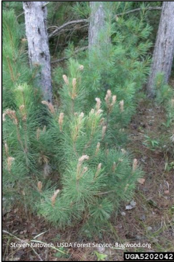
Needle dieback due to Diplodia Tip Blight.