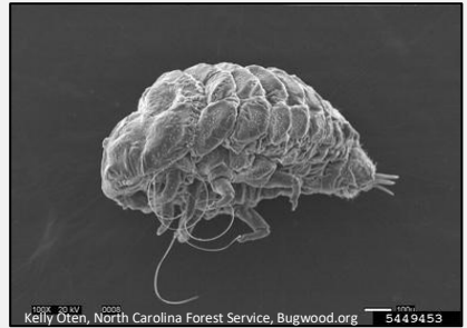
Magnified view of the HWA.