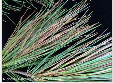
Yellowing of older needles resulting in a thinner canopy.