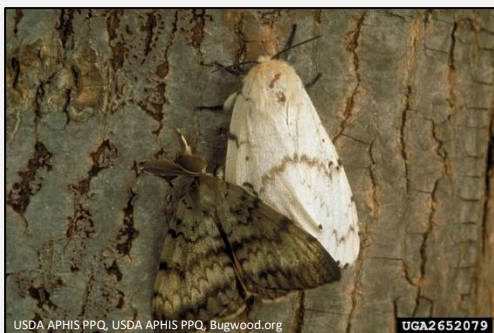
Gypsy Moth adults. Males are tan and females are white.