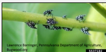
SLF early stage nymph. Black with white spots, found April-July. Size: 1/8" - 1/4".