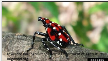
SLF late stage nymph. Red and black with white spots, found July-September. Size: 1/2".