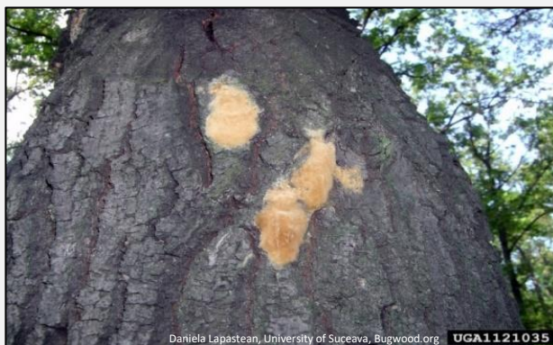
Gypsy Moth egg masses. Tan and covered with fine hairs, usually laid on tree bark. Typically, 1-3" long.