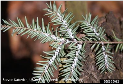
HWA infested Eastern Hemlock. These white woolly masses (ovisacs) are found at the base of the needles and house the HWA and its egg masses.