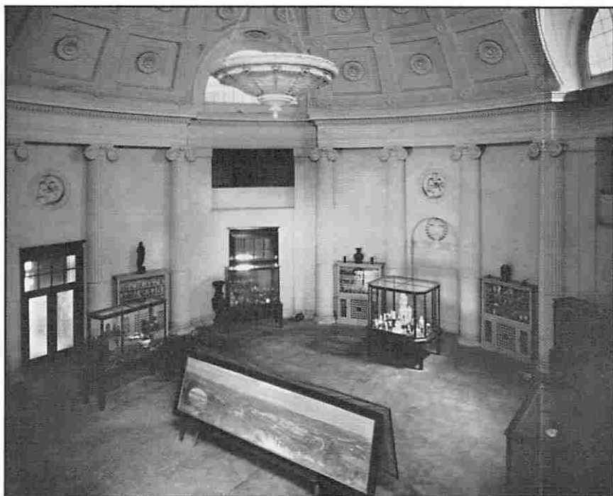
The Lower Rotunda as it appeared in the early days.