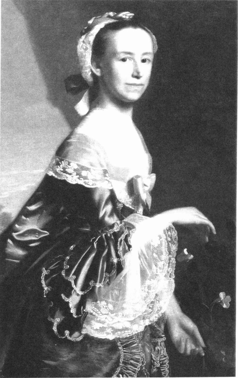
MERCY OTIS WARREN