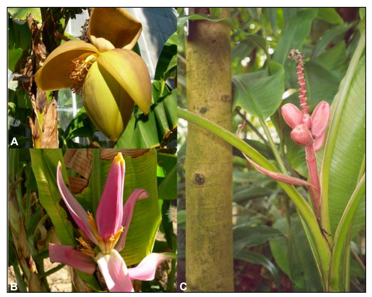
Figure 3. The flowers and fruit of many Musa species are conspicuous and appeal to horticulturally-inclined humans as well as to birds and bats: A. Musa basjoo von Siebold ex Y. linuma, University of California Botanical Garden, Berkeley; B. Musa ornata Roxb., local nursery, rural central Luzon, Philippines; C. Musa velutina H. Wendl. & Drude, Royal Botanical Gardens, Kew.