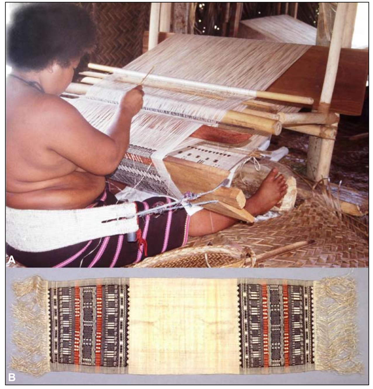
Figure 9 . On Fais, in the western Caroline Islands of Micronesia, prestigious traditional textiles called machi are still woven. Fiber from Musa cultivars forms the warp and weft, with decorative supplementary weft of Hibiscus sp. fiber. The ritual value of machi derives from their association with chieftainship. A . Weaving on a back-strap loom; B . Machi .

We should not, therefore, interpret archaeobotanical discoveries of banana parts by reference solely to what we know of the development of edibility in fruit. The cultivation of M. textilis and M. balbisiana for fiber show that seedy fruit is not necessarily an indication of 'wildness'. While parthenocarpy is the key to edibility of fruit, and its reproduction and transmission certainly depended upon vegetative propagation, other desirable characteristics of