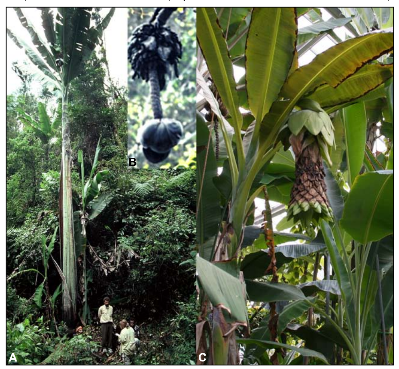
Figure 2 . Many Musa species grow to statuesque proportions and dominate the landscape. A , B . The largest is Musa ingens Simmonds, a New Guinea Highlands endemic; C . Ensete glaucum (Roxb.) Cheesman has a wide but scattered distribution from the Eastern Himalayan fringe to New Guinea.

All parts of the plant are useful, including seedy fruit, inflorescence, leaf, pseudostem, corm and rhizome; they furnish food, fodder, medicine, domestic materials and shelter. Plants also have ritual and ceremonial significance. Table 1 lists miscellaneous uses, other than consump-