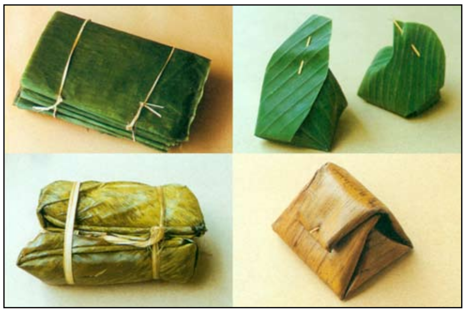
Figure 5 . Leaves are widely used for packaging, especially for food, as in these examples of Thai takeaways.

tion of seedless fruit, of Indo-Malesian Musaceae. Given the labyrinthine complexity of literary genres which might refer to bananas, I make no claim that this list is comprehensive in terms of uses or references; it is intended to be exemplary. I have revised the nomenclature, where possible, using the extensive cross-referencing of species names compiled by Constantine (1999-2008). For the sake of brevity, I have somewhat arbitrarily excluded African uses of Musaceae (genus Ensete Horan. is native there, but not genus Musa), while Polynesia and Micronesia are included because their cultural connec-