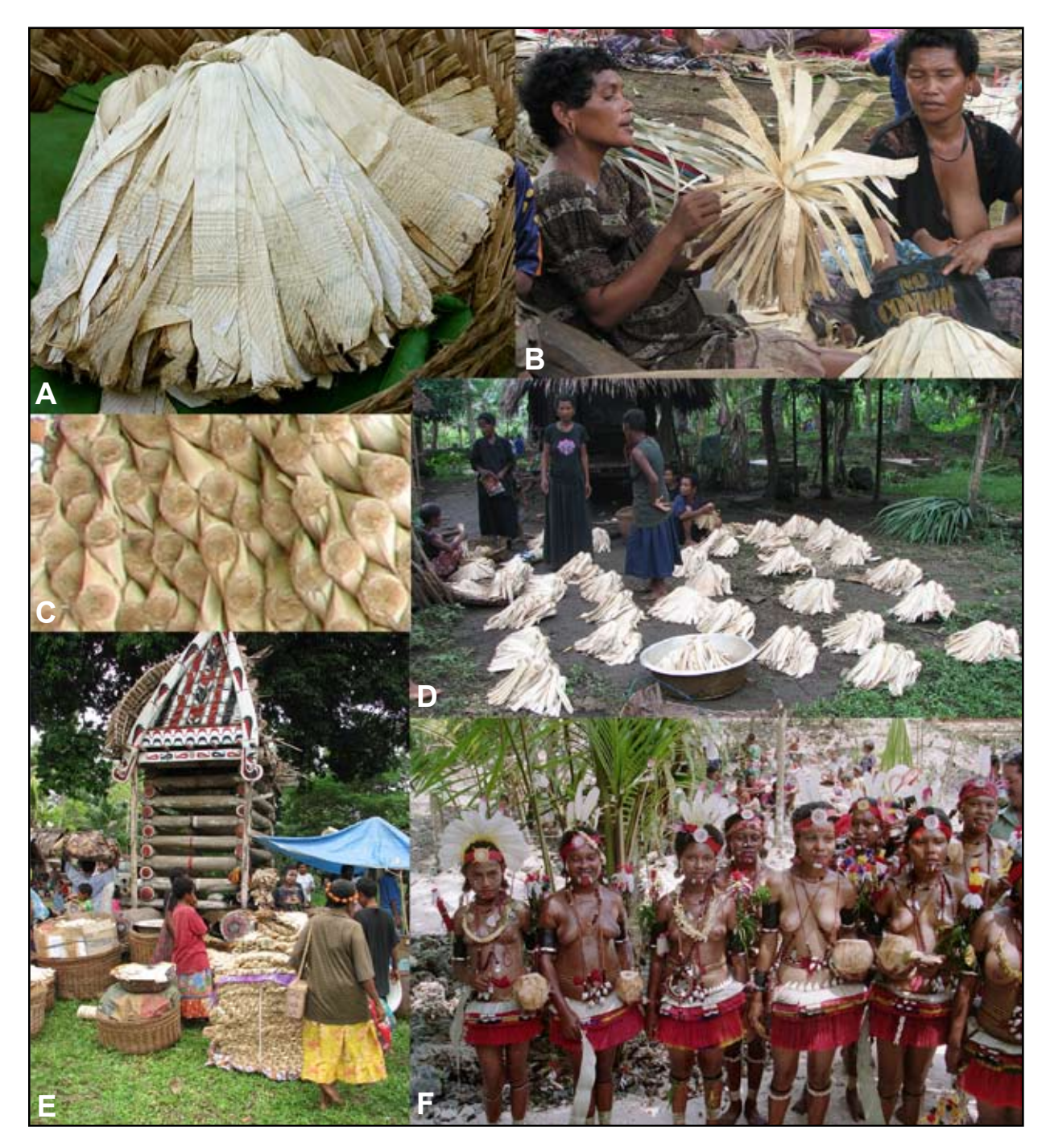
Figure 8. Banana leaf fiber is central to women's wealth (doba) in the Trobriand Islands, Milne Bay Province, PNG: A. The strips show decorative imprints; B. Tying prepared banana leaf strips into bundles; C. Close-up of piled bundles; D. Preparing bundles in readiness for a ceremony; E. Piles of doba in front of a yam house during a ceremonial exchange; F. Young women's skirts are also produced from banana leaf strips.

parallel selection for starch production in the corm and pseudostem of Malesian Musa species may also have occurred in the past. There is at least one example of selection for enhanced starch storage in the rhizome of a