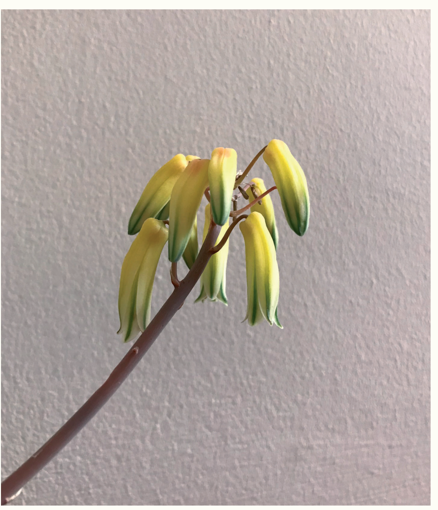
Fig. 3 Closer view of the yellow-flowered form of A. bakeri

Rauh (1995) described this as a species that "grows on sparsely covered granite outcrops near the fishing village Vinanibe, northwest of Tôlanaro. It grows in rock fissures which are deeply filled with a found loose humus and is with Euphorbia milii var. imperatae as well as the orchids Angraecum sesquipedale and A. eburneum var. xerophilum." In terms of the type of vegetation that this species forms a component part of, he says that "Aloe bakeri is not a typical element of the tropical rain forest but it is a component of a