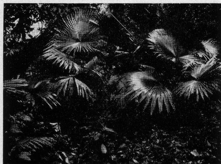
58. Seedlings of Livistona Jenkinsiana grown in a shady corner near Eyo village at 400 meters altitude, Siang Frontier Division, NEFA.

The inflorescence of this palm is interfoliar, producing many bisexual pedi-