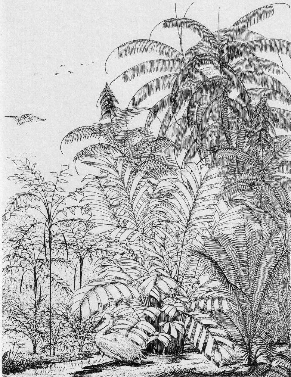
57. Podococcus Barteri (left), Sclerosperma Mannii (center), Ancistrophyllum laeve (upper center with terminal inflorescences,) and Ancistrophyllum secundiflorum (upper right) reproduced from Transactions of the Linnaean Society of London 24: pl. 38, 1864.

indication of the way in which juvenile and adult leaves in these scandent palms differ.