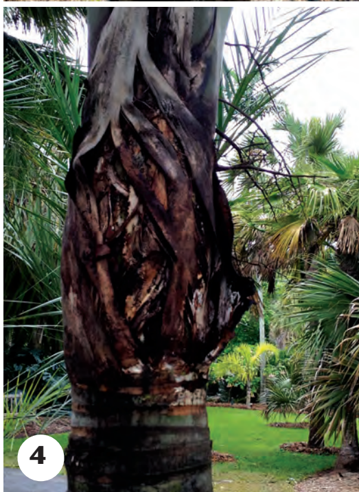
1–4. Symptom ranks (0–3) for Pseudophoenix decline. 1 (upper left). Rank 0; individual showed no symptoms of the decline and had a green crown shaft. 2 (upper right). Rank 1; individual was just beginning to show signs of decline and showed slight symptoms of the decline with slight brown or grey tint on the crown shaft. 3 (lower left). Rank 2; individual showed moderate symptoms of the decline and had a brown crown shaft, possibly with a few black lines or spots. 4 (lower right). Rank 3; individual showed severe symptoms of the decline and had large black cankers and the formation of holes in the crown shaft.