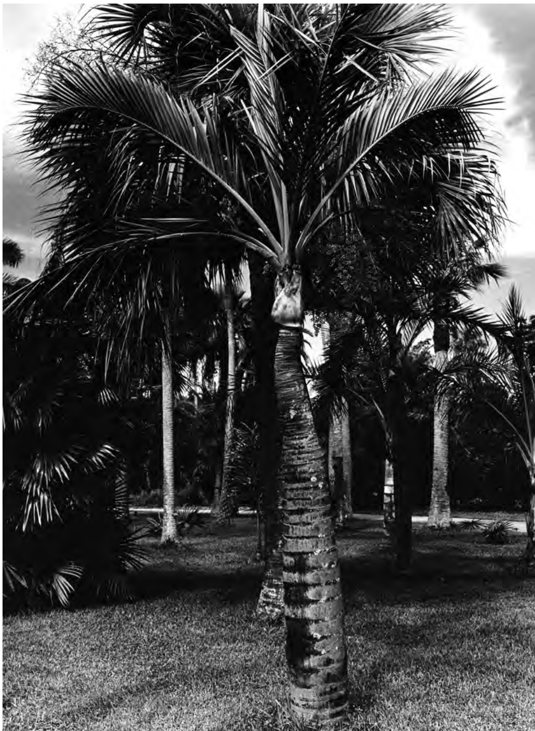
6. A picture from the Fairchild Tropical Botanical Garden archives taken in 1992 of a Pseudophoenix sargentii individual with discoloration on the leaf sheaths.

Decline was found in three of the four Pseudophoenix species. The two main factors found to be associated with progress of the decline were age and species of the individual. This study found no evidence that severity of