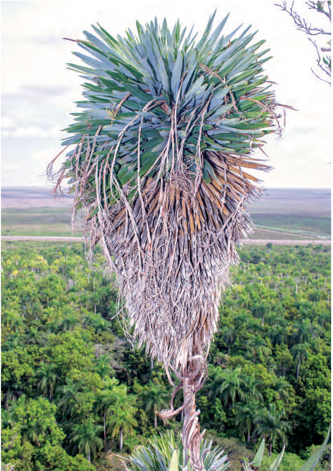
3. Hemithrinax ekmaniana is an unarmed, solitary, tree palm, to 7 m tall. The green, living and brown, dead, persistent leaves form an obovoid-shaped canopy.

Sagua la Grande," a community near the east end of Mogotes de Jumagua, a few kilometers from the city of Sagua La Grande (a mogote is