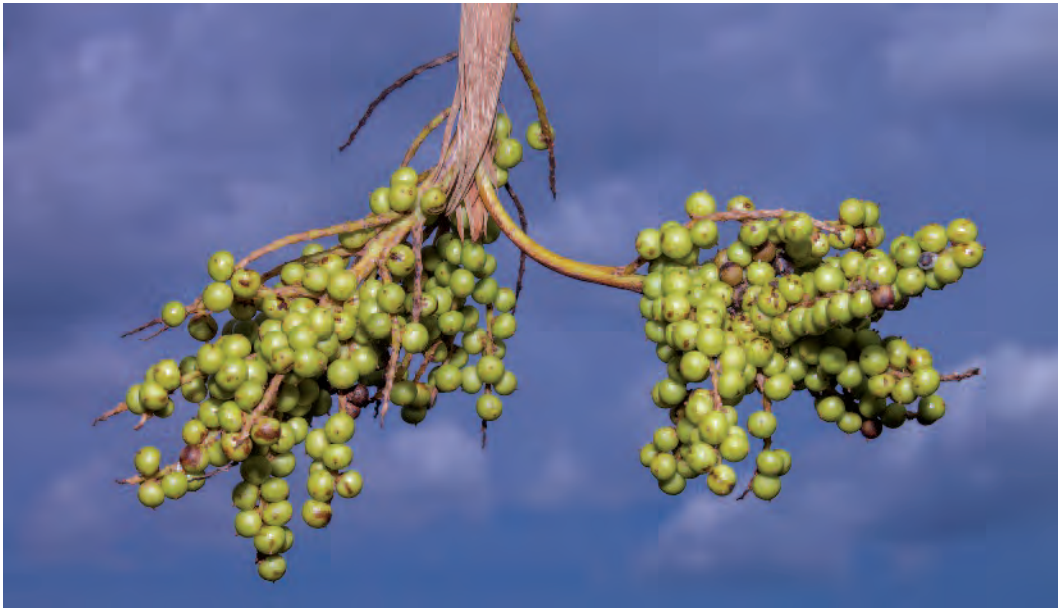
7 (top). Inflorescences in flower of Hemithrinax ekmaniana are ascending in flower. Note the densely placed flowers. 8 (bottom). Fruits of Hemithrinax ekmaniana are yellow to creamy at maturity and densely placed.

protruding conspicuously from among the leaves (Fig. 5); petiole to 10 cm long, 1.6 cm wide and 8 mm thick at base, 1.3 cm wide and