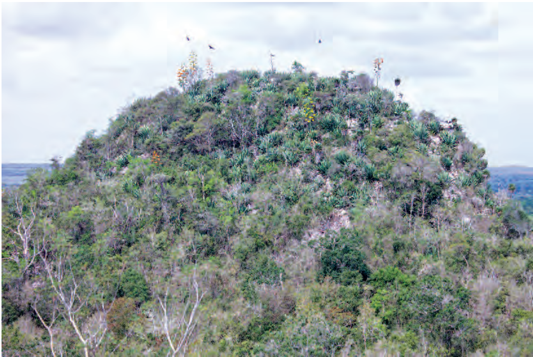
1 (top). Hemithrinax ekmaniana is endemic to the Mogotes de Jumagua, a set of eight, karst limestone hills surrounded by agricultural fields near Sagua La Grande, Villa Clara. 2 (bottom). Mogote no. 4 is one of three of the set of eight mogotes that has Hemithrinax ekmaniana . Note the barely visible palms on the north (right) side of the hill.

made in 1924 in central Cuba (Ekman 18536). Borhidi and Muñiz (1985) transferred it to Thrinax but later Lewis and Zona (2008), using mostly molecular data, returned it to Hemithrinax .