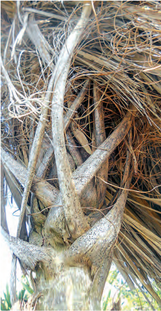
4. Leaf bases of Hemithrinax ekmaniana are split at the base.