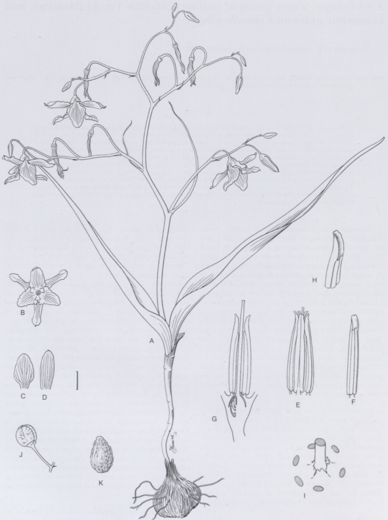
FIGURE 1.— Eremiolirion amboense , Mannheimer 2510 (NBG). A, whole plant; B, flower, front view; C, inner tepal; D, outer tepal; E, androecium; F, single anther, adaxial surface; G, half flower detail; H, tip of anther; I, detail of mouth of floral tube showing corona; J, capsule; K, seed. Scale bar: A–D, J, 10 mm; E–G, 2.5 mm; H, 3.75 mm; I, 1 mm; K, 2 mm. Artist: J.C. Manning.