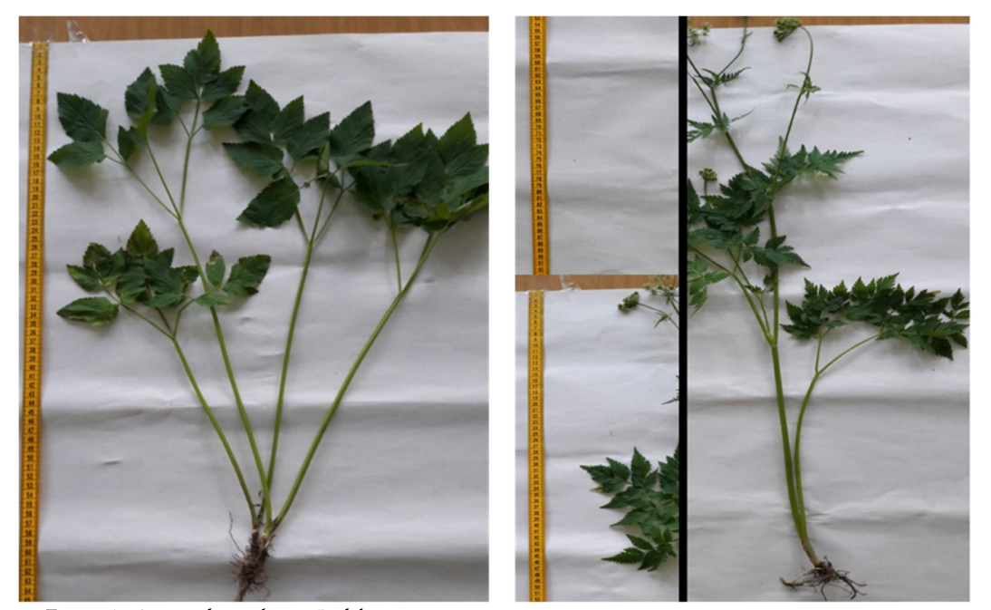
Figure 1. Aegopodium alpestre Ledeb

Aegopodium alpestre Ledeb. is a perennial grassy plant, growing to a height of 69.13 \pm 14.8 cm with rhizomes. The stem is hollow, furrowed, simple or slightly branching at the top. Both sides of the leaves are glabrous. Lower leaves are petiolate (attached to the stem by a petiole), and upper leaves are sessile (attached directly to the stem, lacking a petiole). The plates of lower leaves in the outline are broadly triangular, almost threefold; segments of its pinnate are dissected into ovate, pointed, incised-dentate lobes, about 3 cm long. The upper leaves have the lobes lanceolate and sharp. A compound umbel has 15 to 20 rays (floral branches), without involuces and involucels. These rays are angular, and the outer rays are much longer than the inner ones. The flower petals are 1 mm long, without clear tubules (Figure 1).