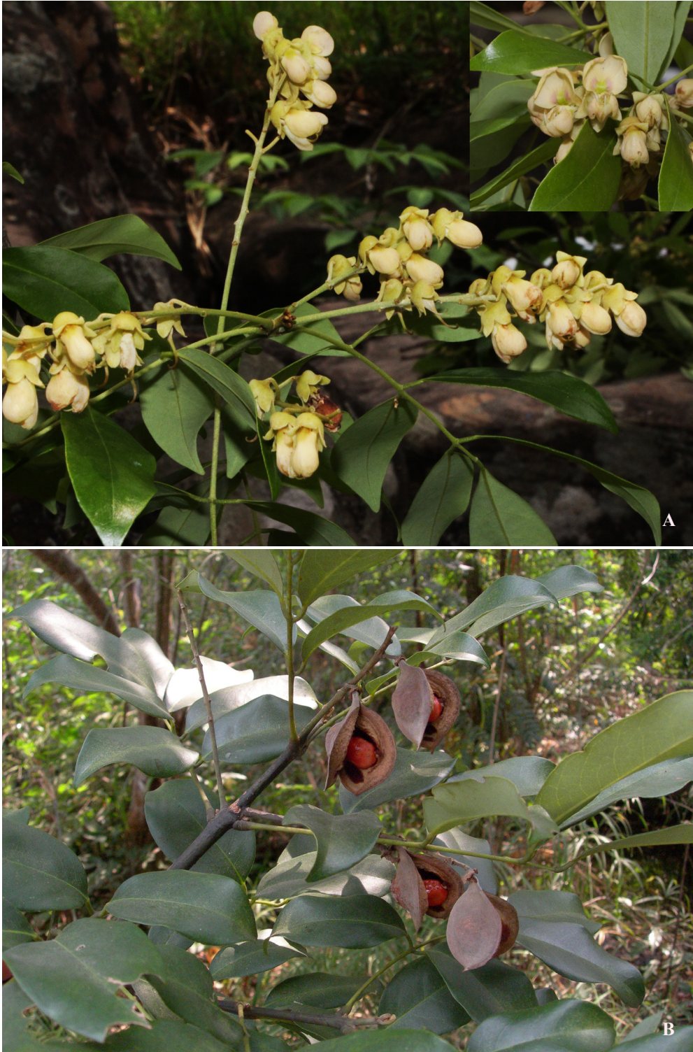
Figure 2 Ormosia mekongensis Mattapha, Suddee & Rueangr.: A. Inflorescences; B. Pods.