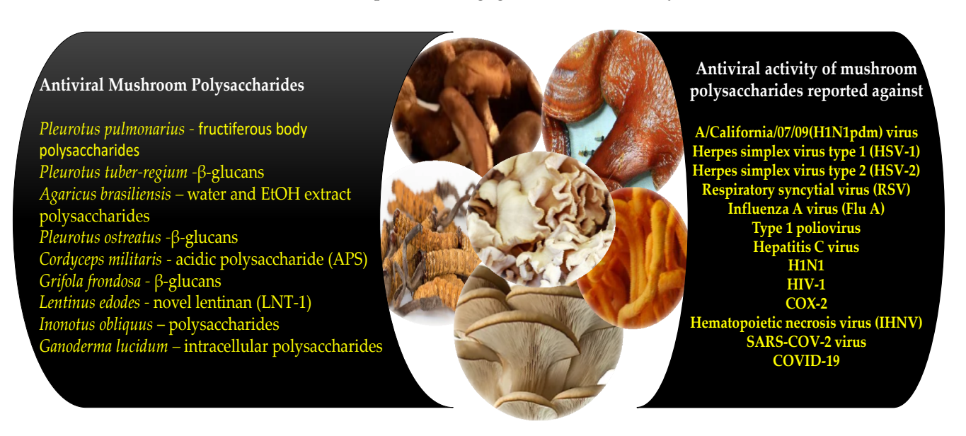
Figure 2. Overview of antiviral mushroom polysaccharides and impacted viruses.

The three mushrooms Pleurotus columbinus , Pleurotus sajor-caju , and Agaricus bisporus contain a myriad of bioactive compounds. Aqueous extracts of these mushrooms were tested against Ad7 and HSV2 viruses. The extracts show potent antioxidant effects. Pleurotus columbinus , Pleurotus sajor-caju and Agaricus bisporus mushrooms offer significant medicinal potential for the prohibition and treatment of a variety of ailments [308]. Figure 2 gives an overview of the comprehensive list of viruses and the mushroom polysaccharides that have been reported to engage in antiviral activity.