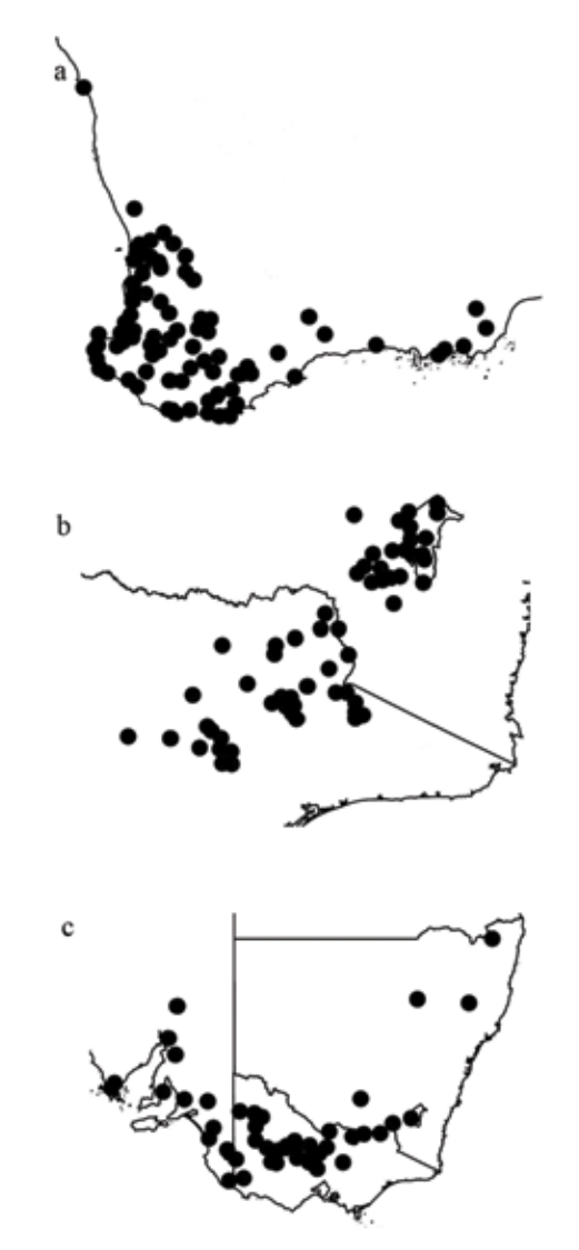
Figure 6. Distribution of a. Thelymitra macrophylla ; b. T. alpina ; c. T. megcalyptra

Notes: Plants consistent with Fitzgerald's description, illustration and notes on Thelymitra megcalyptra , and with the type collection, can still be found in southern New South Wales in the vicinity of the type locality and have been collected recently and studied. This taxon is relatively common and widespread throughout much of inland south-eastern Australia, but remains poorly known today due to the presence of several superficially similar taxa. The degree of inflation of the post-anther lobe is variable within and between populations,