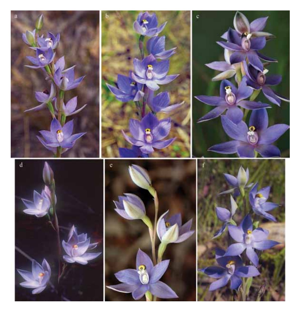
Figure 3. a. Thelymitra alcockiae , Tintinara, SA (photograph by J.A. Jeanes); b. T. imbricata , Campbelltown, Tas. (photograph by J.A. Jeanes); c. T. paludosa , Denmark, WA (photograph by A.P. Brown); d. T. nuda , Eaglehawk Neck, Tas. (photograph by J.A. Jeanes); e. T. graminea , Darling Ranges, WA (photograph by A.P. Brown); f. T. glaucophylla , Spring Gully C.P., SA (photograph by J.A. Jeanes)

Glabrous terrestrial herb. Tubers ovoid, 1–3 cm long, 5–12 mm wide, fleshy. Leaf linear to linear-lanceolate, 10–25 cm long, 5–12 mm wide, erect, fleshy, canaliculate, dark green with a purplish base, ribbed abaxially, sheathing at base, apex acute to acuminate. Scape 15–50 cm tall, 1.2–3.5 mm diam., slender to moderately stout, straight, green to purplish. Sterile bracts usually 2, rarely 1 or 3, linear to linear-lanceolate, 1.4–7 cm long, 3–9 mm