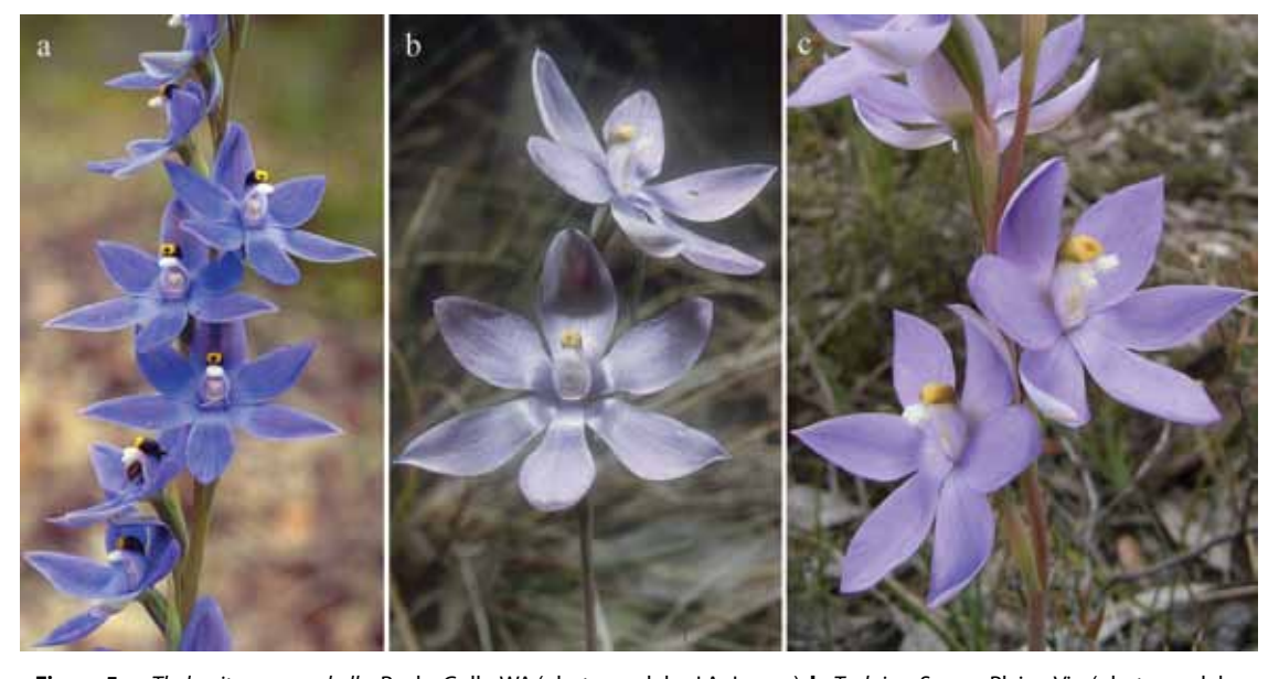
Figure 5. a. Thelymitra macrophylla , Rocky Gully, WA (photograph by J.A. Jeanes); b. T. alpina , Snowy Plains, Vic. (photograph by J.A. Jeanes); c. T. megcalyptra , Deep Lead, Vic. (photograph by J.A.Jeanes)