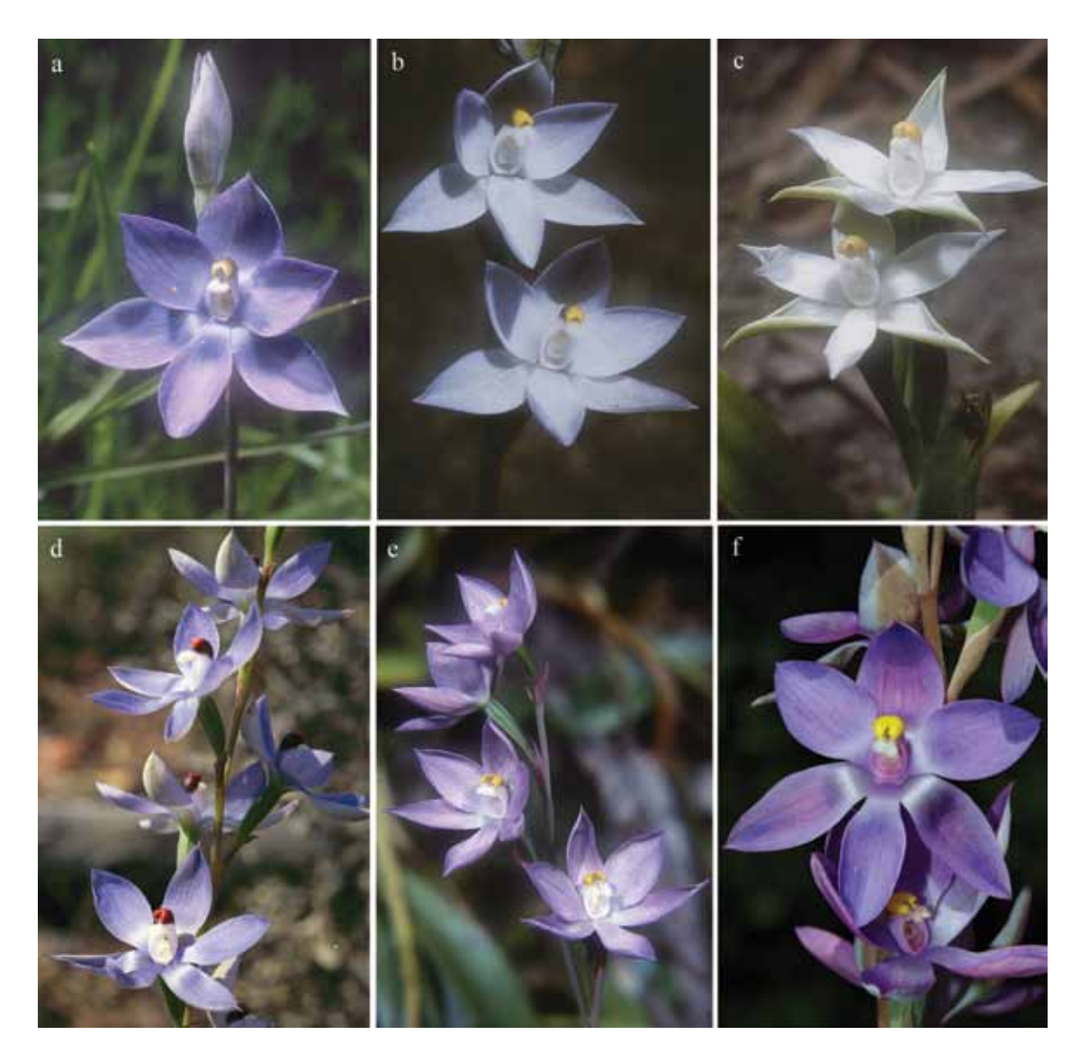
Figure 1. a. Thelymitra gregaria Derrinallum, Vic. (photograph by J.A. Jeanes); b. T. aggericola , Arthur River, Tas. (photograph by J.A. Jeanes); c. T. granitora , Walpole, WA (photograph by J.A. Jeanes); d. T. petrophila , Brookton, WA (photograph by J.A. Jeanes); e. T. fragrans , Gibraltar Range N.P., NSW (photograph by J.A. Jeanes); f. T. queenslandica , Herberton Range, Qld (photograph by B. Gray)

5–10 mm long, 1–3 mm wide. Flowers 2–10(–15), (15–)20–30(–40) mm across, usually pale blue to mauve, sometimes pink, opening freely in warm weather. Perianth segments (7–)10–15(–20) mm long, 3–8 mm wide, concave, often shortly apiculate; dorsal sepal ovate, obtuse to subacute; lateral sepals lanceolate to ovate, slightly asymmetric, acute to obtuse; petals ovate, obtuse to subacute; labellum narrow-ovate to lanceolate, acute, often smaller than other segments. Column erect from the end of ovary, (4–)5–7 mm long, 2–4 mm wide,