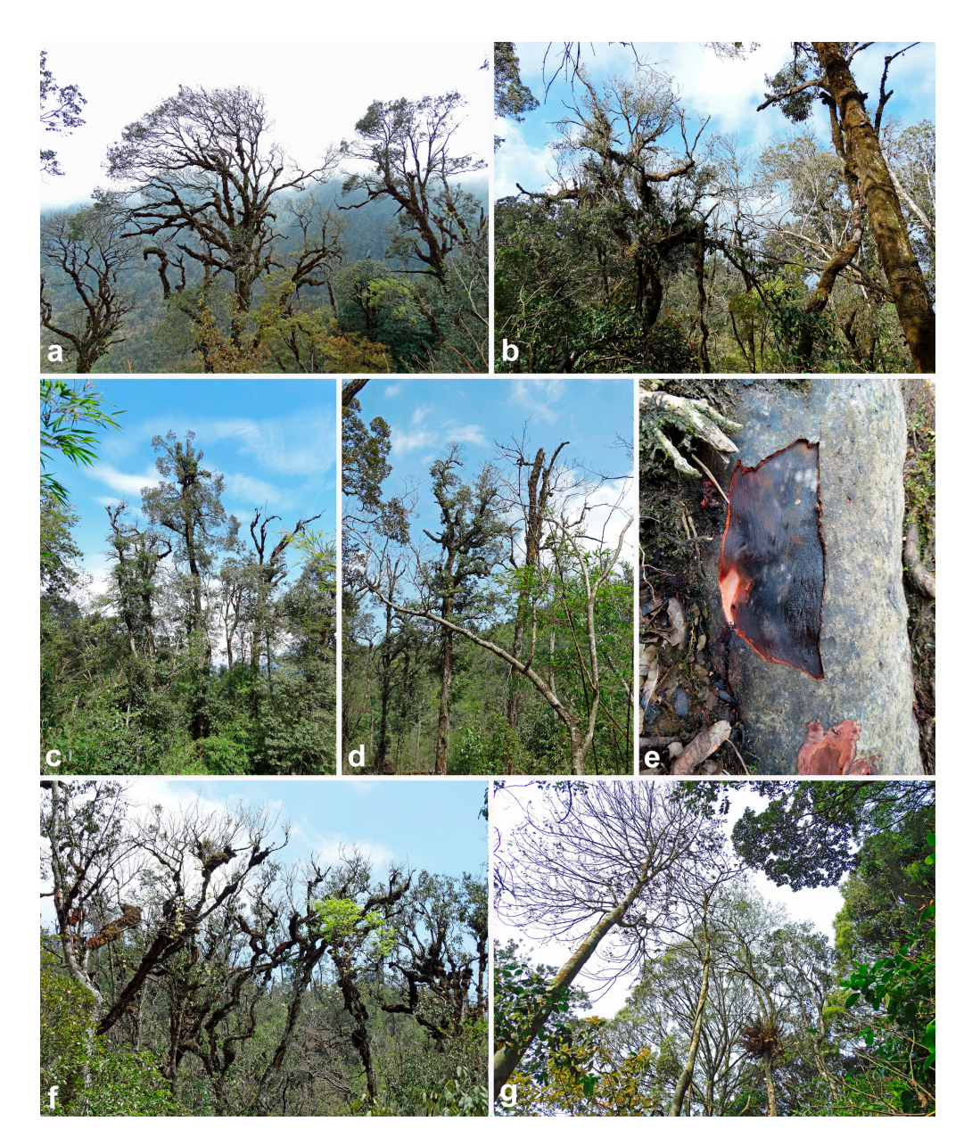
Figure 3. Disease symptoms of mature native trees in natural forest stands in Vietnam associated with presence of Phytophthora species in the rhizosphere; ( a – f ) montane evergreen cloud forests in Hoàng Liên National Park; ( a ) crown thinning and dieback of Quercus glauca in forest stand F03 (2337 m a.s.l.; P. cinnamomi A2); ( b ) crown dieback and mortality of Castanopsis acuminatissima and Neolitsea poilanei in forest stand F05 (2249 m a.s.l.; P. attenuata, P. castaneae, P. cinnamomi A2); ( c , d , f ) severe crown dieback and mortality of C. acuminatissima in a swampy depression of forest stand F06 close to stream R01 (2083 m a.s.l.; P. castaneae, P. cinnamomi A2, P. gregata ); ( f ) the white flowers and young leaves in the crowns of C. acuminatissima belong to the epiphytic Rhododendron leptocladus ; ( e ) bark lesion with staining of the underlying cambium caused by P. cinnamomi A2 on a surface root of C. acuminatissima in forest stand F07; ( g ) mortality of Dysoxylum juglans in suptropical humid evergreen forest stand F15 in Ba Vì National Park (1108 m a.s.l.; P. sp. attenuata-like 3).

For the isolation of Phytophthora spp. from the 16 rivers and streams, an in-situ baiting technique was used [10,11]. Twelve of the 16 riparian baiting sites were located inside or downstream of natural forests (Figure 2c). At each site, 15–20 non-wounded young leaves of the native C. indica, Citrus sinensis, L. bacgangensis, Q. glauca, and, in some cases, Carpinus sp., C. hodginsii, Cinnamomum iners, Dipterocarpus alatus, Prunus sp., Q. gilva and A. mangium were placed as baits in a 25 × 30 cm raft, prepared using