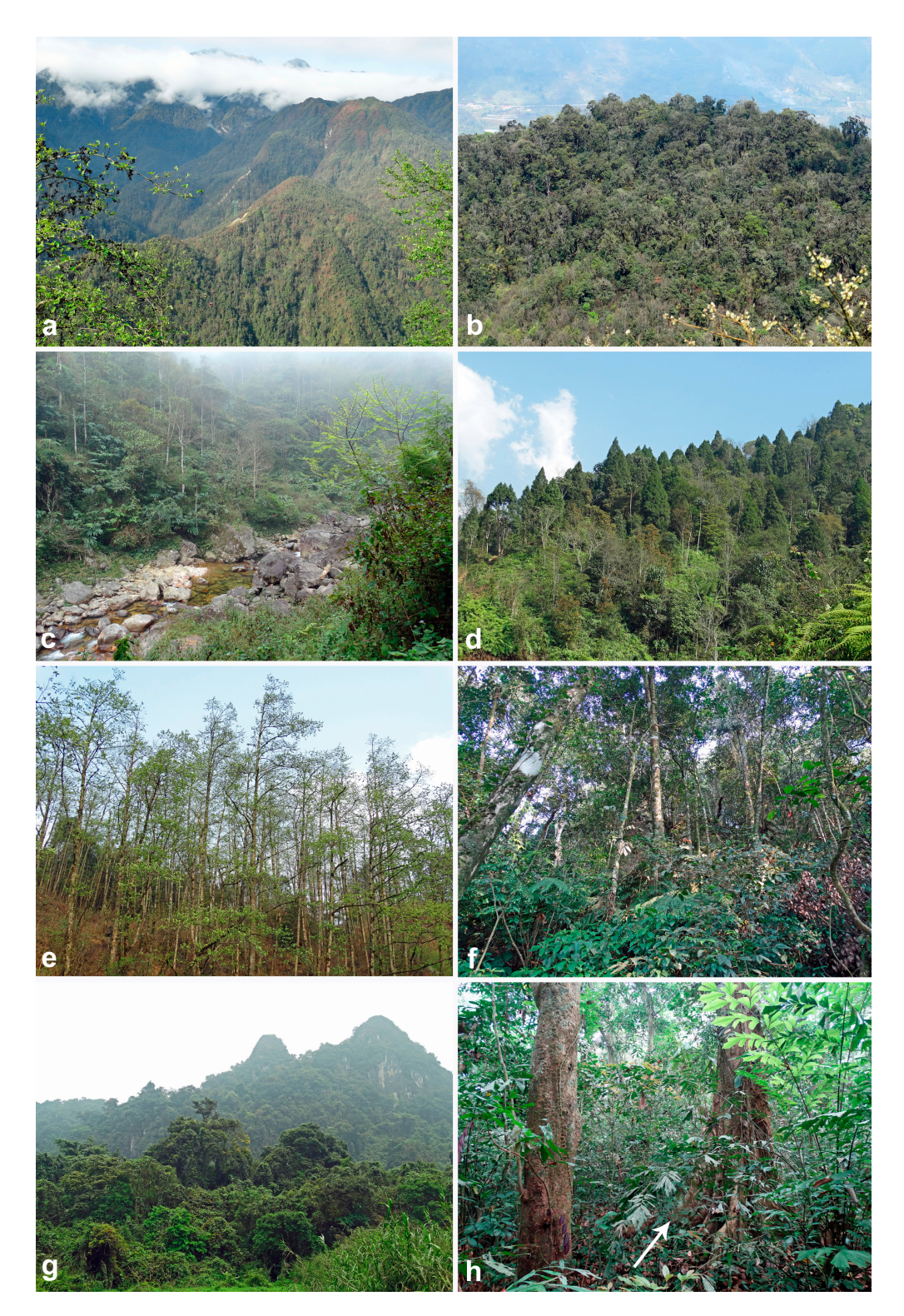
Figure 2. Representative forest stands and streams sampled in Vietnam; ( a ) Hoàng Liên National Park around the Fansipan mountain with diverse montane evergreen cloud forests and montane evergreen broadleaved forests; ( b ) diverse montane evergreen cloud forest F04 in Hoàng Liên National Park dominated by Fagaceae and Lauraceae species; ( c ) Cat Cat River (R10) running through a diverse montane evergreen forest in Hoàng Liên National Park; ( d ) montane Chamaecyparis hodginsii—Quercus forest on Sau Chua mountain; ( e ) montane Alnus nepalensis stand on Xin Chài mountain; ( f ) diverse, suptropical, humid evergreen forest F15 in Ba Vì National Park; ( g ) Cuc Phuong National Park with diverse, tropical, evergreen lowland rainforests growing on limestone; ( h ) diverse, tropical, evergreen lowland rainforest see Tables 1 and 2; for location of sites see Figure 1.