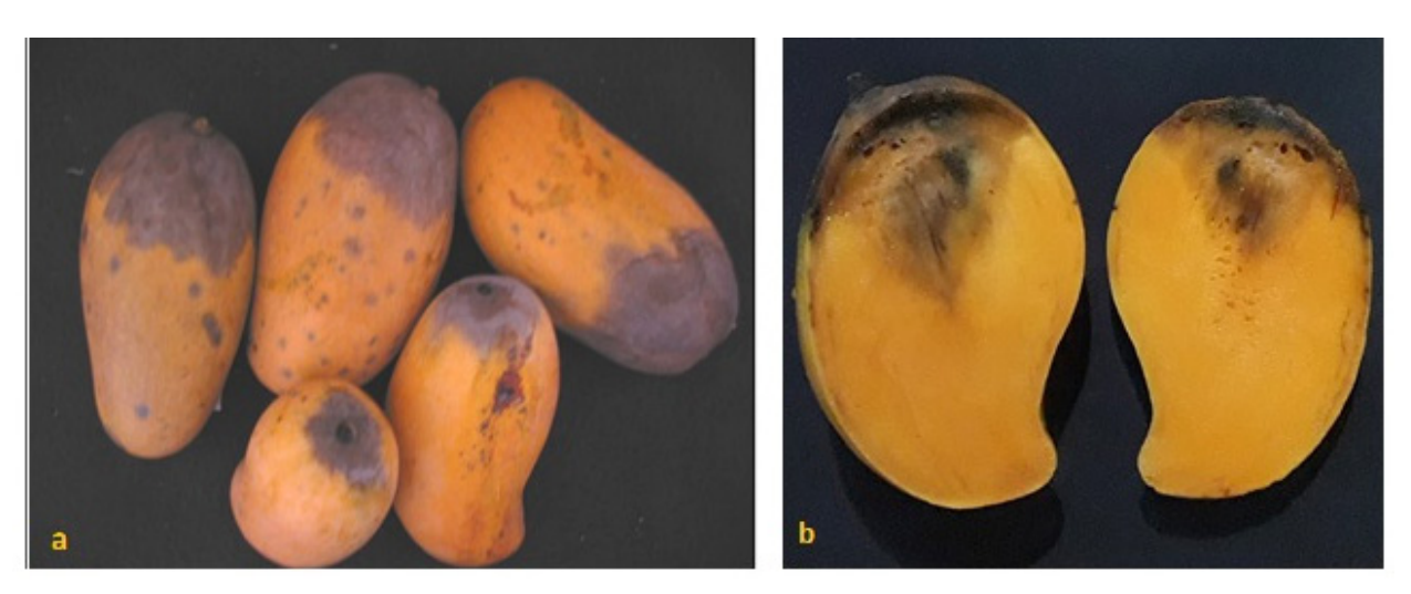
Figure 1: (a) External symptoms of SER on ripe mango fruit, and (b). A vertically halved mango fruit showing internal pulp symptoms due to SER.

The stem-end rot is recognized as a major postharvest disease in ripe avocado ( Persea americana Mill.) fruit. Unripe fruits are usually free from visible symptoms or characteristic decay lesions develop during fruit ripening.