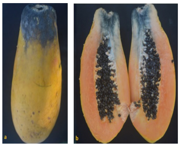
Figure 4: (a) Ripe papaya fruit showing SER symptoms due to L. theobromae infection, shrunk stem-end with black color outer mycelial growth, and (b) Vertically halved papaya fruit showing a large area of softened pulp and blackish fungal growth.

Figure 3: (a) External symptoms of SER on ripe avocado fruit, and (b). A vertically halved avocado showing internal pulp symptoms due to SER.