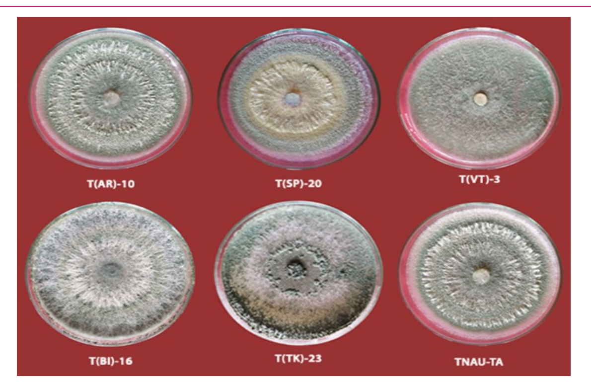
Fig.1. Isolates of Trichoderma spp.