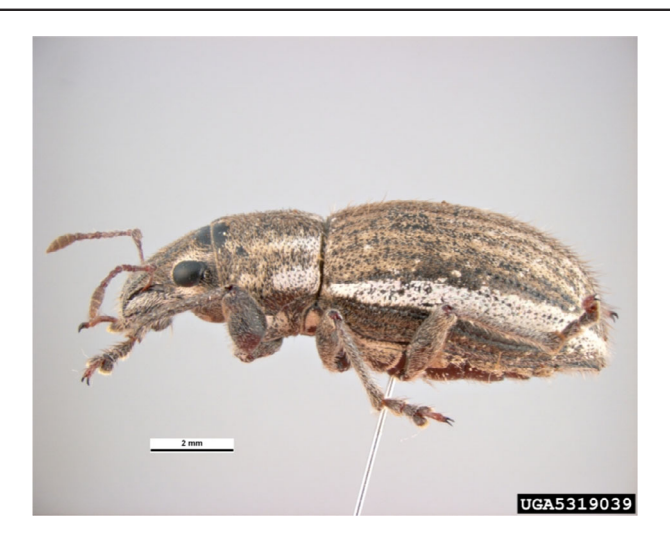
Figure 1: Naupactus leucoloma

Yes. The identity of Naupactus leucoloma Boheman is established.