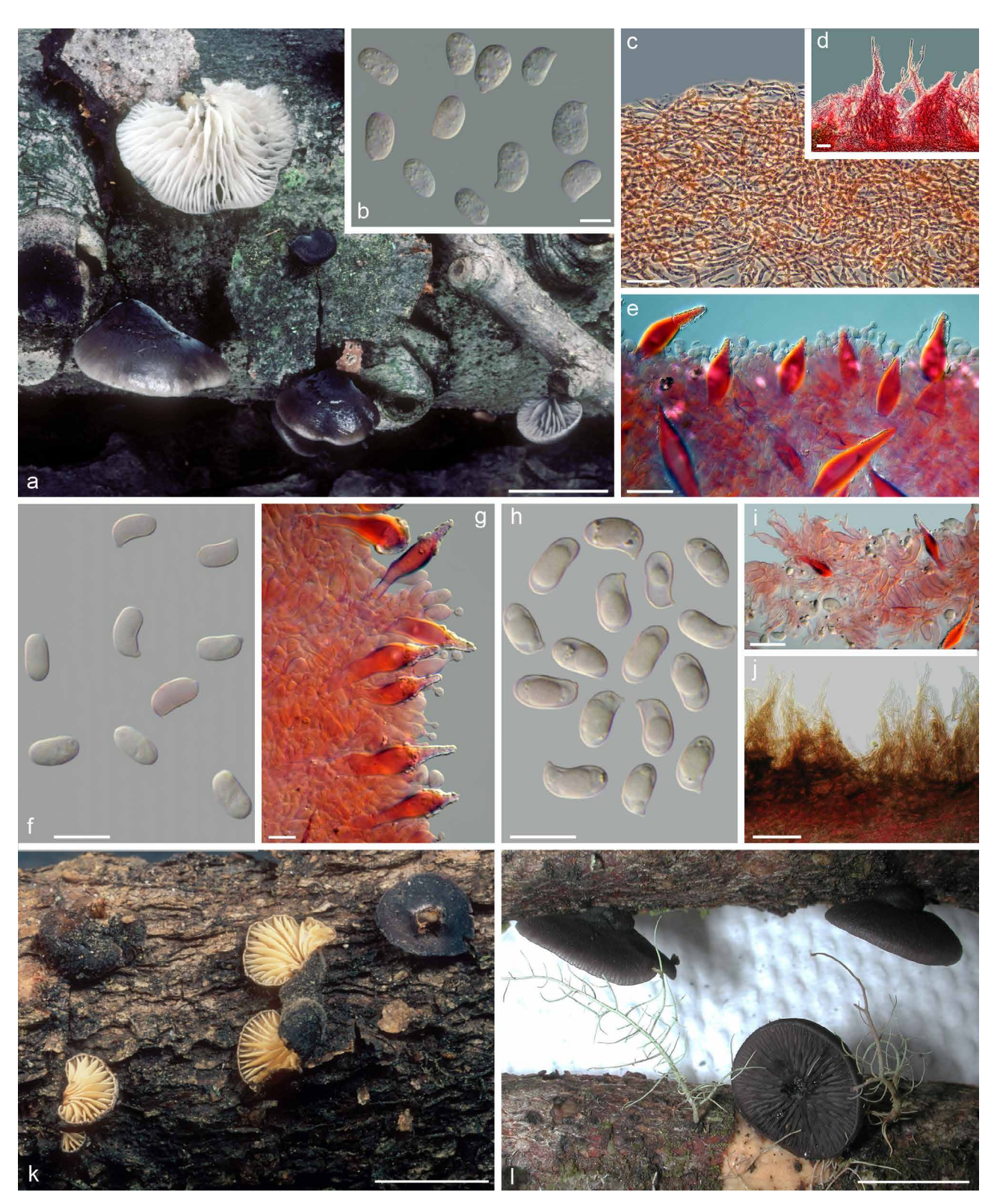
Fig. 2 Macro- and micromorphology of Hohenbuehelia species. — a-e. Hohenbuehelia algonquinensis RGT 870601/12 (holotype). a. Fruiting bodies, on Pinus strobus in Algonquin Park, Ontario; b. basidiospores; c. pileipellis; d. tufts of pileipellis hairs; e. cheilocystidia and cheilometuloids. — f-g. Hohenbuehelia canadensis . f. Basidiospores, DAOM 46785 (holotype); g. cystidia from the gill edge, including lanceolate, thick-walled cheilometuloids with apical incrustation and lecythiform, thin-walled cheilogloeosphex cystidia with apical capitulum surrounded by mucoid droplet, DAOM 195907. — h-k. Hohenbuehelia nimueae . h. Basidiospores of RGT 871128/01; i. cheilocystidia and cheilometuloids of RGT 871128/01; j. vertical section of pileipellis of RGT 871128/01; k. fruiting bodies of RGT 970530/01 on Abies lasiocarpa in Wyoming. — I. Resupinatus niger , fruiting bodies of RGT 010805/01, on unidentified hardwood, San Gerardo de Dota, Costa Rica. — Scale bars: a, k-l = 1 cm; b = 5 µm; c-e, i = 20 µm; f-h = 20 µm; j = 50 µm.