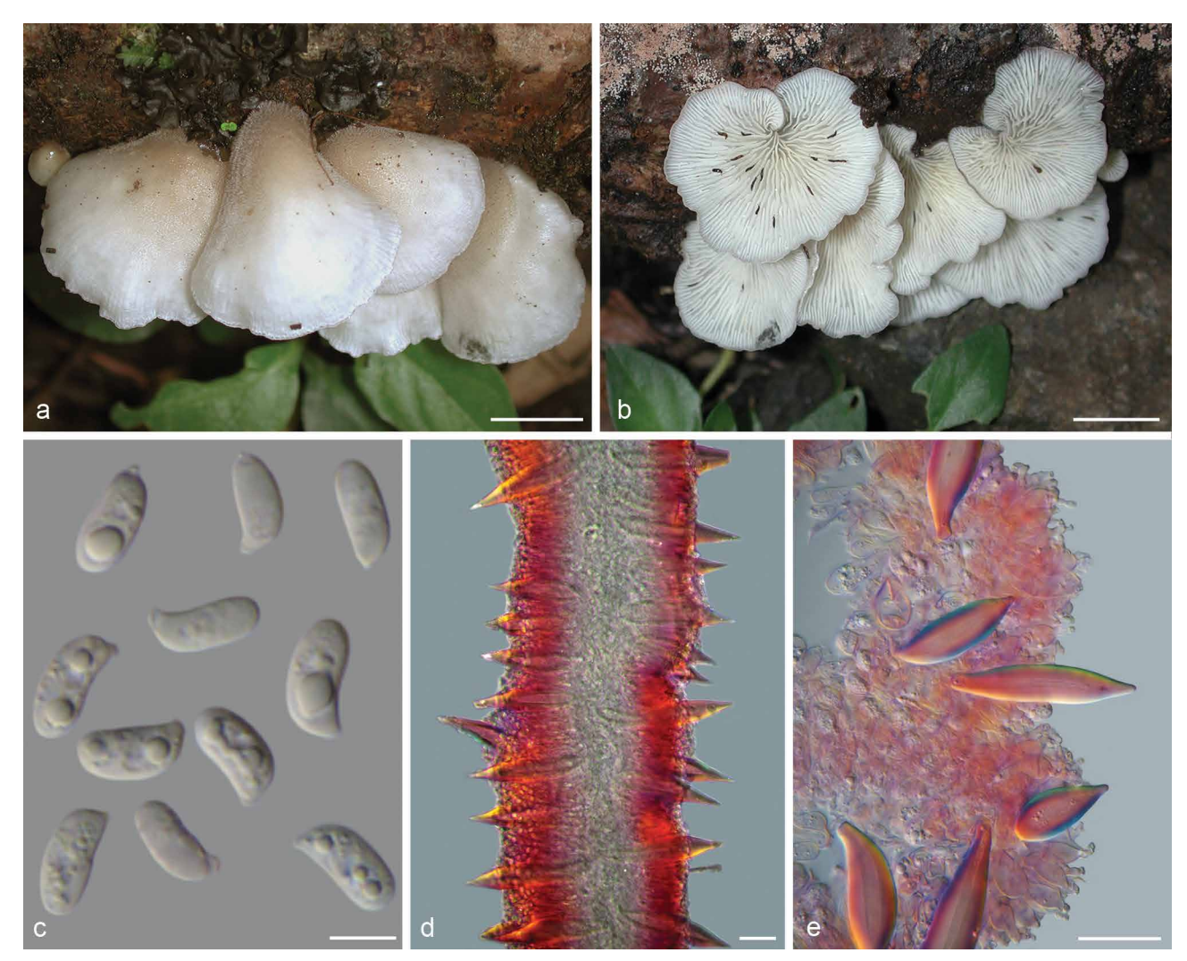
Fig. 3 a-e. Hohenbuehelia carlothornii . a-b. Under- and upper-side of fruiting bodies of RGT 040611/01 (paratype, INBio); c-e microscopic features of RGT 990707/02 (holotype, UWO); c. basidiospores; d. vertical section of lamella showing origin of metuloid pseudocystidia in lamellar trama; e. cheilocystidia and cheilometuloids. — Scale bars: a-b = 1 cm; c = 5 \mu \text{m} ; d-e = 20 \mu \text{m} .

Holotype . COSTA RICA, Puntarenas Province, Wilson Botanical Garden near San Vito, West Bank Trail at top of stairs past Rio Jaba, approx. N8.788° W82.964°, on dead log and adjacent fallen branches in wet primary Premontane Rain Forest (Holdridge 1971) at approx. 1080 m, 7 July 1999, R.G. Thorn #990707/02 (UWO, isotype AMB n. 18106), ex-type culture at UWO and INBio.