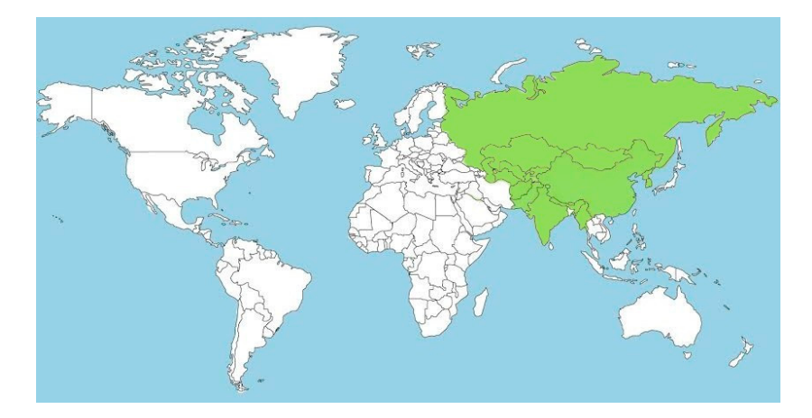
Figure 1. A world map showing the geographical distribution of Bergenia species (in green).

The plant family Saxifragaceae encompasses 48 genera and 775 species, which are mostly distributed in South East Asia. The name "Bergenia" was coined by Conrad Moench in 1794, in the memory of Karl August von Bergen (German botanist and physician). Genus Bergenia harbors 32 species of flowering plants, including highly valued ornamental, rhizomatous, and temperate medicinal herbs [16]. Central Asia is the native place for genus Bergenia [26,27]. The geographical distribution of 32 species of genus Bergenia are detailed in Figure 1, which depicts the worldwide distribution through the map. In China, seven species are reported from three provinces and two autonomous regions: Shanxi, Sichuan, and Sanxi and Tibet and Xinjiang, respectively. Among the seven species, four ( B. yunnanensis , B. scopulosa, B. emeiensis , and B. tianquanensis ) are endemic to China [28–30].