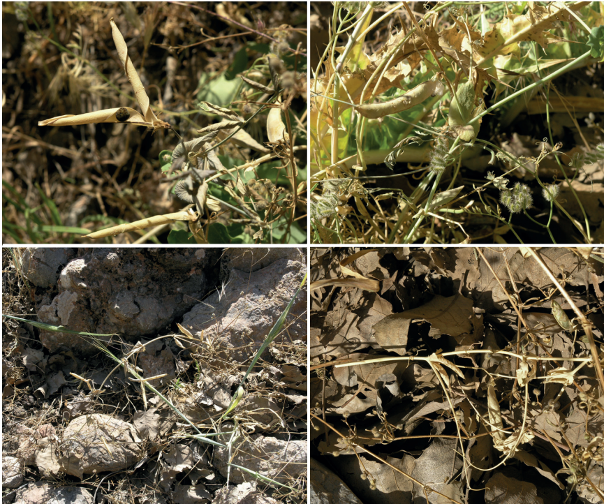
Fig. 4. Plants of P. sativum subsp. elatius of the population at Istgah-e Bisheh village.