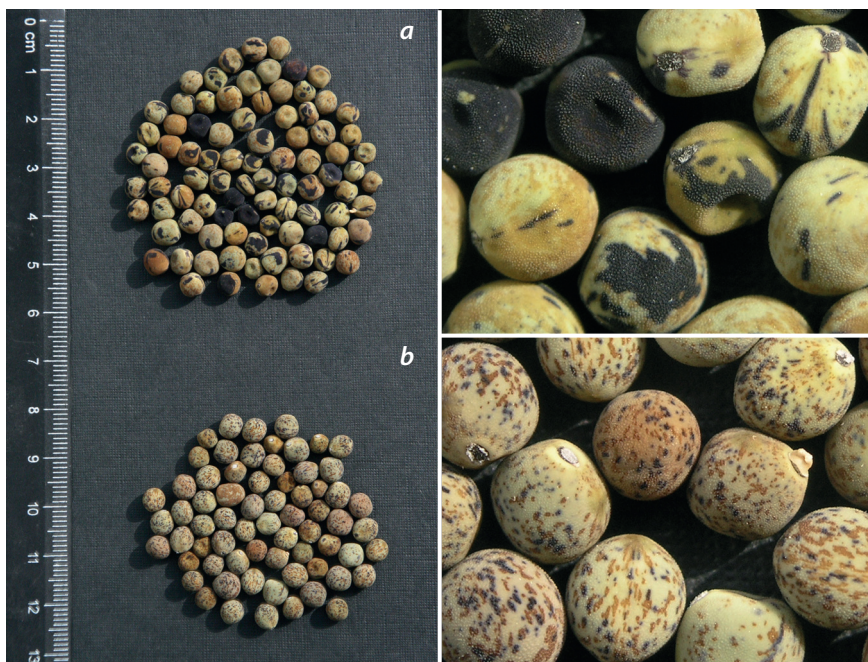
Fig. 5. The seeds of wild pea accessions CE9, originating from a population at Kagelestan-e Bar Aftab village (a), and CE10, originating from a population 6.7 km NW of Istgah-e Bisheh village (b).

to weevil oviposition (Berdnikov et al., 1992). In total 87 seeds were collected, of them 24 appeared infested by the pea weevil. One of those seeds gave rise to accession CE10 (= W6 56890 in the USDA GRIN).