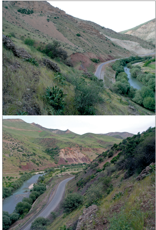
Fig. 1. The habitat of wild peas in Iran, Ostan-e Lorestan, Shakhrestan-e Aligudarz, Bakhsh-e Besharat, at Kagelestan-e Bar Aftab village.

A wild pea population was found on May 23, 2017 in Iran, Ostan-e [Province of] Lorestan, Shakhrestan-e [County of] Aligudarz, Bakhsh-e [District of] Besharat, 700 m N of the centre of Kagelestan-e Bar Aftab village, at 33°02'13" N,