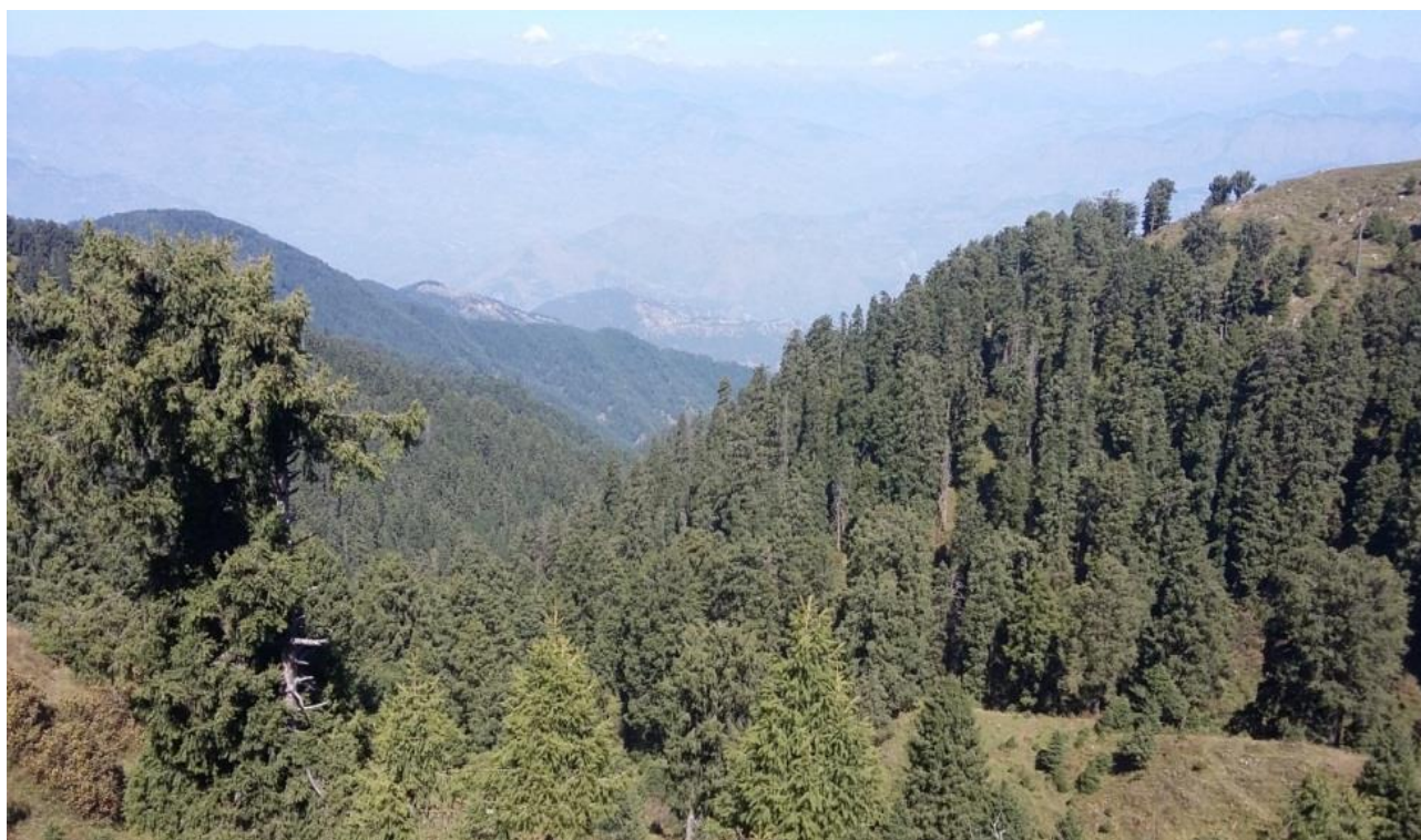
Fig. 1 – Collection site of Capnodium berberidis on Berberis lycium (Jot Pass, Chamba, Himachal Pradesh).